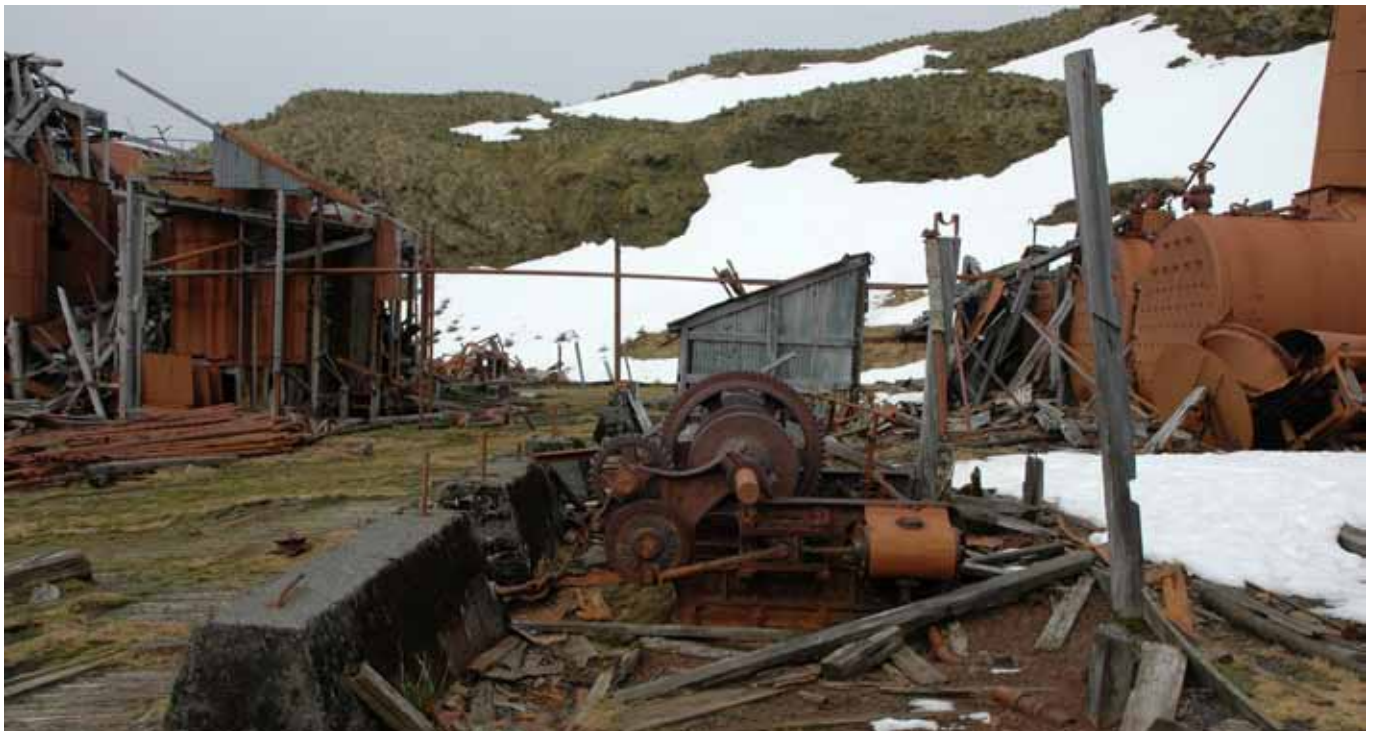
9.4 General view of the remains of the Winch House