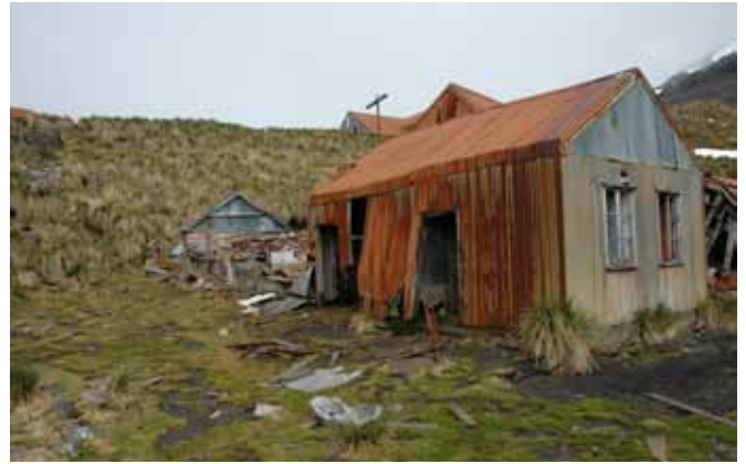
23.2 The north and east sides of the Bakery