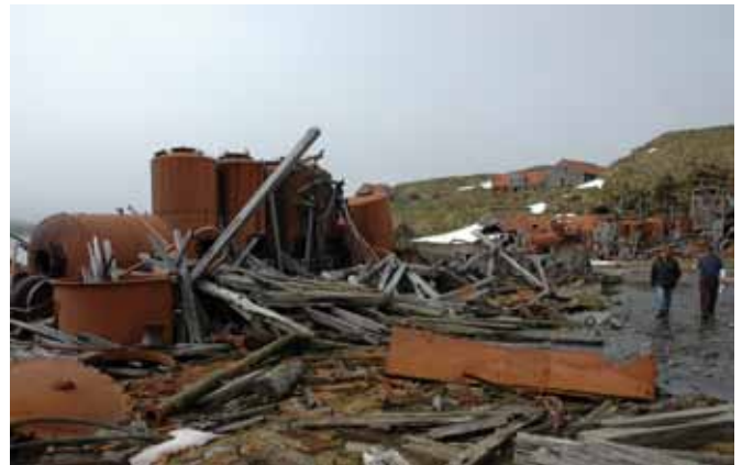
4.2 The remnants of the building looking southwards