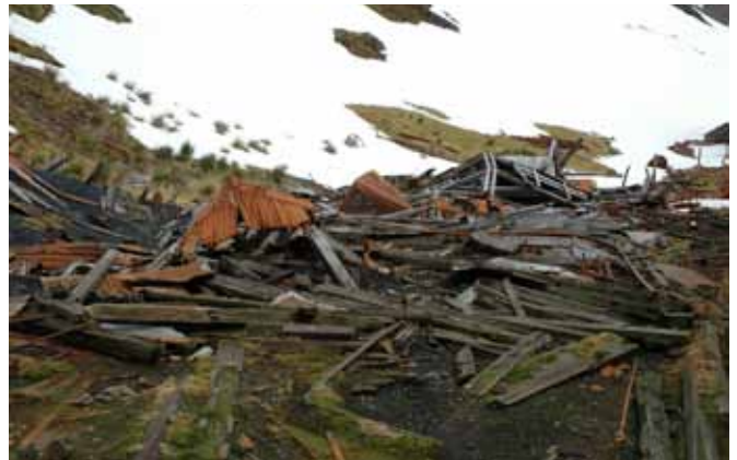
15.1 The remains of the Blacksmith's Shop looking west