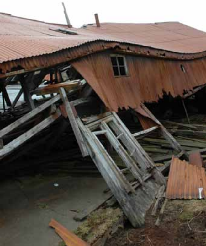
22.5 Detail of the centre of the south elevation