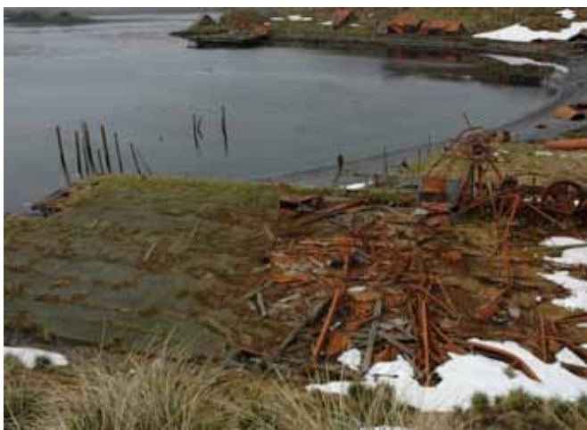
6.5 The east end of the building looking south