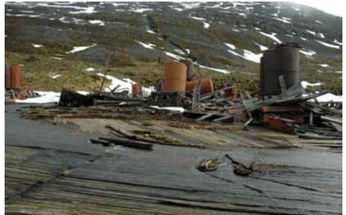
1.1 Looking north to the Lower Meat Cookery

The Plan is still clearly defined by the remains of the surrounding buildings. At its lower (eastern) edge it is approximately a metre above sea level. There is little left of the whale slip or jetty in this area as this is now where the stream flows into the sea. The boarding of the Plan largely remains in place, 250x50mm thick, the main part is laid east/west up the slope. The boarding is laid at roughly 45° to the main area where it runs up between the two meat cookeries. The stream which originally ran down to the north of the Plan area now runs across it. This is speeding up the decay of the Plan itself and is also affecting the remains of the lower meat cookery (Building No.4).