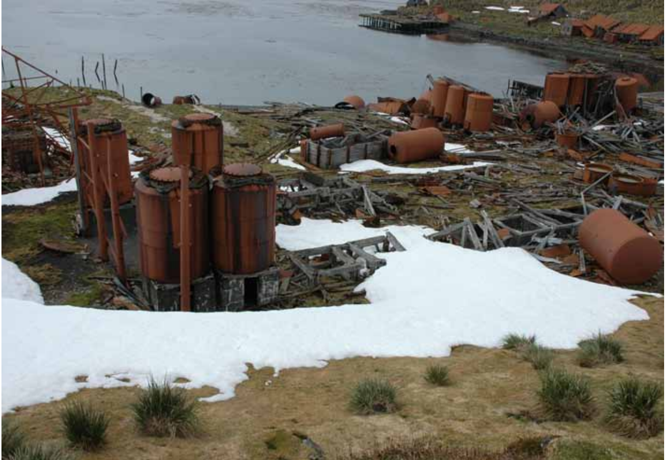
5.2 General view over the Bone Cookery from the higher ground to the northwest