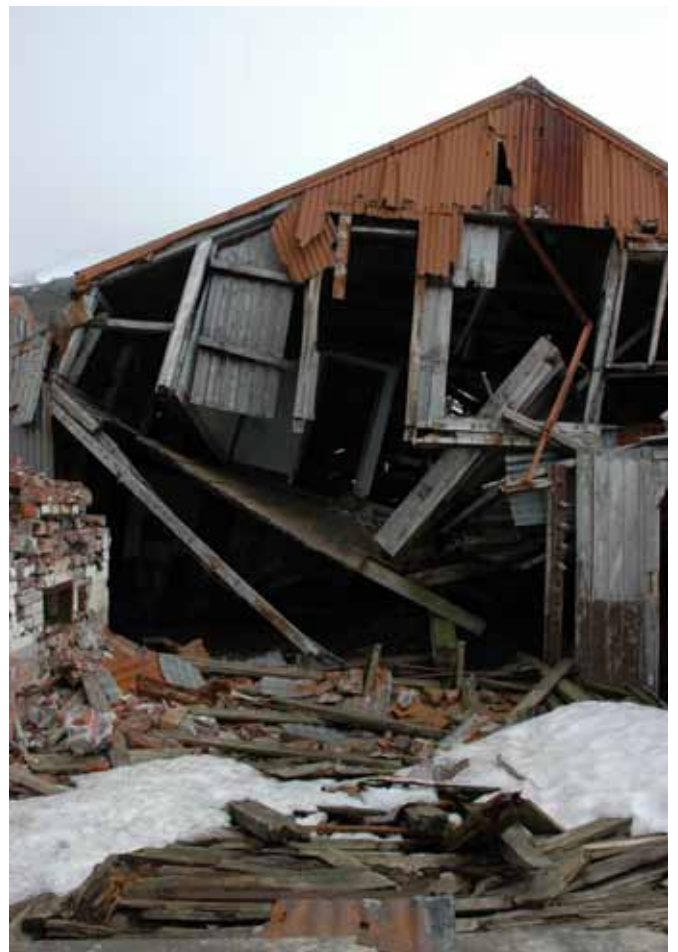
22.6 The remains of the east elevation showing that the building was two storeys high