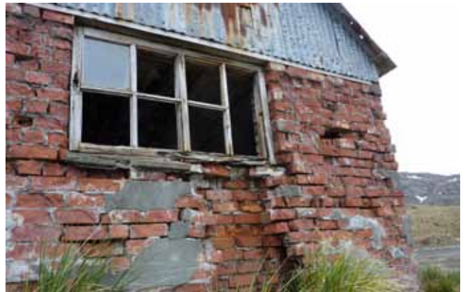
32.2 Detail of very poor brickwork on the east elevation