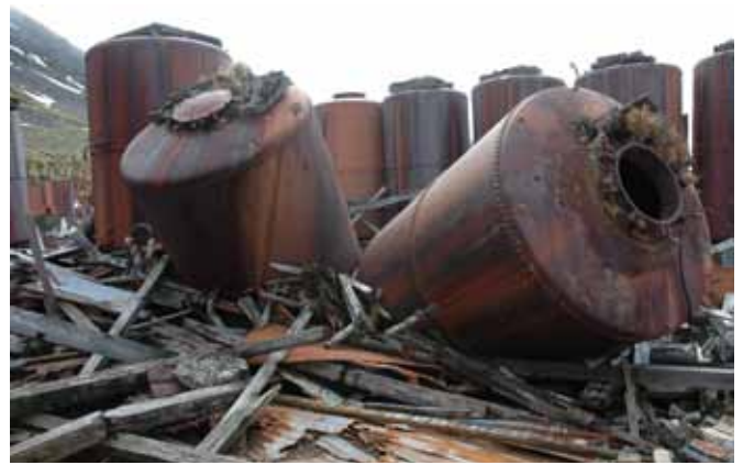
3.2 The north and east sides of the building