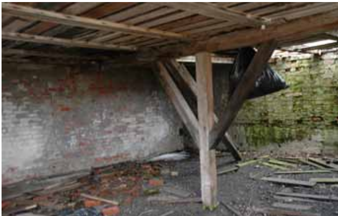
NN6 Interior of the store showing propping of the attic floor