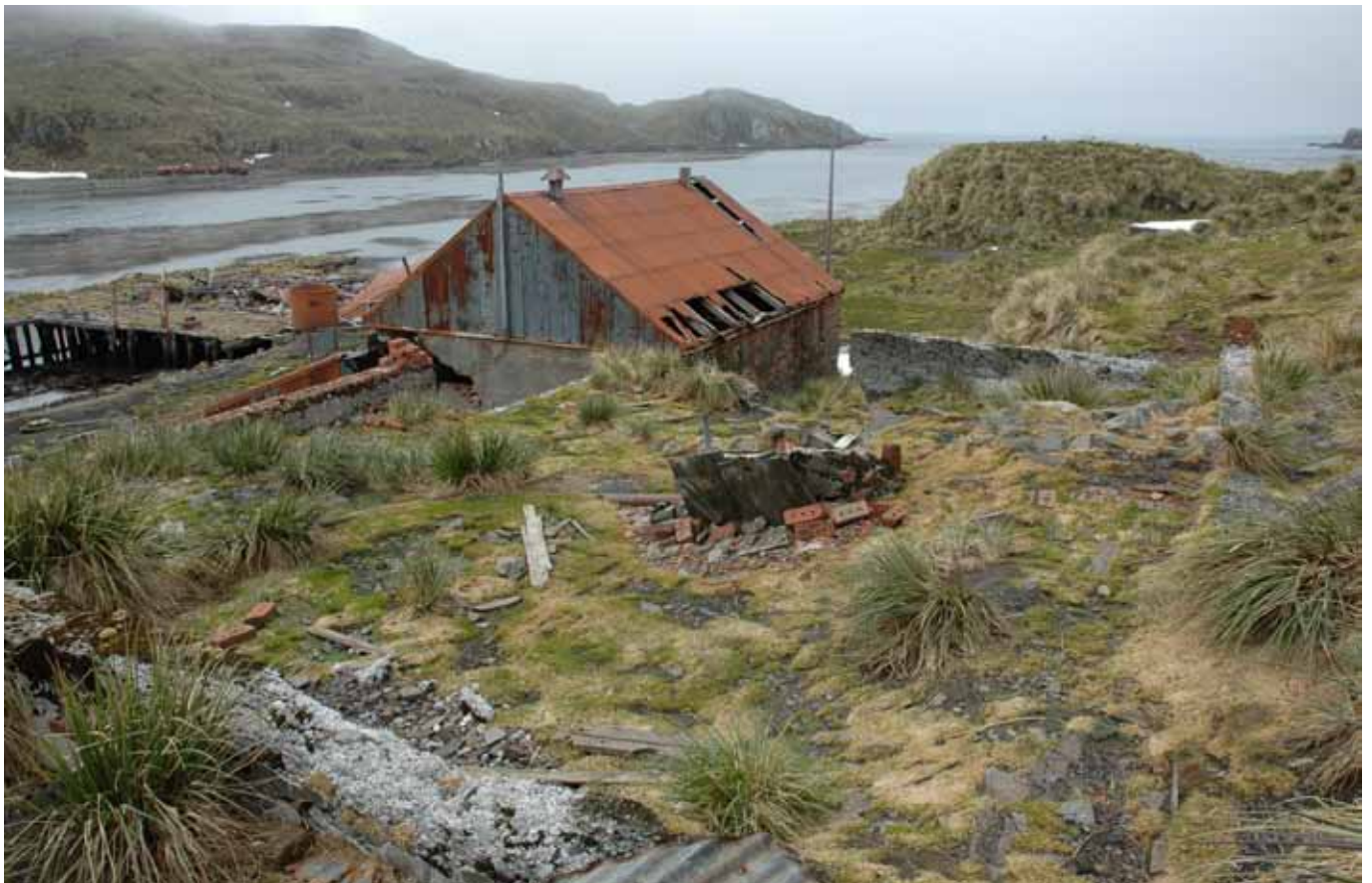
26.2 Remains of the New Foremen's Barracks looking eastwards. The 'building with no number' is in the background.