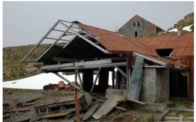
14.2 The north wing of the building