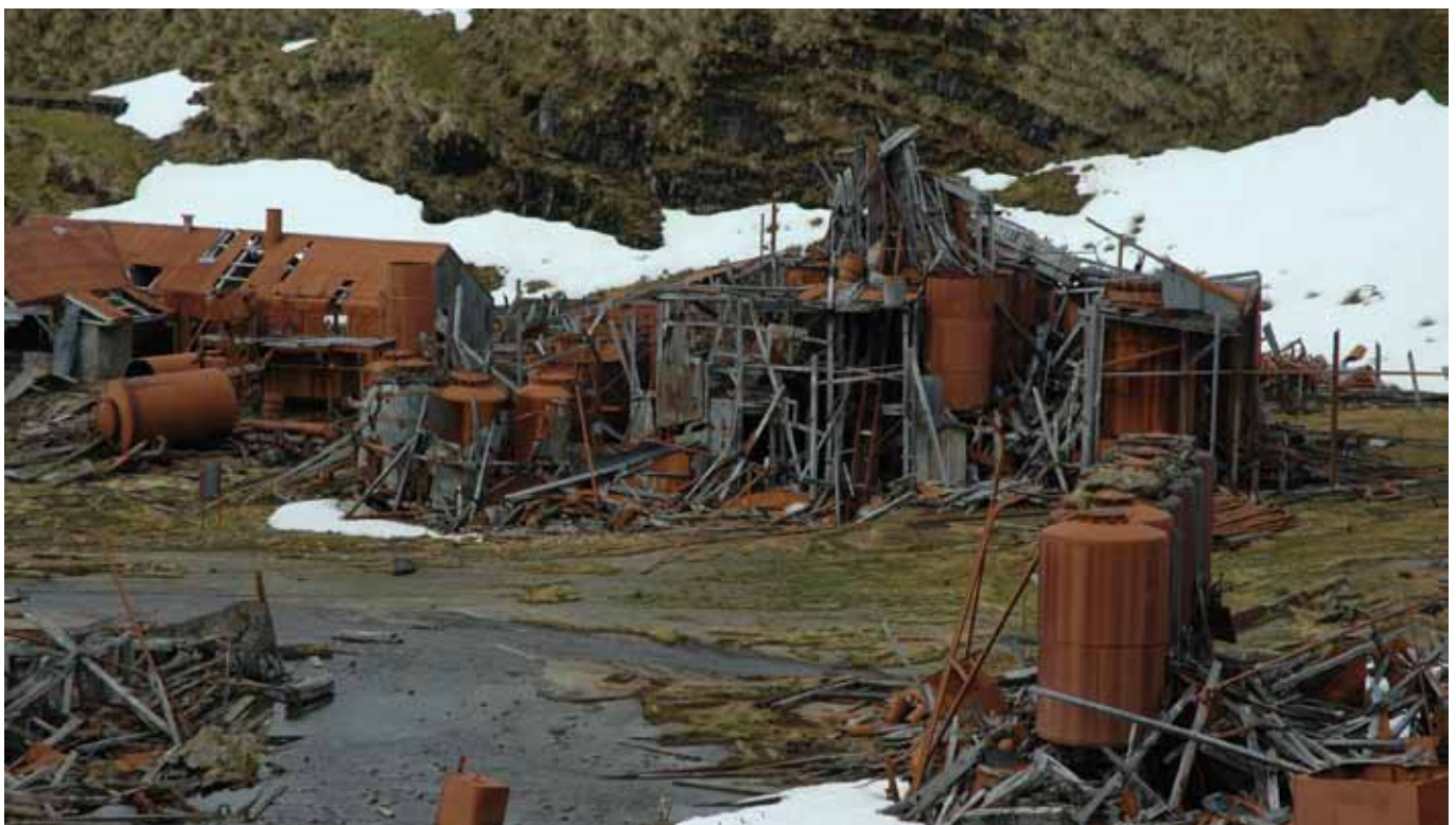
2.2 General view over the Blubber Cookery from the higher ground to the north