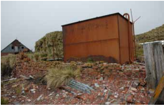
31.1 Tank and remaining wall looking southeast. The building in the background is the Pig Sty.

There are some remnants of standing walls and a door and frame and a good deal of brick rubble but not enough to distinguish what the buildings were at that part. One rectangular fuel tank remains in position, possibly a fuel tank for the boilers.