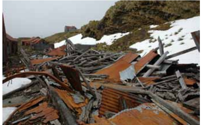
12.1 The remains of the general store looking east

This building has entirely collapsed and is now simply a heap of timber and corrugated iron. It would appear to have been raised approximately 450mm off the ground level with the timber base plate being supported by heavy timber bearers and in some places a concrete pier. The floorboards generally appear to have been very thick at around 75mm. It is difficult to determine where building No.12 ends and Building No.15 starts. Building No.15 is also in a state of complete collapse, the most visible part being the west gable end which appears to have been built up above ground level with a suspended timber floor and the outer walls of heavy stud framing with corrugated cladding externally and horizontal boarding internally. The main timbers of the stud frame being roughly 125x125mm. The same timber appears to have been used for ties and for principal rafters of the roof. These two buildings are well beyond the point where any repair is possible.