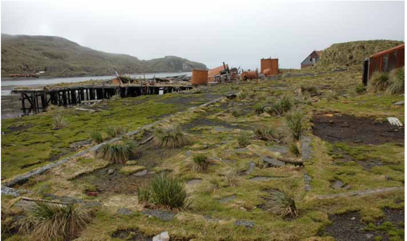
24.1 The remaining concrete base

This building has disappeared entirely apart from its concrete base which just remains visible.