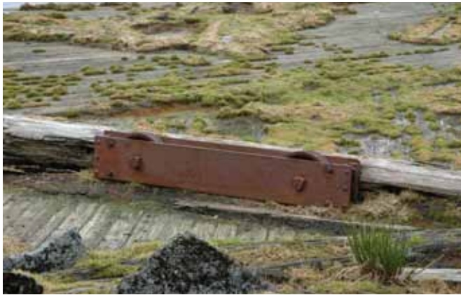
9.2 One set of blocks and the timber mounting beam