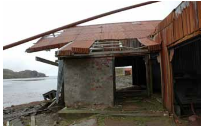
14.6 The west side of the North Wing