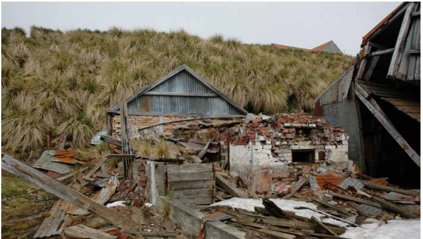
23.3 The remaining brick over the south end of the Bakery