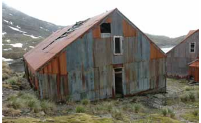
18.1 South elevation

The building is constructed as a braced frame of 125x75mm timbers, the walls being clad externally in corrugated iron and internally with vertical tongued and grooved boarding. The timber framed roof has trusses at roughly 2m centres supporting timber purlins and corrugated iron covering. The ground floor is suspended timber with floor joists spanning onto central spine walls. The floor is double bonded with the lower boards being some 30mm thick with 25mm boards laid at right angles over the top. The roofs are divided by internal stud walls covered with vertical boarding. The ceiling is also boarded.