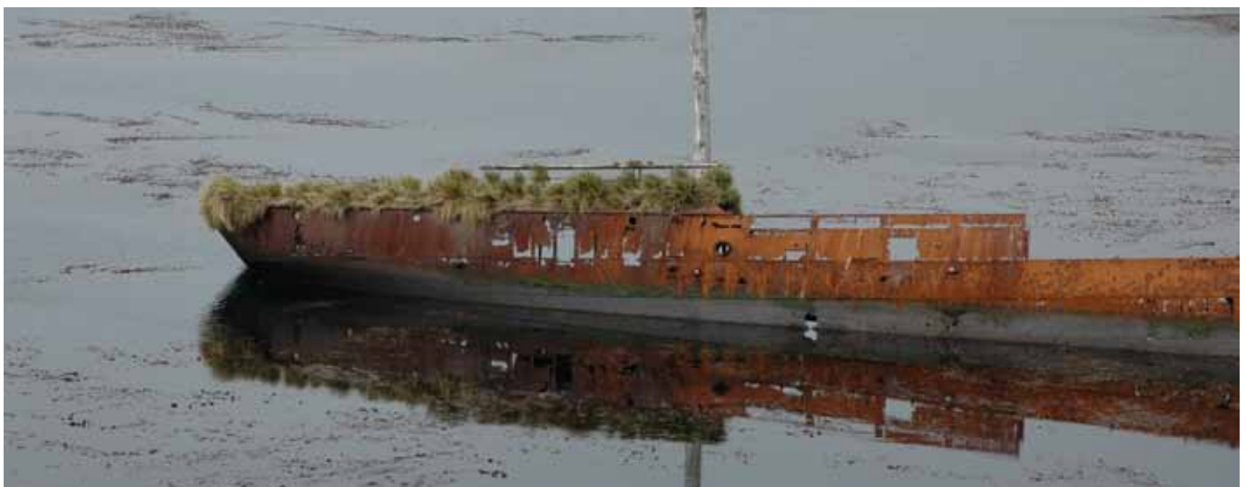
37.2 The stern showing the corrosion of the steel plate and vegetation growth