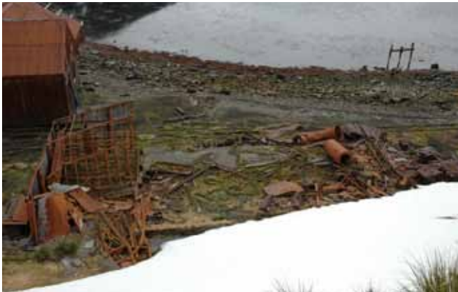
16.1 General view of the Foundry

The concrete base remains at the foundry but apart from this the only surviving structure is the west wall. This appears to be an extension to the original building with a lean-to roof falling to the west. It is framed up in steel work with three heavy columns, no doubt adapted from something else supporting the north wall. These columns will be here for some years to come. The rest of the building was presumably of timber and corrugated iron.