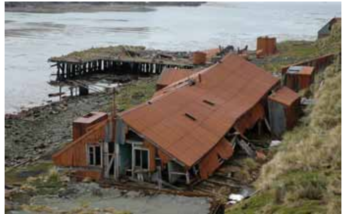
22.1 General view of the building from higher ground to the southwest

The construction is much as the other buildings on the site with heavy timber stud framing clad externally in corrugated iron. Externally the corrugated iron seems to have been fixed direct to the stud frame. Internally there is vertical timber boarding fixed over roofing felt.