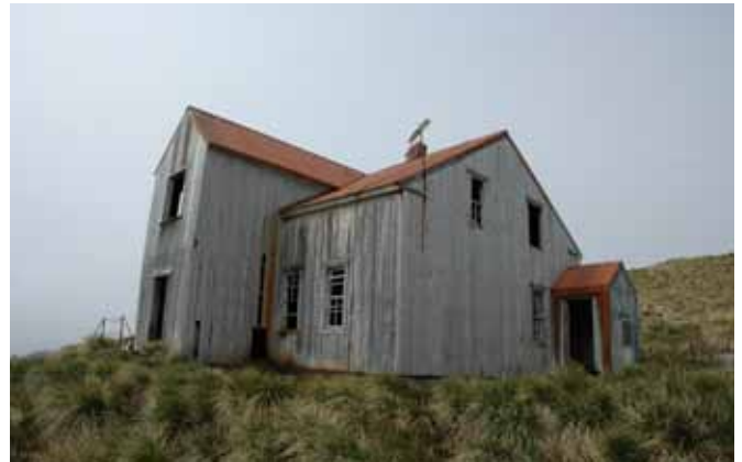
27.1 North and west elevations

The main building is rectangular with a ridge running east/west. This has a lean-to and a smaller outshot on the south side and an entrance porch on the west side. The building has a cat slide dormer on the south side and a bay with a pitched roof hipped back into the main roof on the north side. This bay provides a front entrance and small hallway at ground floor. The building is clad externally in timber boarding which has previously been painted and has a pitched roof of corrugated iron. The porch and lean-to are both clad completely in corrugated iron. There is a pair of brick chimneys through the ridge which are now more or less fallen in. The windows on the south side have all disappeared and the two lower ones have had the boarding beneath them broken up. The roof of the lean-to on the south side is seriously damaged and the whole of the roof of the dormer has disappeared. The north slope of the roof appears to be undamaged but the missing windows and the missing roof to the dormer have taken their toll.