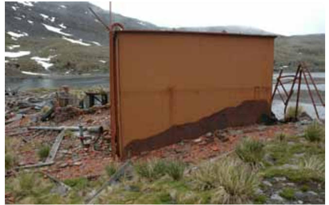
31.2 Tank looking northwards with Jetty 29 in the background