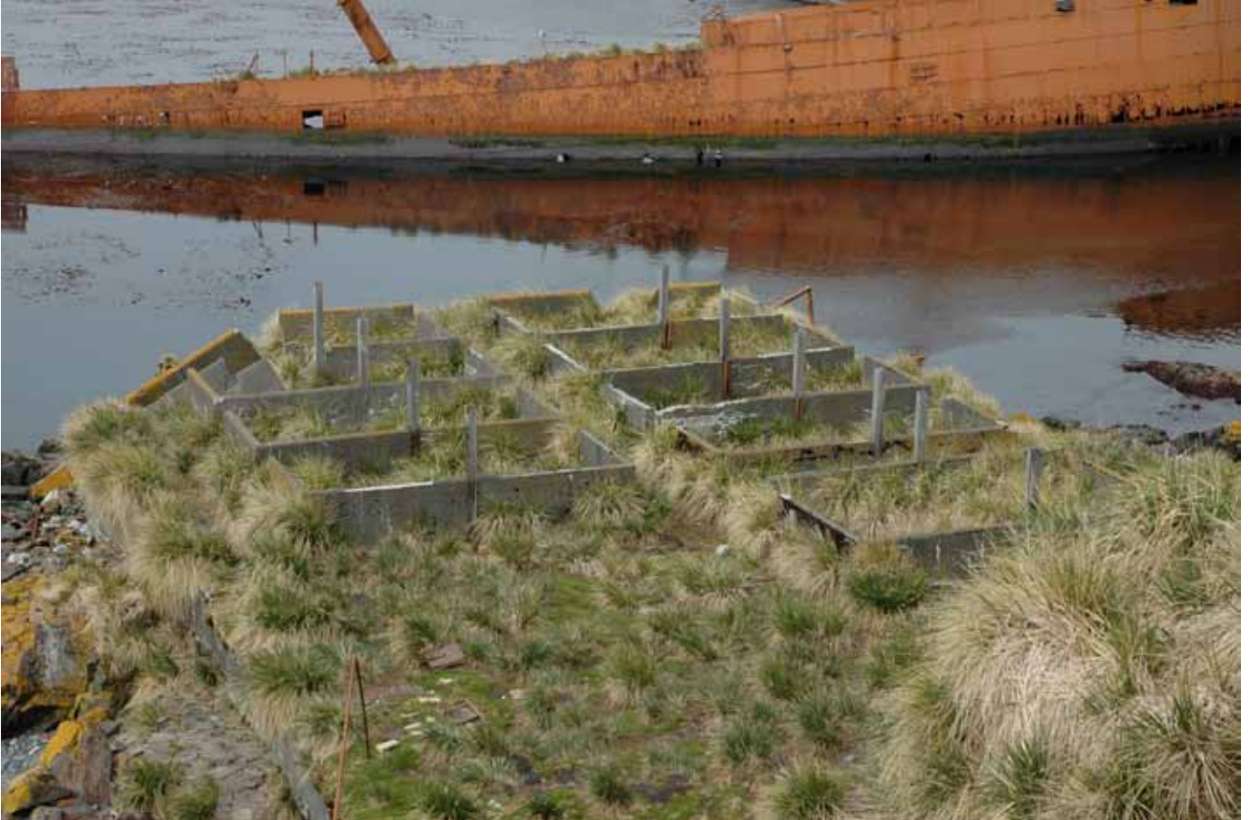
33.1 The remains of the Pig Sty with the hull of the Brutus in the background

The structure of this building has disappeared entirely leaving only the concrete floor and the walls of the pig pens visible.