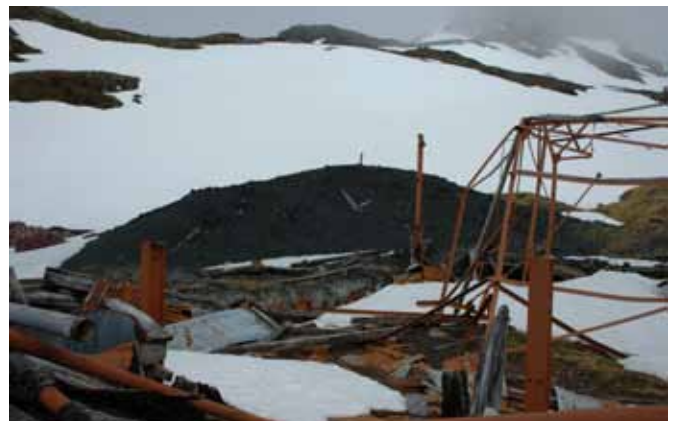
10.8 The coal heap to the southwest of the Boiler House