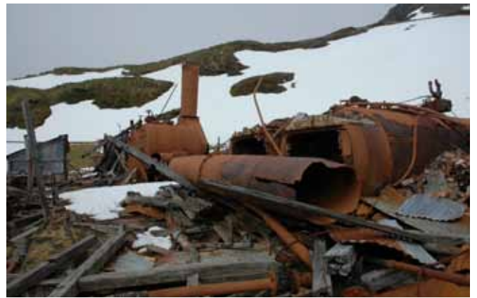
10.6 General view of the remains of the Boiler House looking southwards