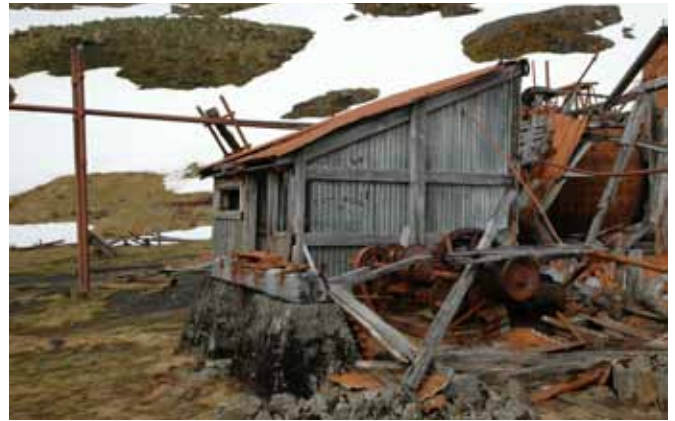
9.3 The remaining building on the south end of the Winch House