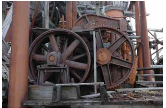
2.5 Detail of remaining machinery at the southwest corner