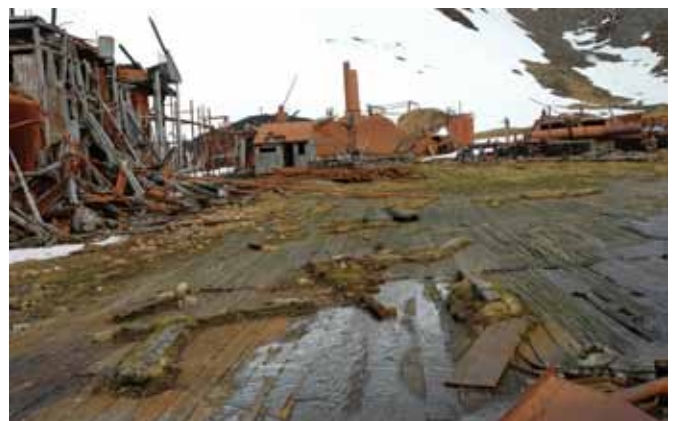
1.4 Looking west from the sea towards the Winch House