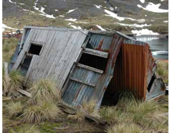
28.2 The remnants of the Hen House