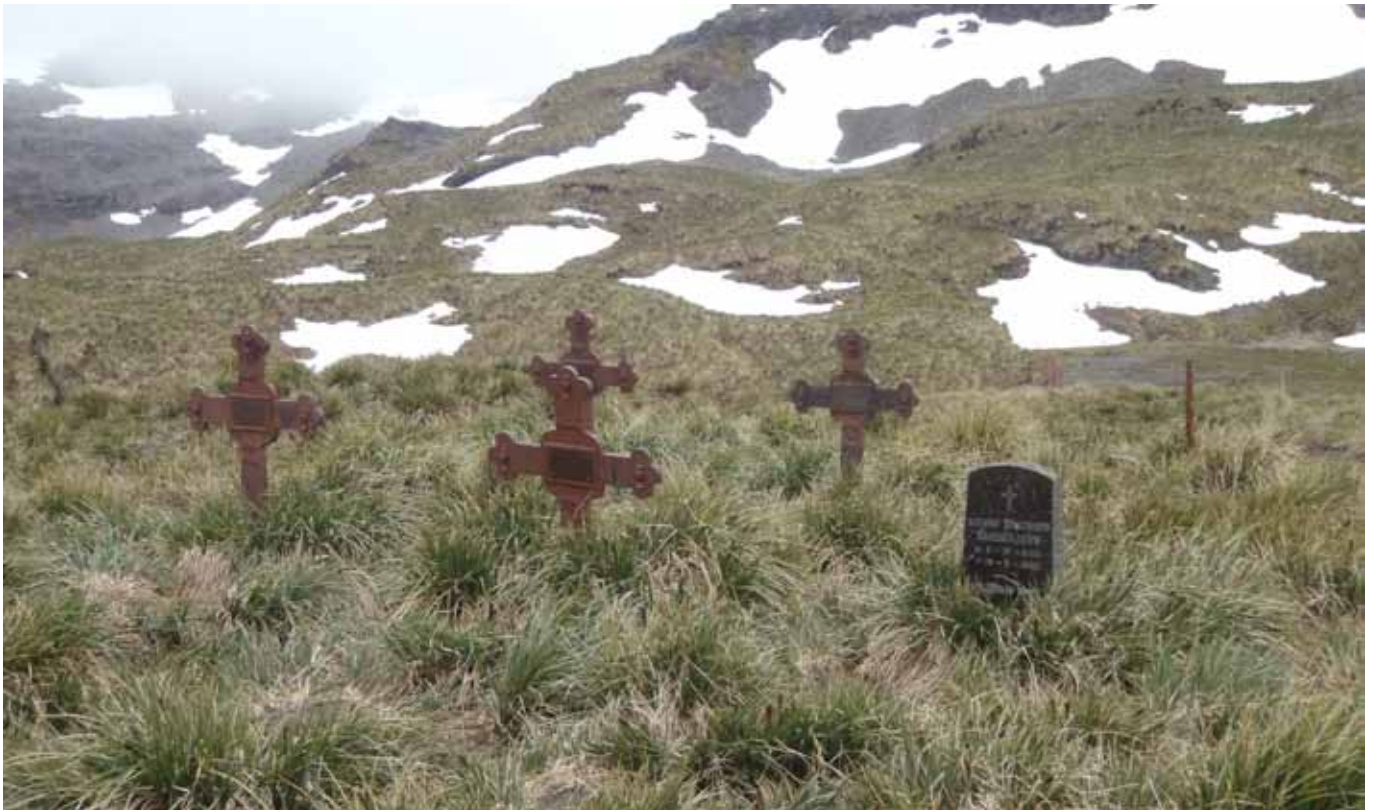
38.2 General view of the Cemetery