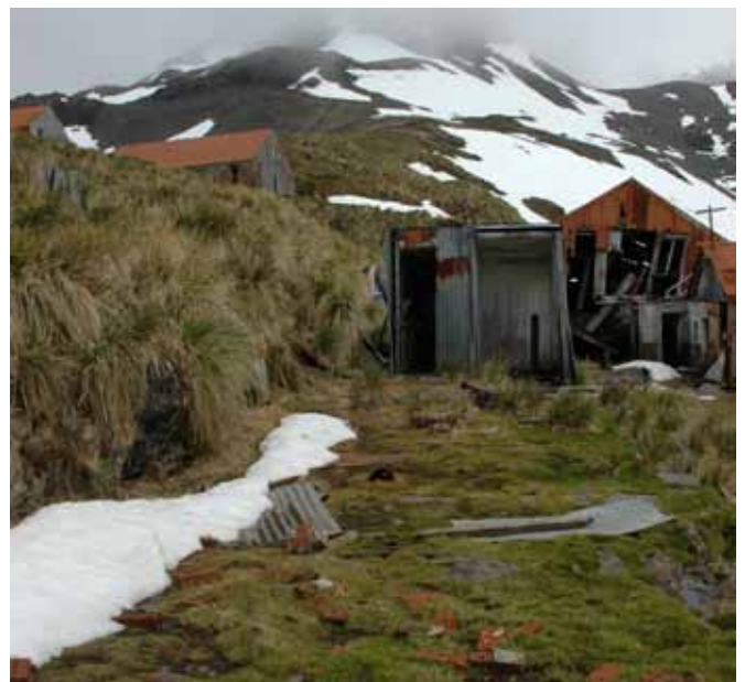
25.1 Remnant of the old Foremen's Barracks

The corrugated iron entrance porch to the old barracks remains at its west end in poor condition. The remainder of the barracks has disappeared completely with only a few bricks showing where it had been.