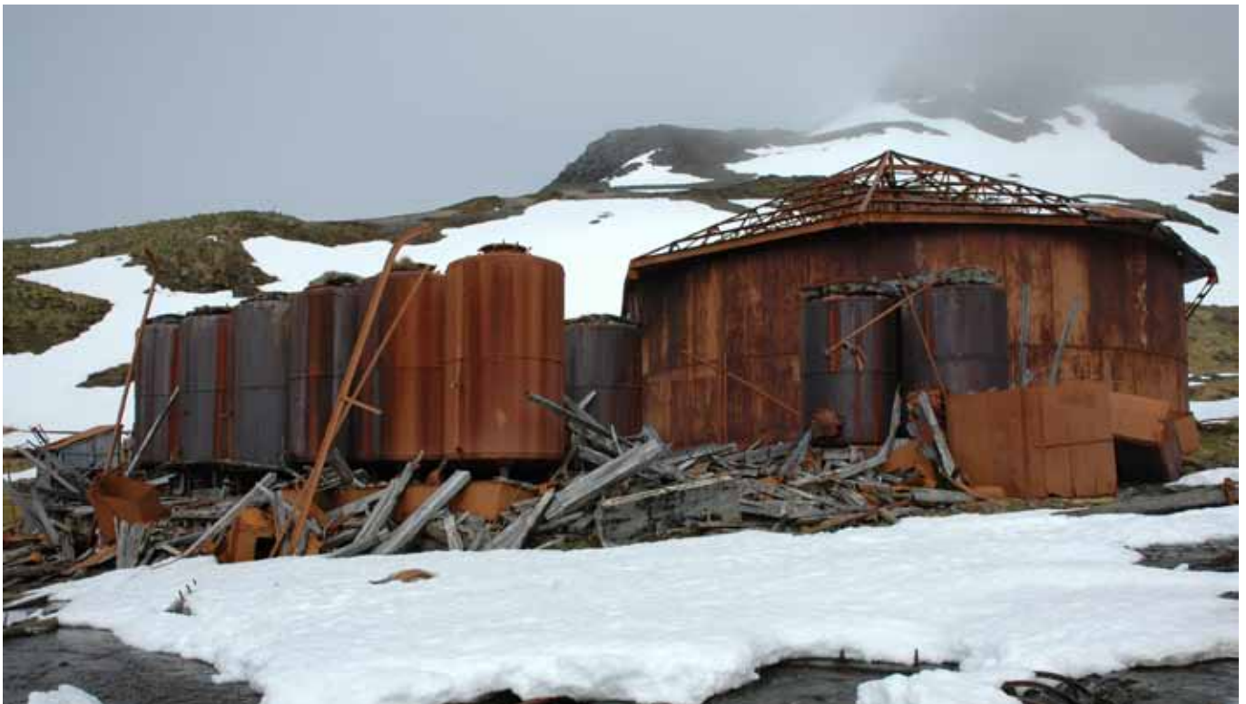
3.3 Detail of the cookers