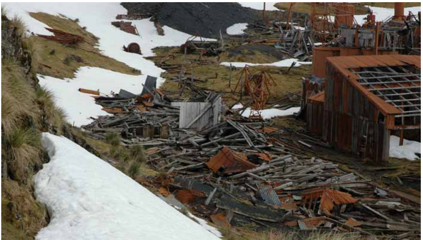
12.2 General view over the remains of both buildings from higher ground to the southeast