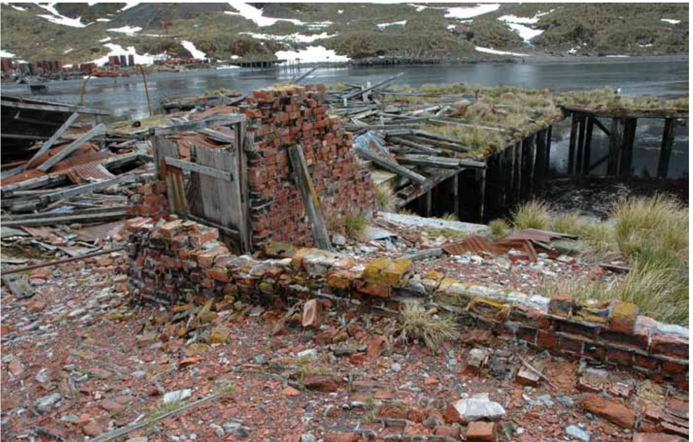
29.3 The Jetty can be seen beyond the Jetty Store. The brick remnant in the foreground may be part of the Boiler House (No. 30).