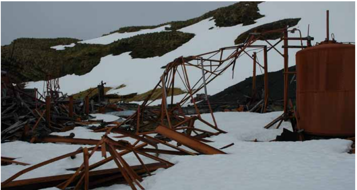
10.3 The remnant of the building west of the remaining boiler