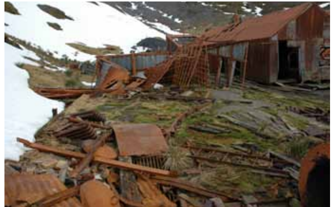
16.2 Looking eastwards and showing the remnant of the west wall