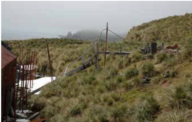
34.1 The access stair seen from the west

Little now remains of the cinema which stood on top of the bank to the south of the New Barracks and the Slop Chest. There is the remains of a timber stair leading to the cinema and the location and extent of the building is still apparent from the remaining concrete foundation and some remnants of brickwork. The main superstructure of the cinema no longer exists.