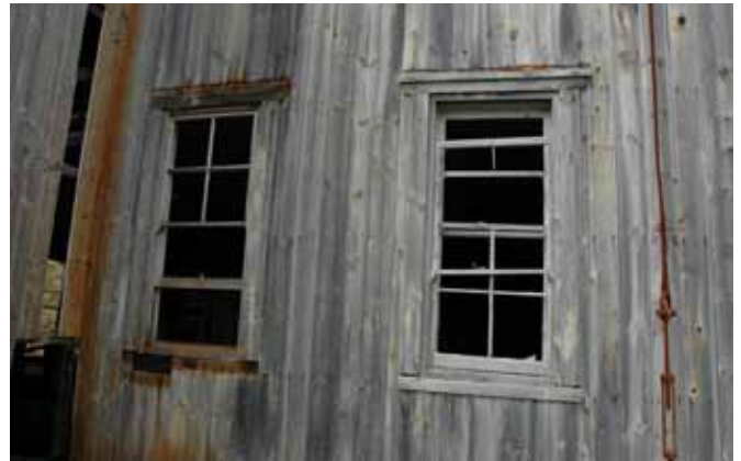
27.4 Typical sash windows

The whole of the ground floor, which was suspended, has fallen in and the ceiling has collapsed. Curiously there did not appear to be any remaining floorboards to the first floor – why they would have been removed is unclear. It would seem that partitions have been stripped out here as well leaving the upper floor as open – perhaps the building has been used as a 'quarry' for materials. The construction of the building is much the same as the others with a substantial timber frame, roughly 125x125mm principal members with vertical boarding internally and, in this case, vertical boarding externally with felt under both inner and outer boarding. The front entrance has four concrete steps and a wrought iron balustrade.