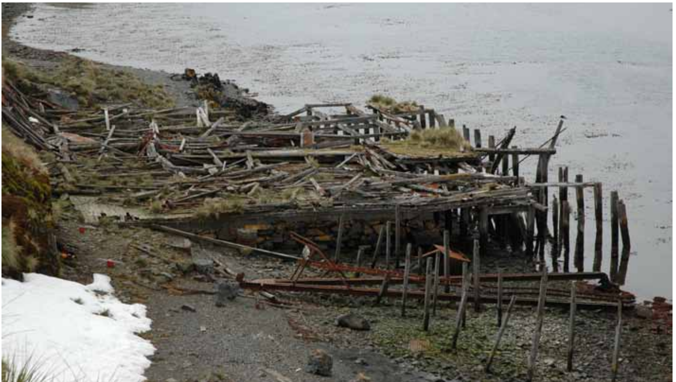
7.4 General view of the Guano Store looking eastwards