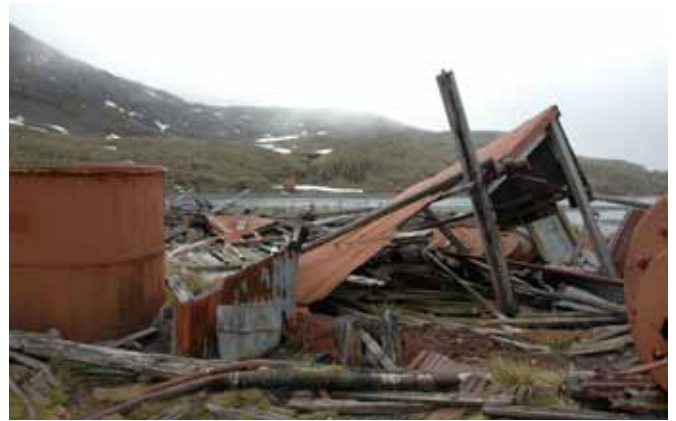
29.2 The remnants of the jetty store