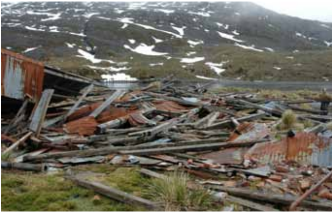
29.1 Jetty store looking northwards

This has collapsed completely and only one small section of roof remains propped up, the remainder is a heap of timber and corrugated iron. Part of this was built on the jetty itself. The jetty is supported by substantial timber piles of approximately 250x250mm cross section. These are at roughly 2m centres with heavy cross timbers supporting secondary beams and then a timber deck of 75mm thick boards. The deck is now significantly decayed with grass growing out of it.