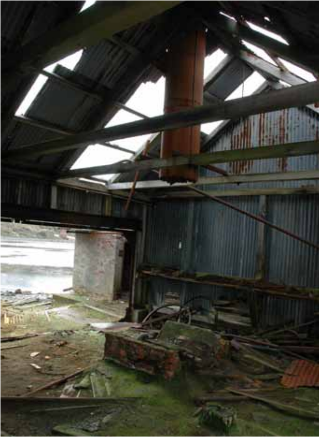
14.4 Inside the Blacksmith's Shop in the centre of the main building looking northeast