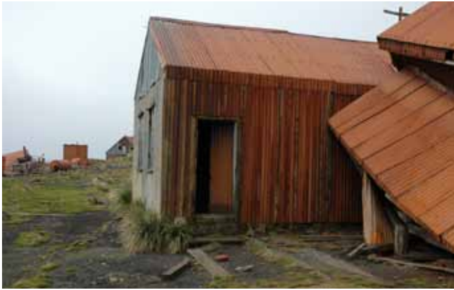
23.1 The north end of the Bakery - west side with the collapsed end of the kitchen in the foreground

The north end of the bakery remains intact. This small building is single storey with a pitched roof running north/south and two side hung casement windows in the north gable end. The concrete floor and the stud frame is unclad internally. To the south is the remains of the oven built in brick. This is now in poor condition with much of the brickwork damaged and the iron fittings for the doors and reinforcing rusting and splitting off the brickwork. The south end of the building was built tight up against the adjacent bank and the brick end wall and corrugated iron gable remain in position. Other than this the southern section of the building has collapsed completely with only a pile of timber and the concrete base remaining.