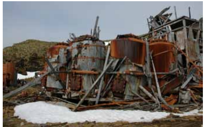
2.1 Additional cookers at the northeast corner in what appears to have been a later addition to the main building

The whole of this building is in the state of collapse. The various boilers are still in position but they are now quite seriously corroded. They stand on timber bases and these are beginning to fail. It would seem that it is too late to save anything significant here.