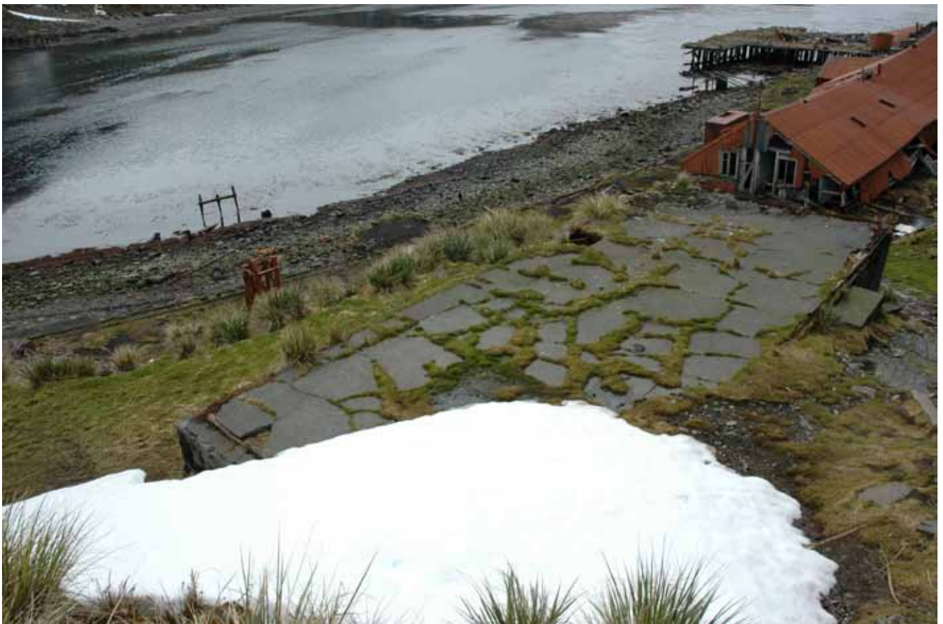
17.1 The remaining base of the Bath House

A concrete wall has been constructed to level a platform for the Bath House and the concrete wall and the concrete floor slab on top of it remain in position though the floor slab is now much cracked – the whole of the super structure has disappeared entirely.