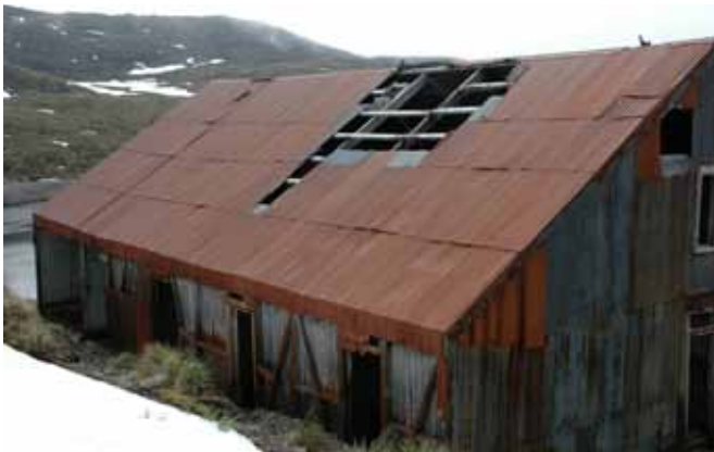
18.4 West elevation