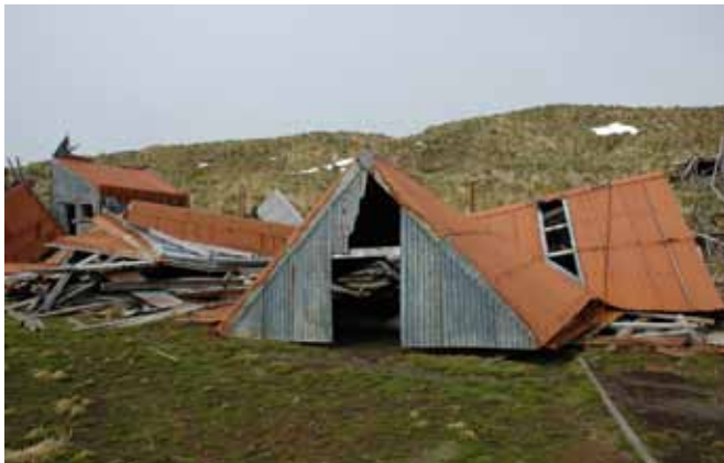
20.2 The remaining section of roof on the ground to the north of its original location