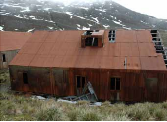
19.3 South elevation