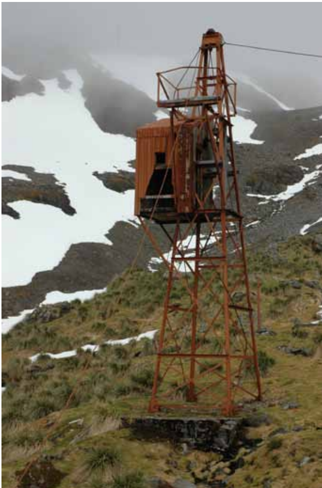
8.1 The upper station of the Elevated Railway looking north

The corrugated iron is falling away from the control hut but otherwise the pylon looks sound enough. The wind load on the hut must be considerable and wind is likely to bring the whole assembly down in due course.