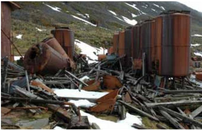
3.1 General view of remains of the Upper Meat Cookery looking northwards

This was a timber framed building framed out of substantial timbers the main pieces measuring 159x159mm in a cross section. There are two rows of six cookers: the western row standing on timber bases, one cooker is missing and two have fallen and the others look insecure. The eastern row of cookers stands on iron legs on concrete bases but the concrete is spalling and in poor order. The boilers themselves are still reasonably sound although doors are missing in several cases. The building and the platform above the meat cookery has entirely collapsed and lies in a heap between and around the boilers.