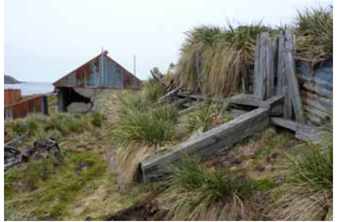
26.1 Remnants of the cold frame

This too has disappeared in its entirety with only some concrete and brick walls showing where it has been in the past. There is a timber construction to its north side which may have been an entrance platform but at the west end this looks as though it may have been used as a cold frame.