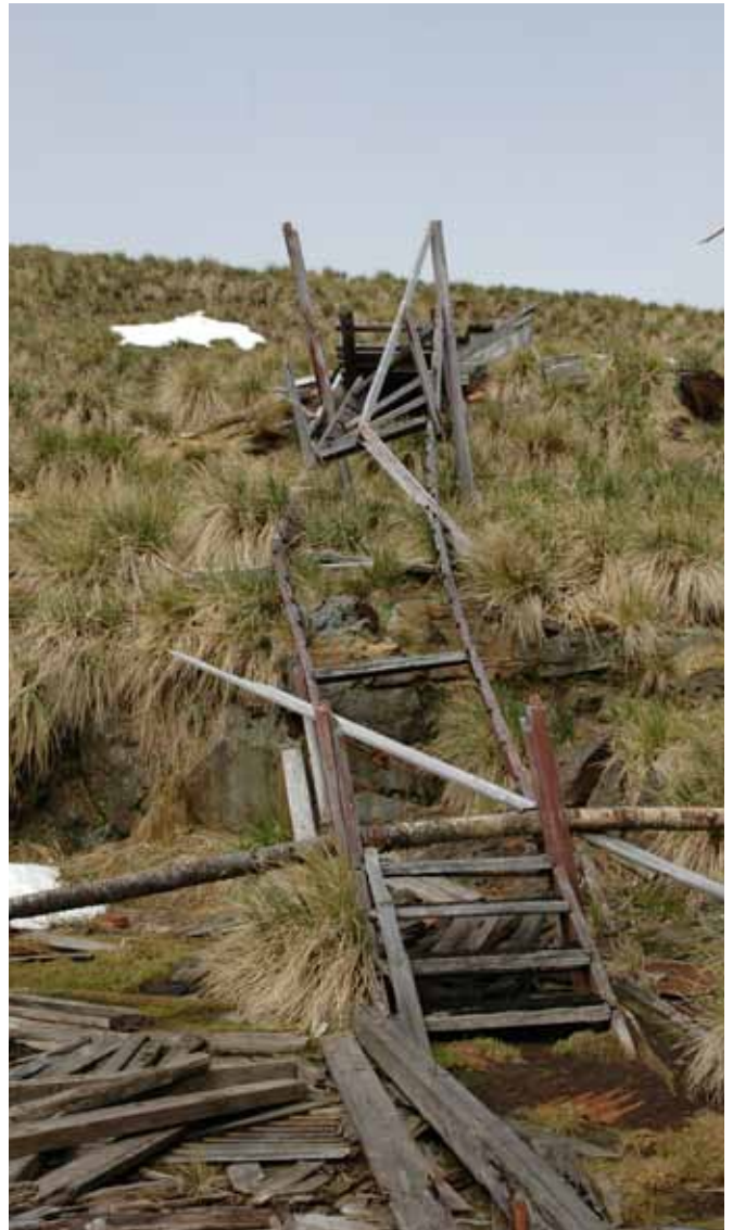
34.3 Detail of the access stair seen from the north