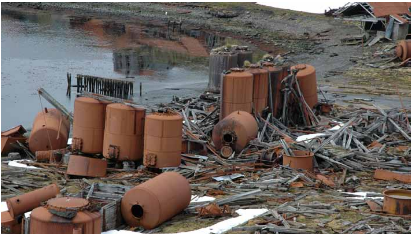
4.3 General view over the Lower Meat Cookery seen from the high ground to the north