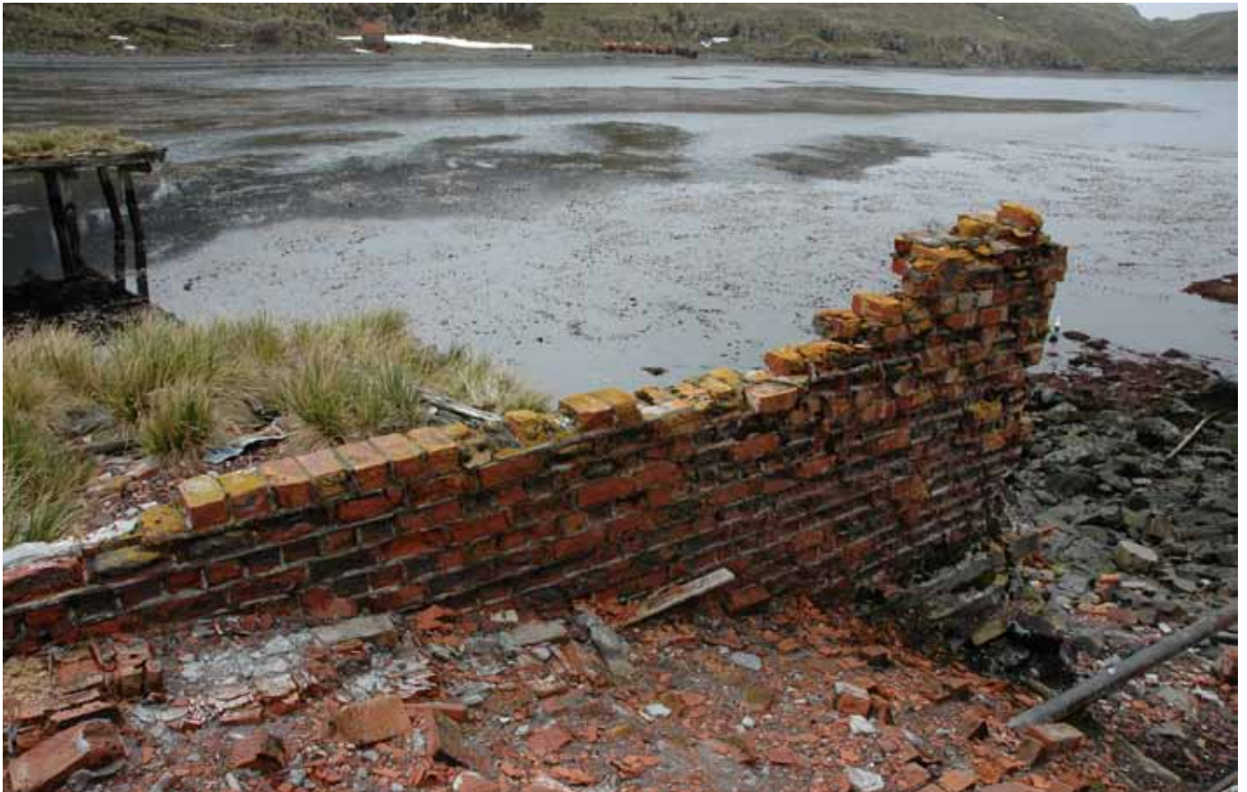
31.1 It is not clear whether this is a remnant of the Boiler House or part of the Pump House