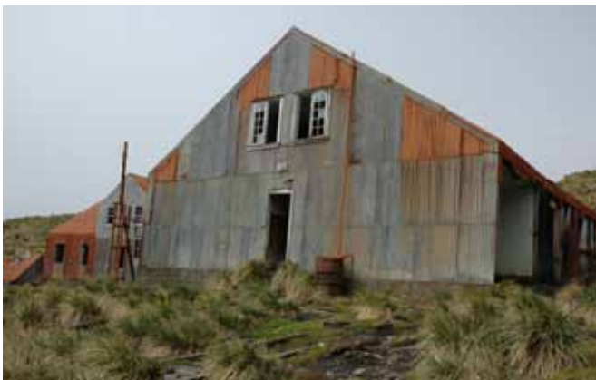
18.5 North elevation