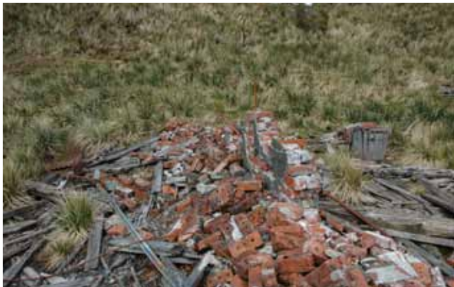
34.2 Remnant of the east wall