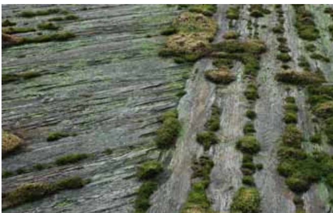
1.3 Detail of the diagonal boarding between the meat cookeries meeting the main plan boarding