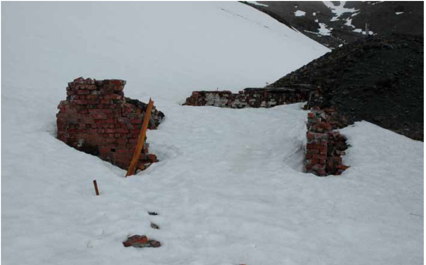
11.1 Remains of the Provisions Store

A small rectangular brick building that was built partially into the hillside and is now surrounded on the north and west sides by the coal heap. The roof of the building has collapsed and disappeared completely and only a small amount of the wall plate remains on the north wall. The bricks are rapidly falling away with all the remaining courses all being loose.