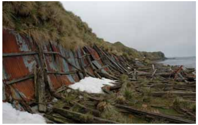
7.3 The north wall which remains leaning against the bank