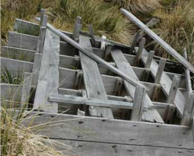
28.1 The nesting boxes

The Hen House has collapsed completely. The roof appears to have flipped over the north wall of the building, leaving the roof lying upside down and the south wall exposed having moved through 180°. The nest boxes for the hens remain on the south side of the building, the roof, remarkably, remains intact.