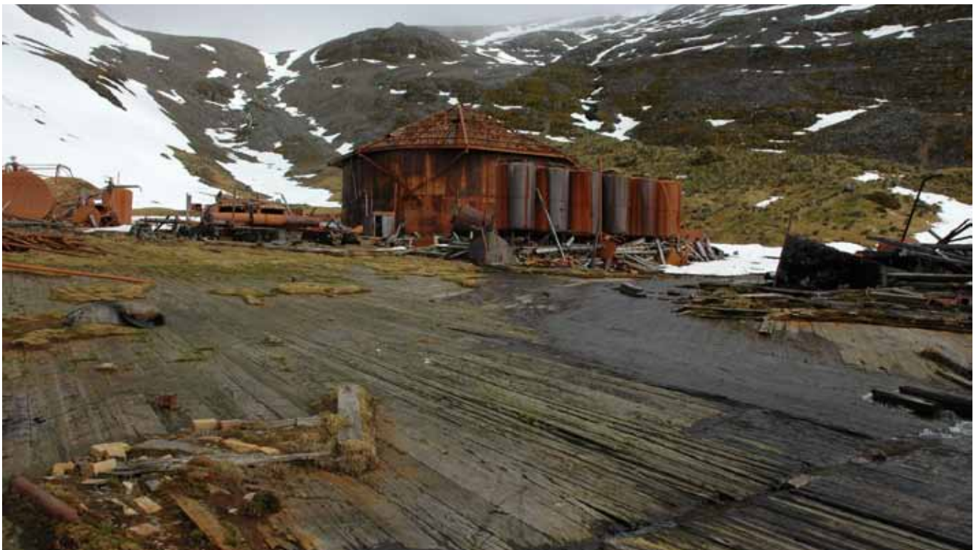
1.2 Looking northwest towards the Upper Meat Cookery