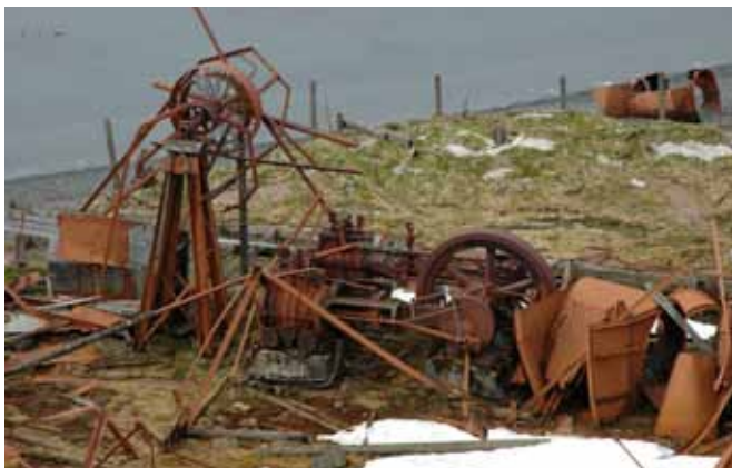
6.3 Detail of remaining machinery, centre of the south side