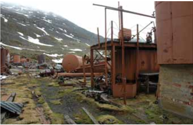
13.1 The plant at the south end of the building

Nothing recognisable remains of the building other than a concrete floor. This floor has recently been used for storage of various bits of metal and pipes and presumably any building remnants were cleared away before the area was used for storage. There are a few elements of timber and corrugated iron lying underneath some of the stored material. At the south end there is a steel frame supporting three tanks and the remnants of a small steam engine and belt drive. Probably this is the 'refinery'. There are concrete bases adjacent to this area, one of which still has a tank on top of it, the other has a tank lying next to it.