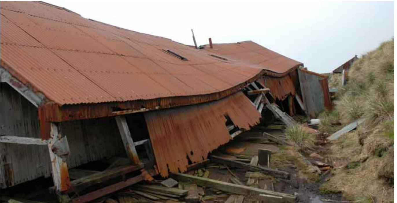
22.4 The south elevation