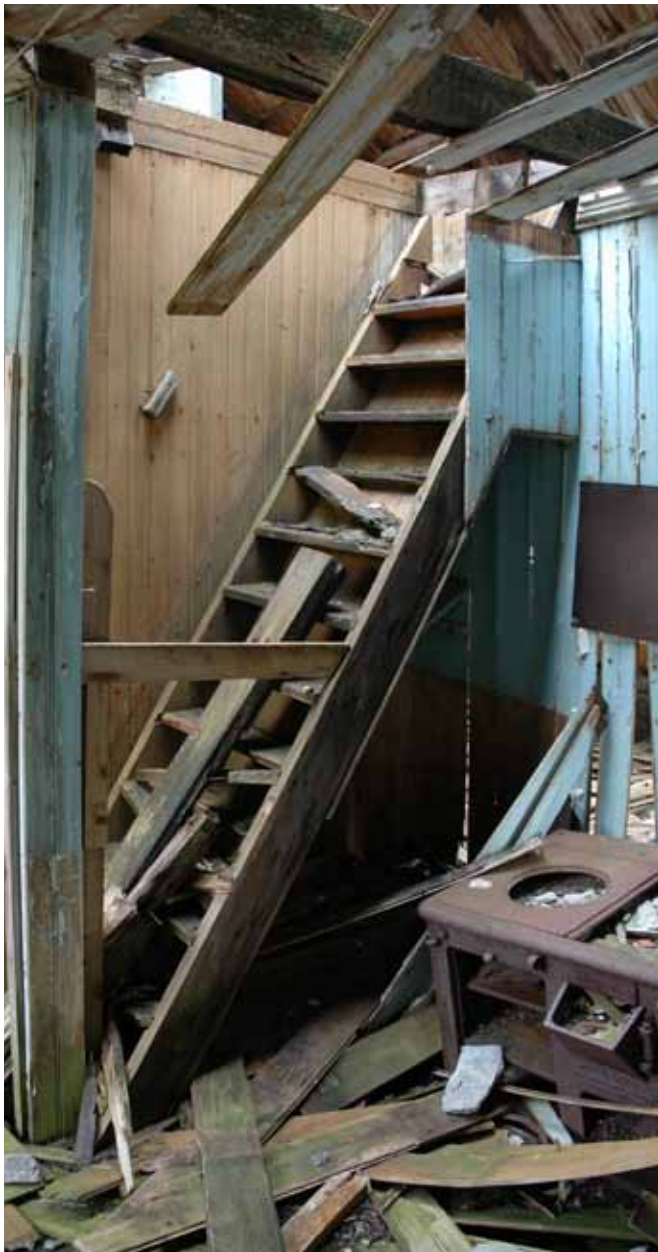
27.6 The staircase on the south side of the house