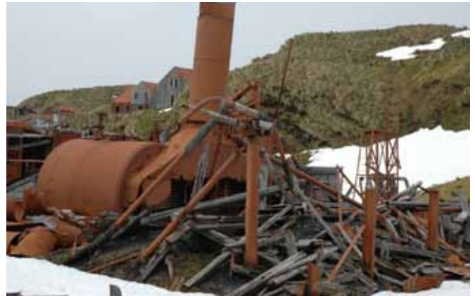
10.1 Boilers looking southeast

There is a timber and corrugated iron extension running out southwards from the west corner of the building ending in a concrete platform together with another steam winch but the purposes of this is not entirely clear, though it may have been to do with loading coal into the boiler and there is certainly plenty of coal lying about at this position.