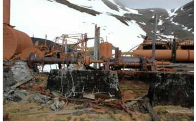
9.1 The east side of the Winch House

The Winch House stands at the top of the Plan. It was probably constructed as a lean-to against the adjacent boiler house. All that remains are two upright concrete posts on the west side and there are concrete blocks at the front (east side) with iron holding down bolts. A large timber beam fitted with pulley blocks sits alongside which would presumably have spanned between the concrete blocks and been bolted to them. One large steam driven winch remains in position with an extension to a drum for wire rope on the south side. At least two other winch bases remain but there are no signs of the winches themselves. There is a small timber framed mono-pitched shed immediately to the south of the site of the Winch House. Whether this was part of the Boiler House or of the Winch House is not clear.