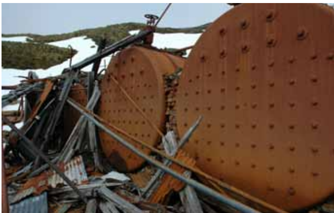
10.7 The east (back) of the boilers