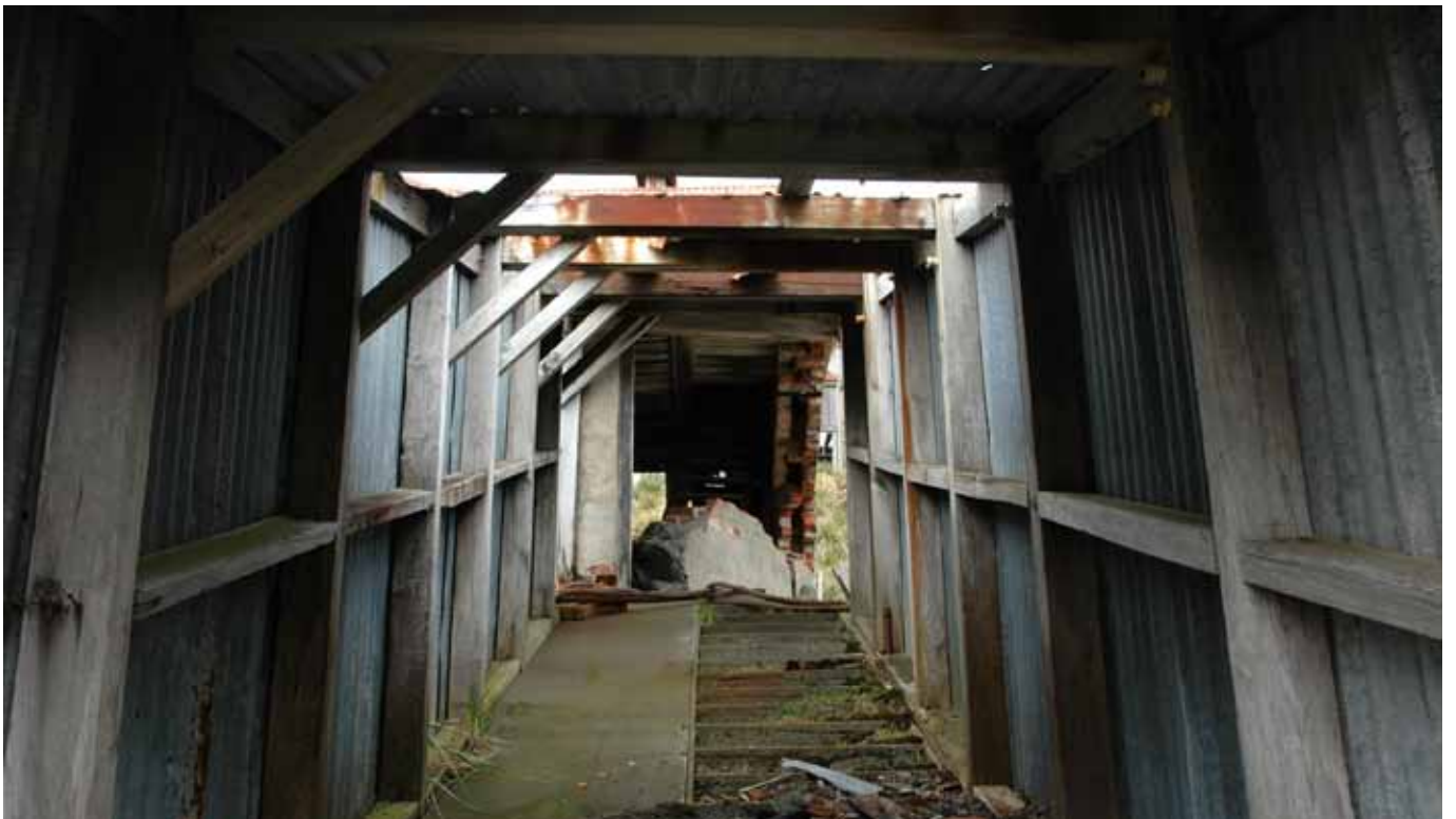
NN7 Interior of the stair and ramp looking south from the bottom