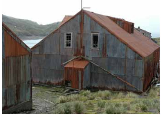
19.4 West elevation