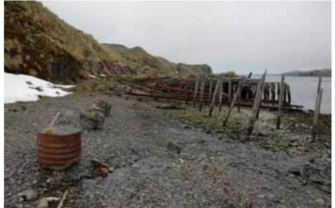
7.1 The line of the elevated walkway joining the Guano Factory to the Guano Store

This appears to have been connected to Building No.6 by a railway and a raised walkway; possibly the elevated railway also served this area. There is a steel 'A' frame with an access ladder and a platform which might be part of this. Building No.7 appears to have been a timber frame building of some size, little or nothing remains other than the north wall which has fallen against the adjacent bank. This shows corrugated iron cladding and timber framing – the building was built up out of rock on the beach with a concrete platform cast over the top of it and the seaward, south side being supported by timber piles. This outer edge of deck has now partially collapsed and the inner deck of timber on concrete is in poor condition and falling away.