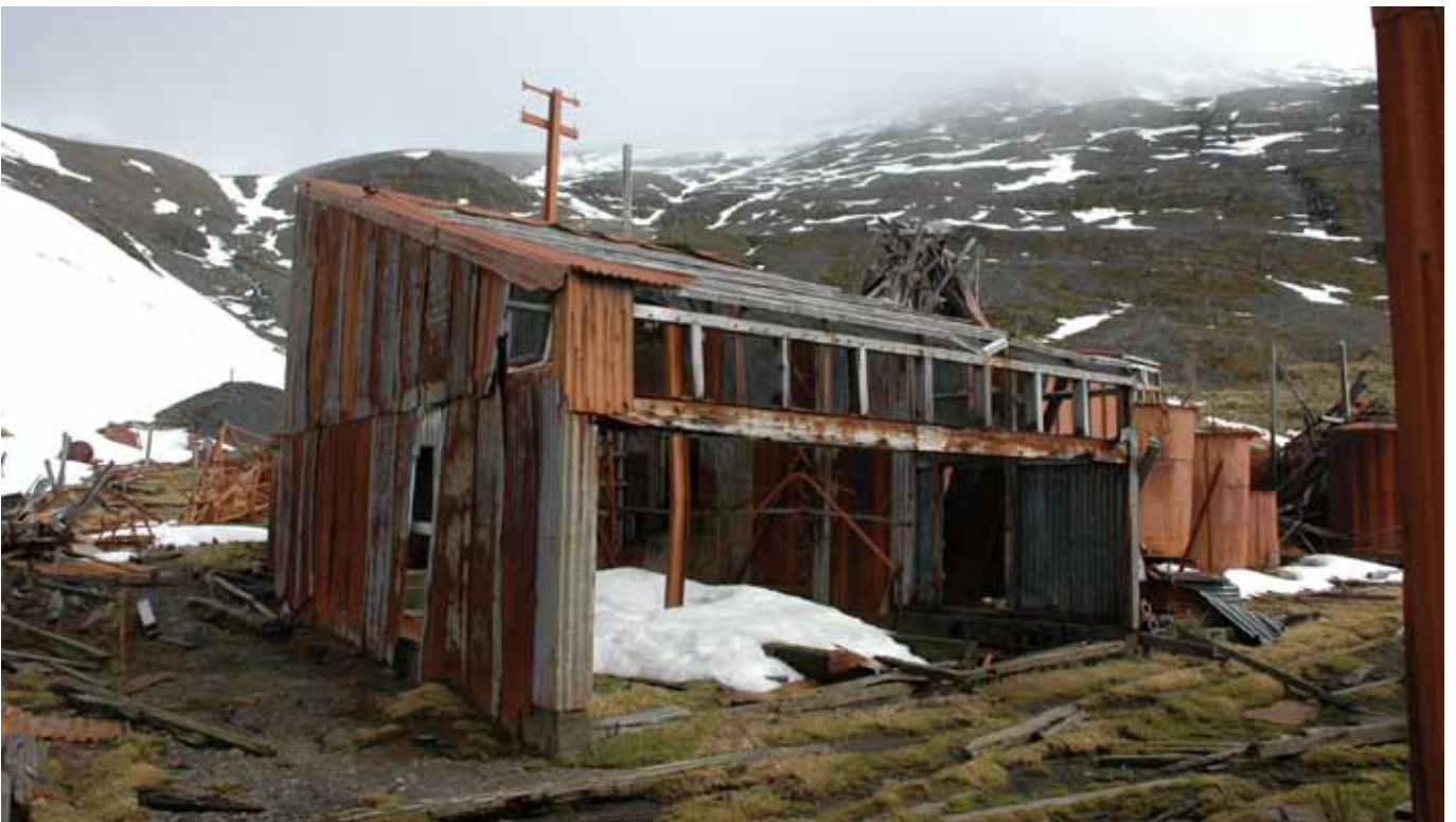
2.6 The extension at the southeast corner