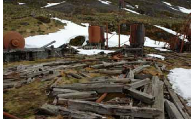
5.1 Detail of the remnants of the building

This has disappeared almost entirely. Timber wall plates and some small evidence of concrete footings is all that is left to indicate the outline of the building, various heavily rotted timbers lie in place. Four cookers remain in place on timber packers on concrete bases. Part of the timber is decaying but they still look reasonably solid. There are nine further bases which are on the west side of the building suggesting there were 11 cookers in rows on either side. The bases on the east side have very little fabric left. The floor appears to have been covered in heavy timber (around 100mm thick). There is a small section of steel framing at the north end of the building but none is evident elsewhere. It seems likely that this was a timber framed building.