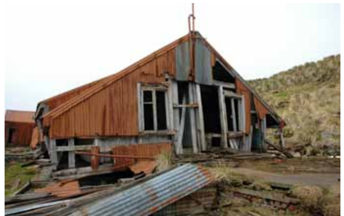
22.2 The remains of the west elevation