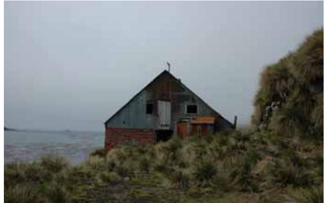
32.1 West elevation of the Pig Sty

Above the wall plate level, gable ends are clad in corrugated iron. Internally the pig pens are built in brick with render to all sides. There are timber posts supporting beams running the length of the building which both support these and provide door posts for the pen doors. Floors are solid concrete but are covered with timber in places and may originally have been entirely covered with timber. There is no staircase to the upper floor but there is a substantial trap inside the door at the west end. The roof is reasonably steeply pitched corrugated iron with principal rafters approximately 150x150mm alternating with rafters of 65x150mm, these are tied by high collars and will receive some tying action from the floor. The space above is boarded out although this appears to be failing and was not accessed. There is a stout timber ceiling with a good deal of insulation on top of this. The ceiling boards are now falling away in several areas. The space has two ventilators from the pig area out through the ridge. There is one small chamber constructed on the southwest corner lined out with felt, possibly accommodation for the pig man? The roof is still reasonably intact and keeping this area dry.