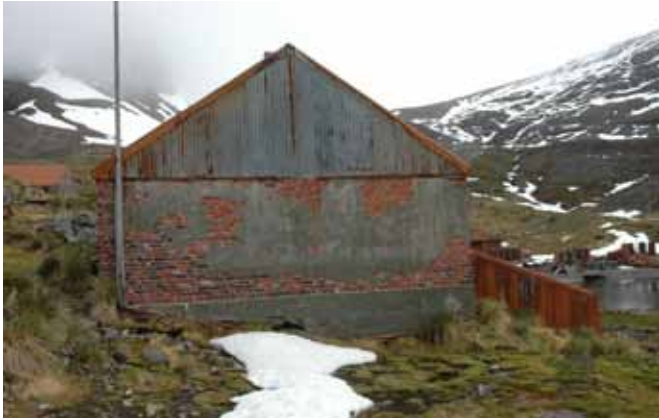
NN5 East elevation