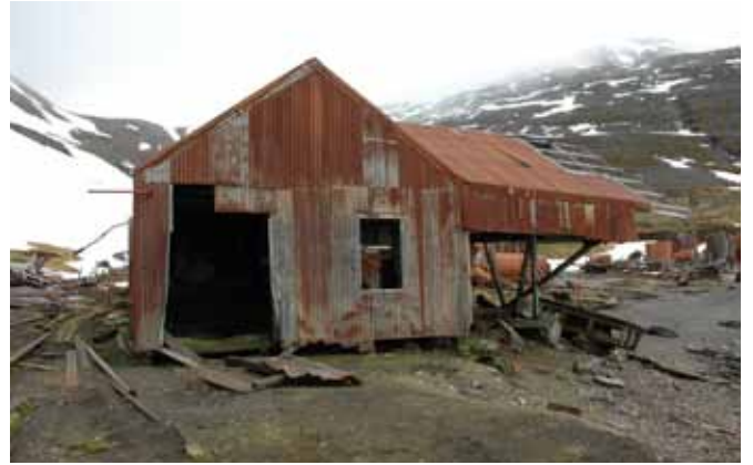
14.5 The east elevation