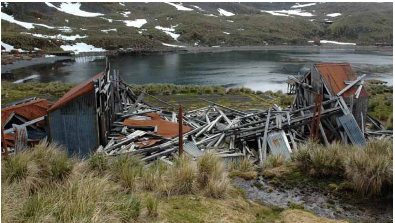
21.2 Remnants of the Hospital seen from the higher ground to the south