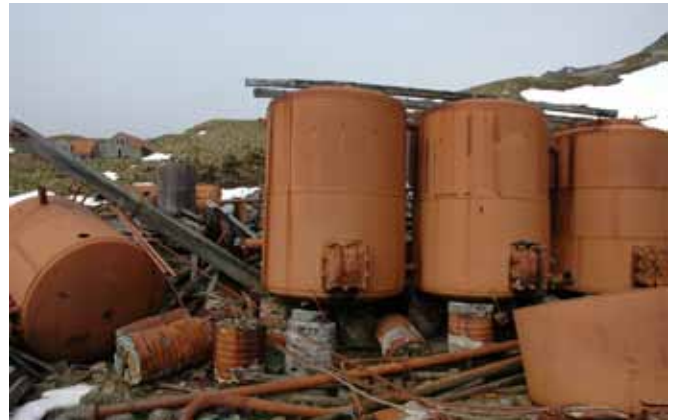
4.1 Detail of the remaining line of cookers north of the original building in what looks like an extension

This too was a timber framed building and like Building No.3 it has collapsed entirely. Four boilers remain standing on timber bases which are failing. Two boilers are now leaning sideways against each other. A fifth boiler is in a semi-upright position having fallen through its frame to the floor. There were certainly six and possibly more boilers standing in one central row. There are four concrete bases and two timber bases for a second row of boilers to the west although the boilers themselves have disappeared. There may have been a northward extension to the plant, as there is a row of four boilers on bases cast out of concrete (using old oil drums for shuttering) immediately north of the original timber building through the remaining position, although the concrete bases have fallen away in many cases, one has fallen completely. As in Building No.3 this was built out of substantial timbers 150x150mm which appear to have been used for the posts and there are more substantial 300 square timbers possibly used at the corners, although the collapse is so complete it is extremely difficult to tell what belongs where.