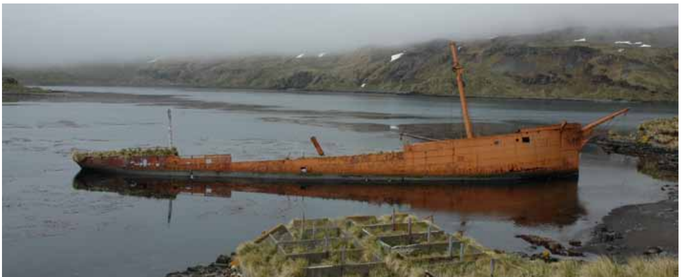
37.1 General view of the west side of the Brutus