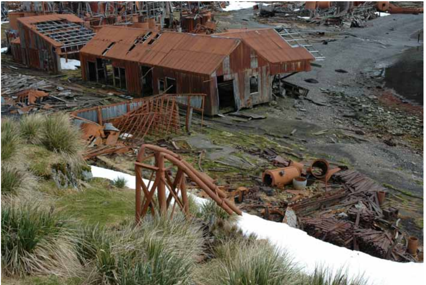
16.3 General view of the Foundry from the high ground to the south. One of the pylons for the Elevated Railway in the foreground.