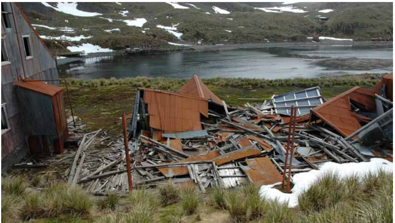
20.4 General view of the collapsed building from the south