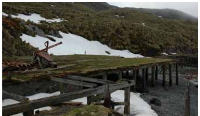
6.4 The platform at the east end of the building. It is not clear whether the building ever extended over this platform.