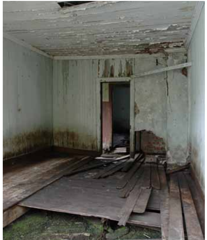
18.3 A typical bunk room

The corrugated iron cladding is present on three sides of the building but the sheeting is coming away on the west side with the northwest corner of the wall having collapsed. The east roof slope is more or less intact but some 20 percent of the corrugated sheeting is missing from the west slope.