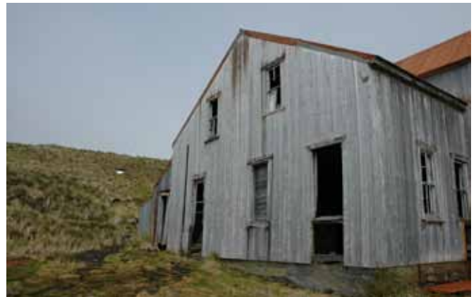
27.2 East elevation