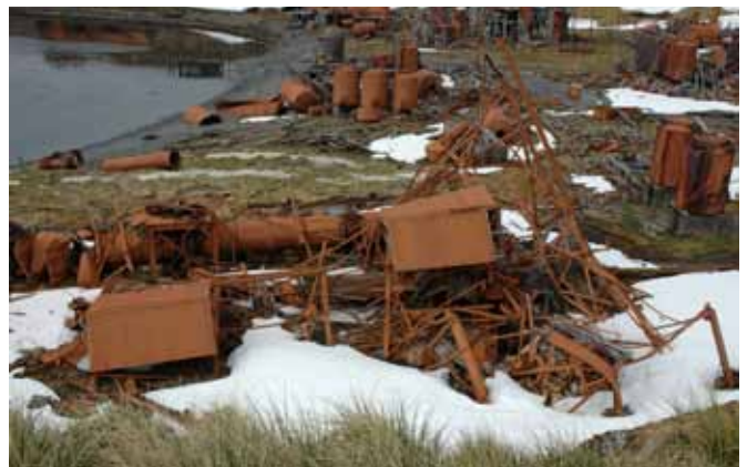
6.2 The west end of the building looking south