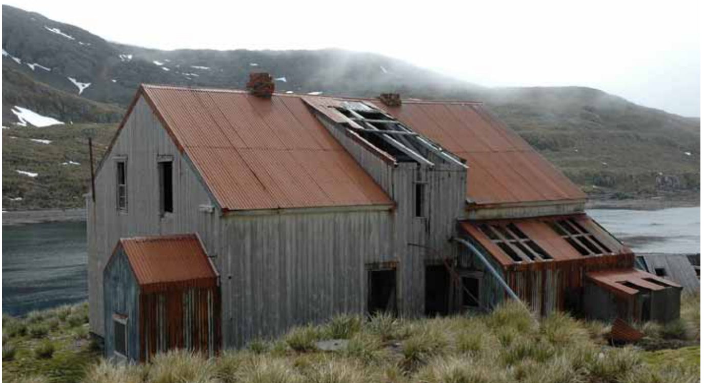
27.3 South elevation