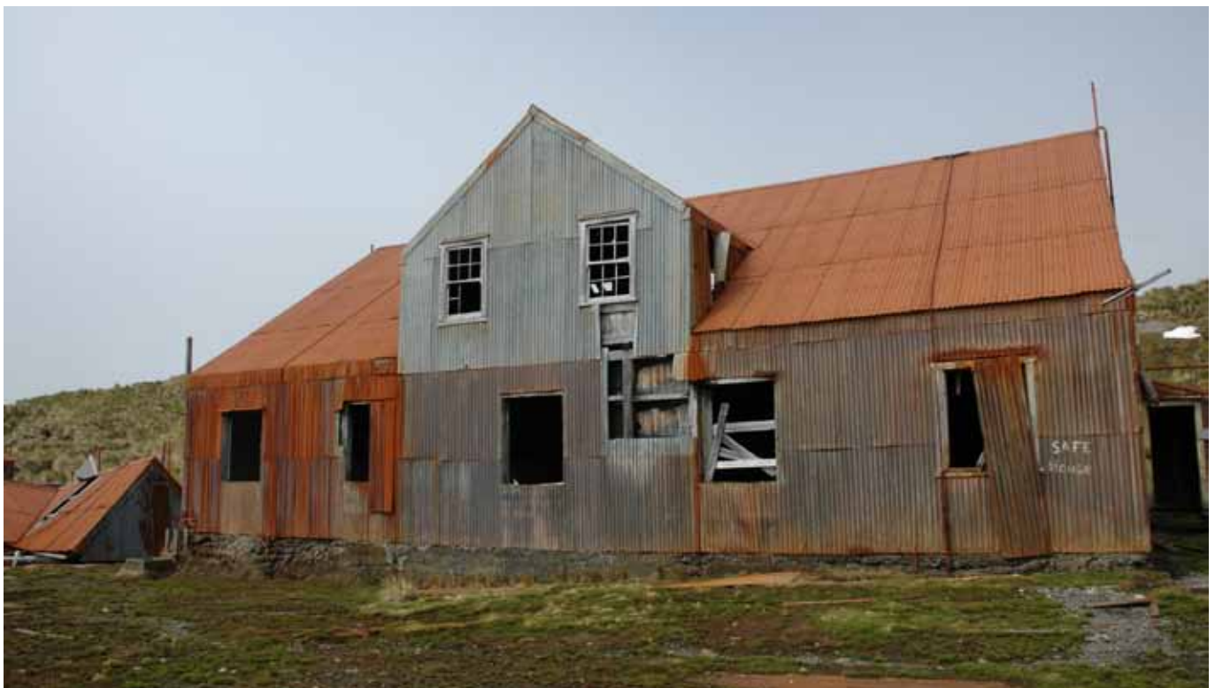
19.2 North elevation