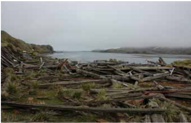
7.2 Detail of the remains of the building