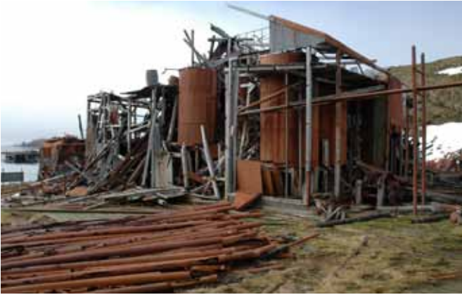
2.3 The west end of the building