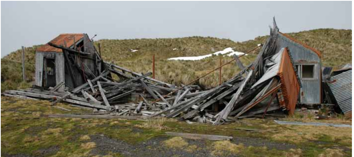
21.1 The north side of the building

This building has entirely collapsed with the exception of small sections at either end, a lean-to on the west side and an entrance porch on the east side. It appears to have been a single storey building although the roof space was probably accessible as there appears to be a window in the gable end. The wall structure appears to be vertical boarding covered directly with corrugated iron on the exterior and with vertical boarding internally.