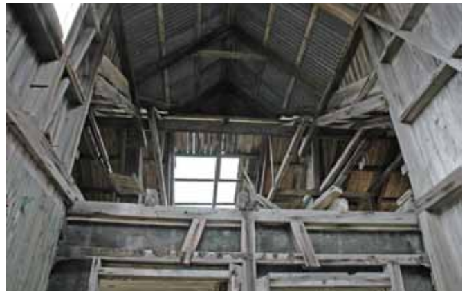
27.5 Inside the north entrance looking up into the main first floor space