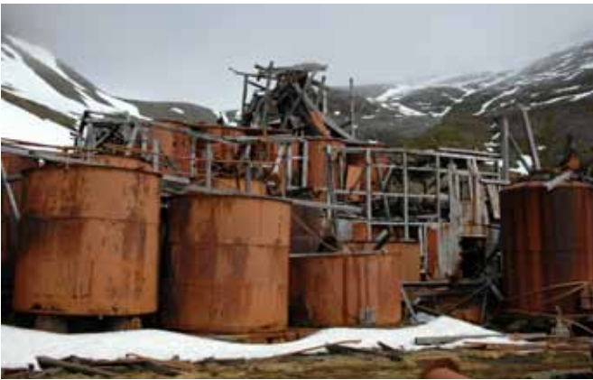
2.4 Cylindrical tanks at the east side of the building