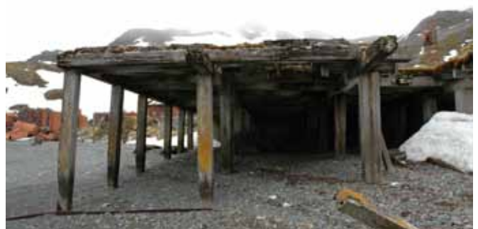
6.6 Below the platform looking west