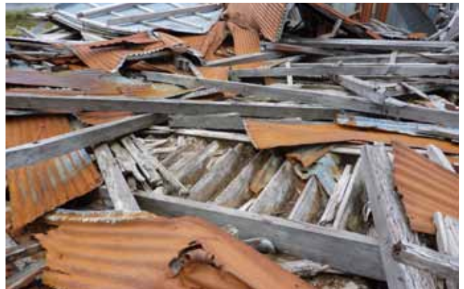
20.3 Detail of the remains of the building showing the staircase