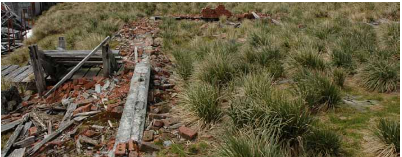
34.4 General view of the site of the Cinema looking eastwards