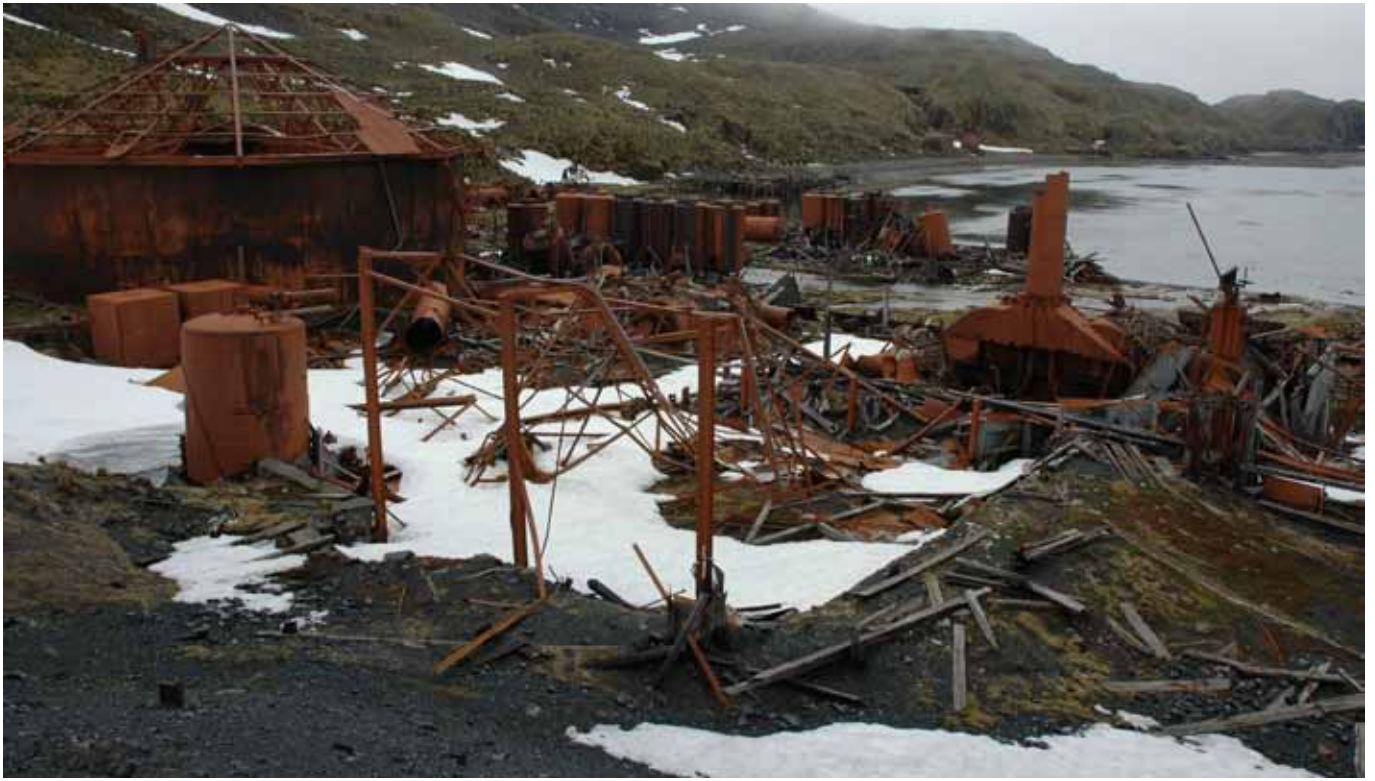
10.4 General view of the Boiler House from the southwest looking northeast