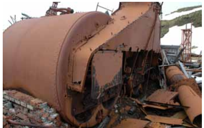
10.2 Detail of boiler