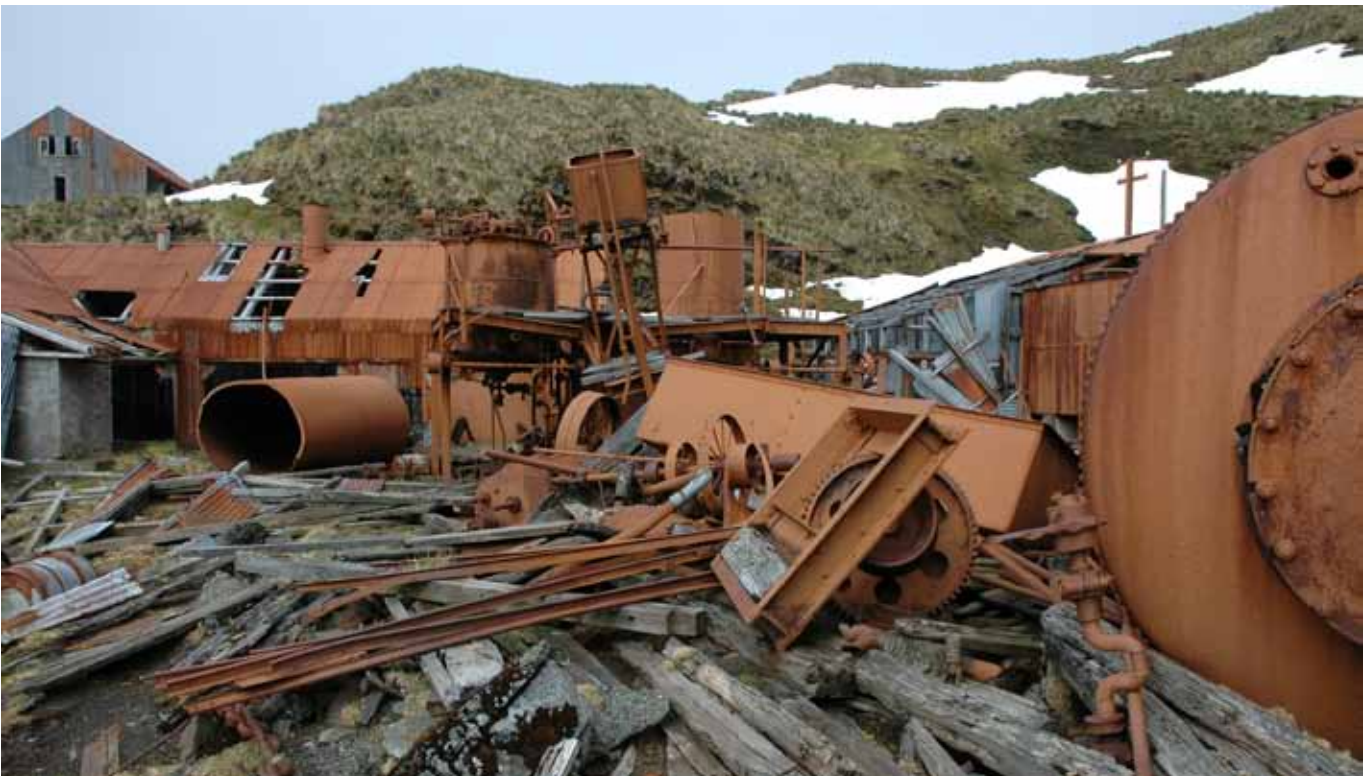
13.2 The remains of the Laboratory looking southwards and showing the material that has been stored on the Laboratory floor