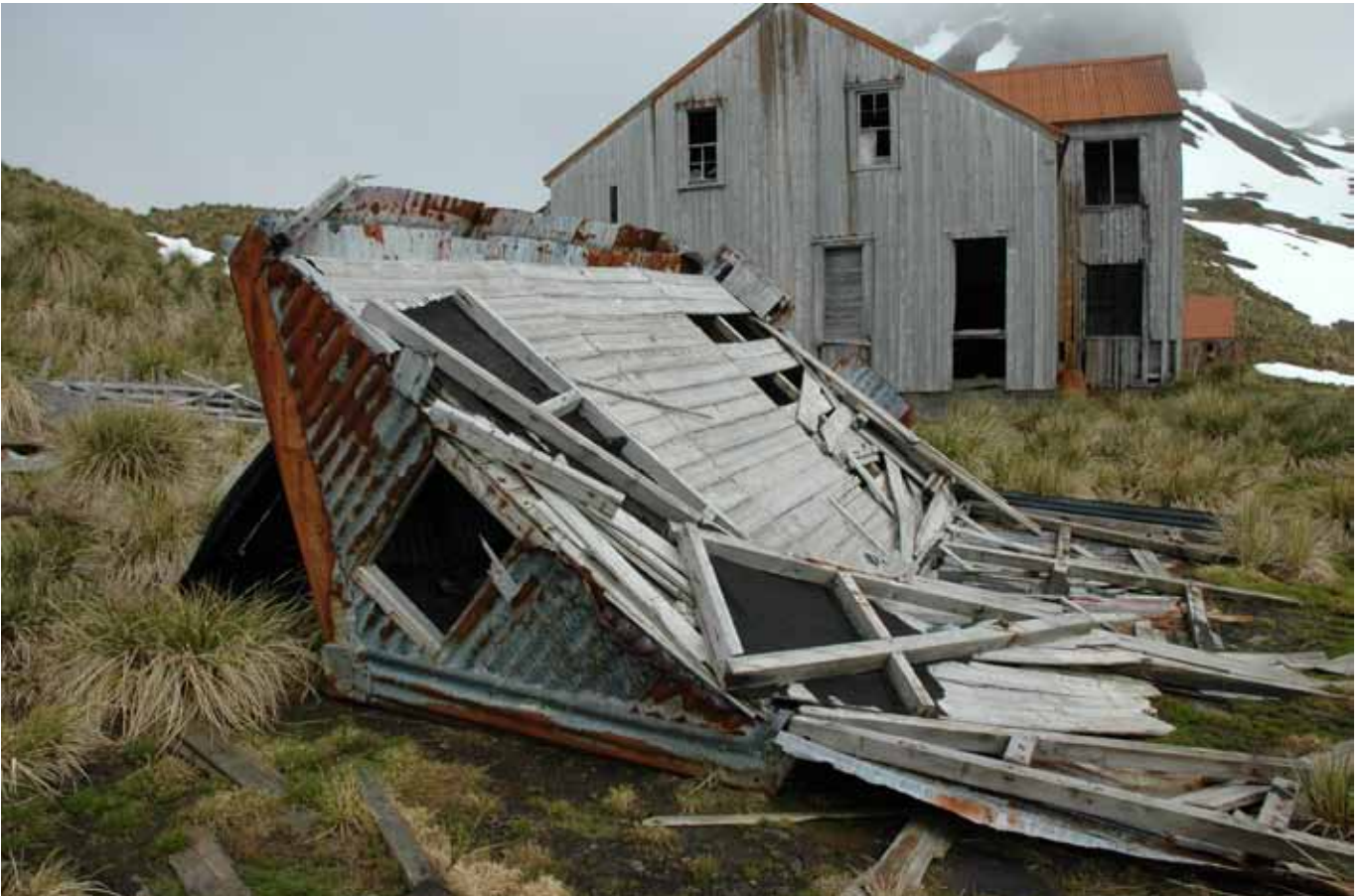
28.3 The roof which has overturned northwards