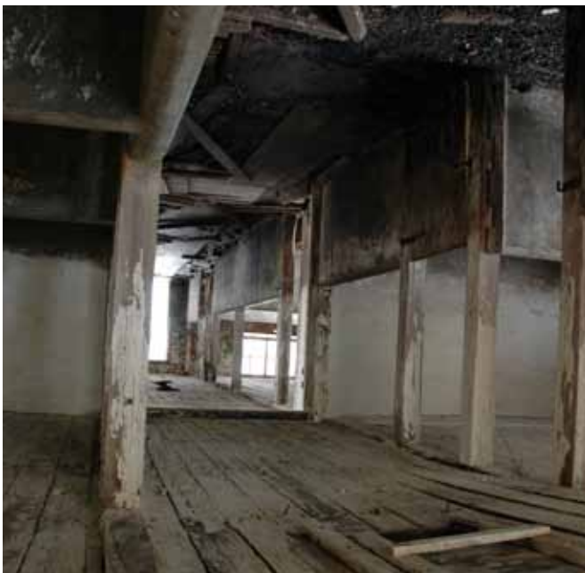
32.3 Detail of the interior