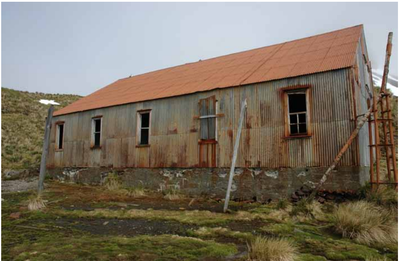
18.2 East elevation