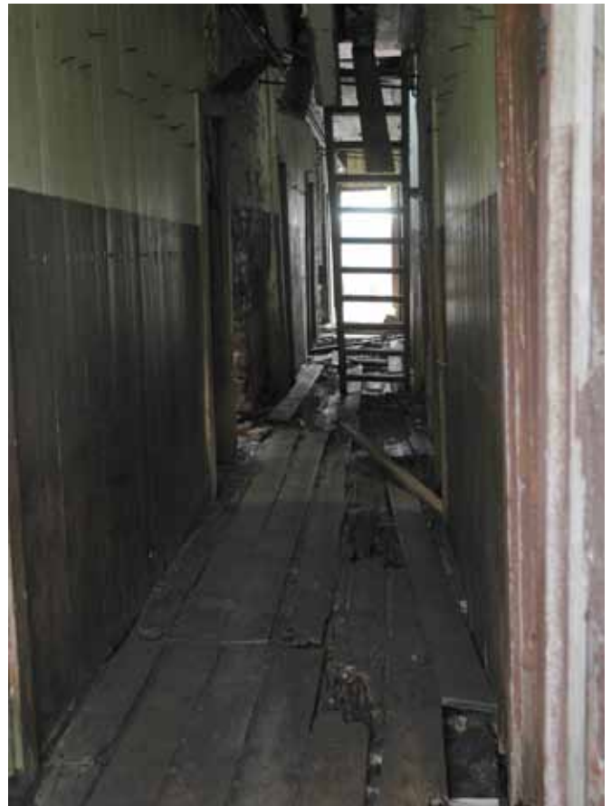
18.6 The central passage on the ground floor