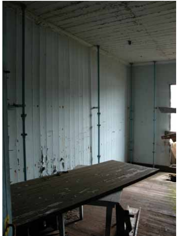
19.1 A typical bunk room

The building is in poor condition with the suspended floor on the ground floor collapsing and the ceiling coming down. The first floor was not accessed.