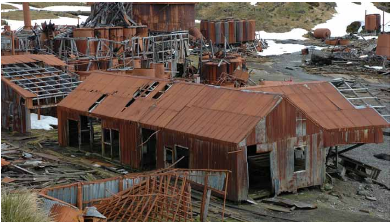
14.3 General view of the south and east elevations