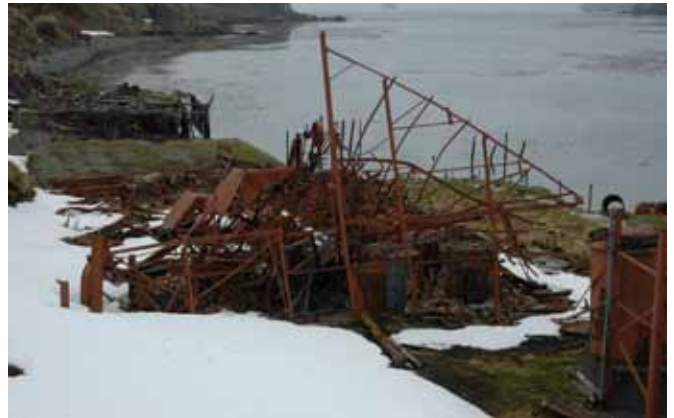
6.1 General view of the Guano Factory from the higher ground to the northwest

The building appears never to have gone the full length of the platform it is constructed on. At the west end this is a concrete platform sitting on the earth; at the east end it is supported on piers. These are concrete on the landward side and timber in the southeast corner supporting a concrete deck.