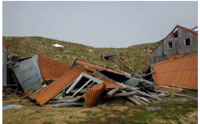
20.1 The remnants of the building from the north

This building has collapsed completely and only the roof trusses and the corrugated cladding to the roof remain intact. The whole building has fallen northwards so the roof now sits some 6m forwards of the original building line. From the size of the walls this would appear to have been a single storey building with a loft which was accessible as a solid flight of stairs remains in the wreckage. The structure of the building seems to have been based on 60mm thick tongued and grooved vertical boarding as an internal skin with battening fixed to it externally and corrugated iron on the outside of that.