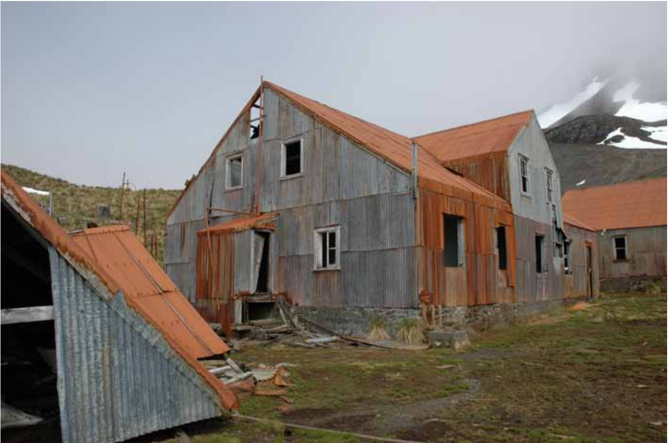
19.5 East and north elevations