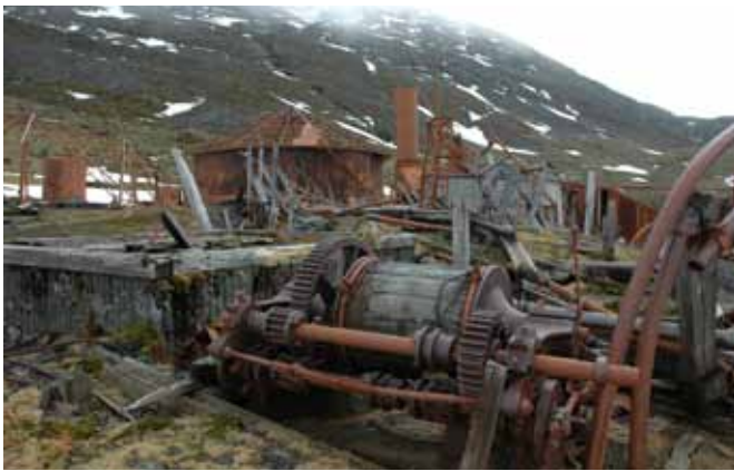
10.5 Detail of the platform and winch at the south corner of the building