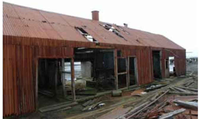
14.1 The south elevation

The carpenter's shop is similarly framed out of 125x125mm timbers clad externally with corrugated iron. The main roof was east/west with what appears a later addition running out northwards. This northern extension of the carpenter's shop was supported on concrete bases cast onto the beach. These have now fallen away leaving the timber plates supporting the floor exposed and allowing the corner of the building to drop. This section of the building is in very poor condition and is also being used by elephant seals as a moulting area which must give the remaining structure considerable battering. It seems likely that this will collapse in the fairly near future. The roof over the westward arm has holes in both sides with, perhaps, 15 percent of the sheeting missing and 50 percent of it damaged to some degree.