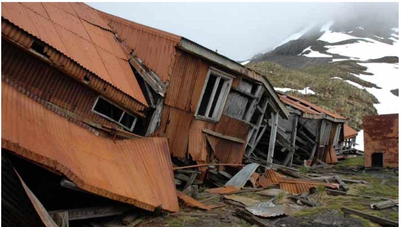
22.3 The north elevation