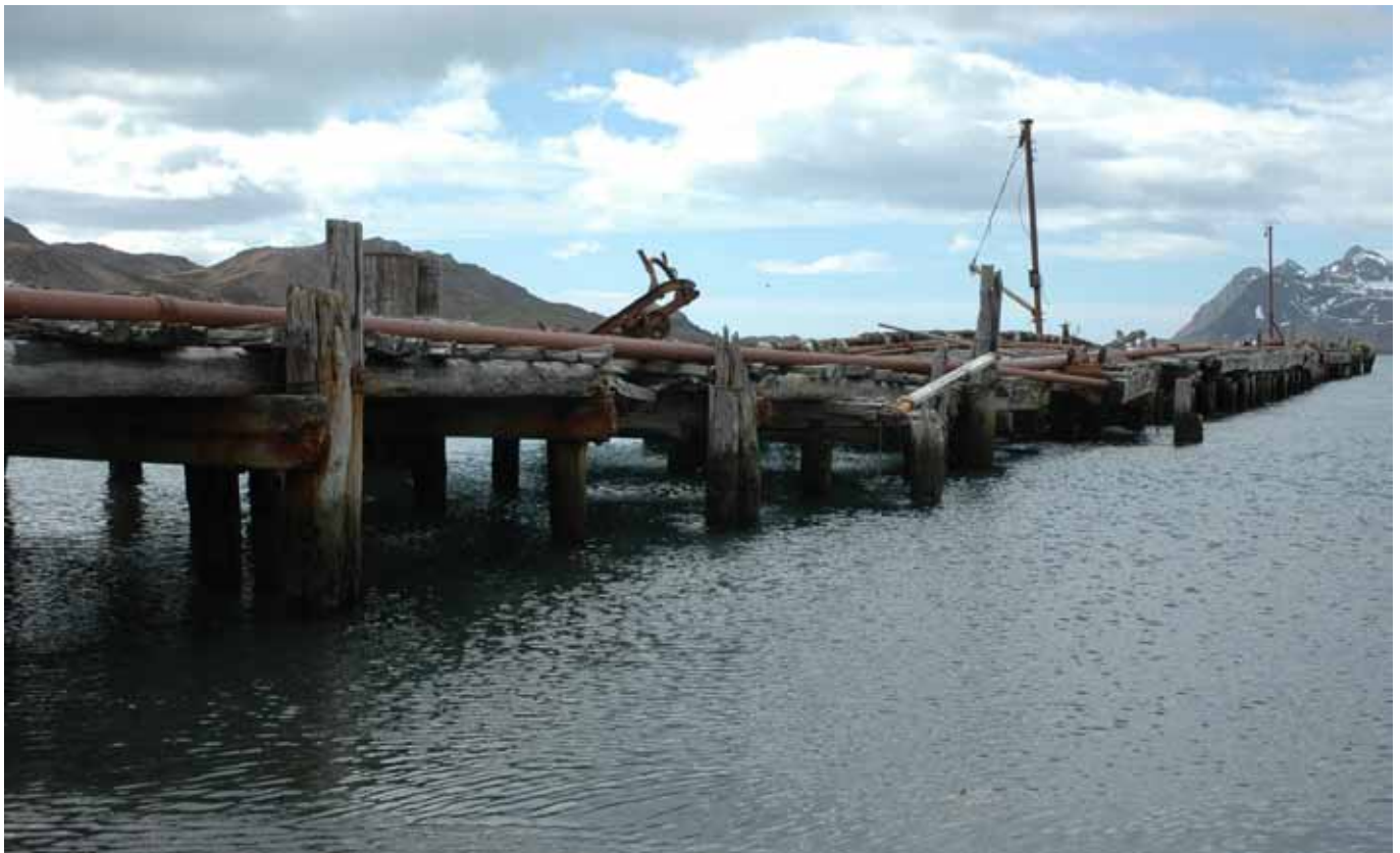
34.2 The south side of the jetty