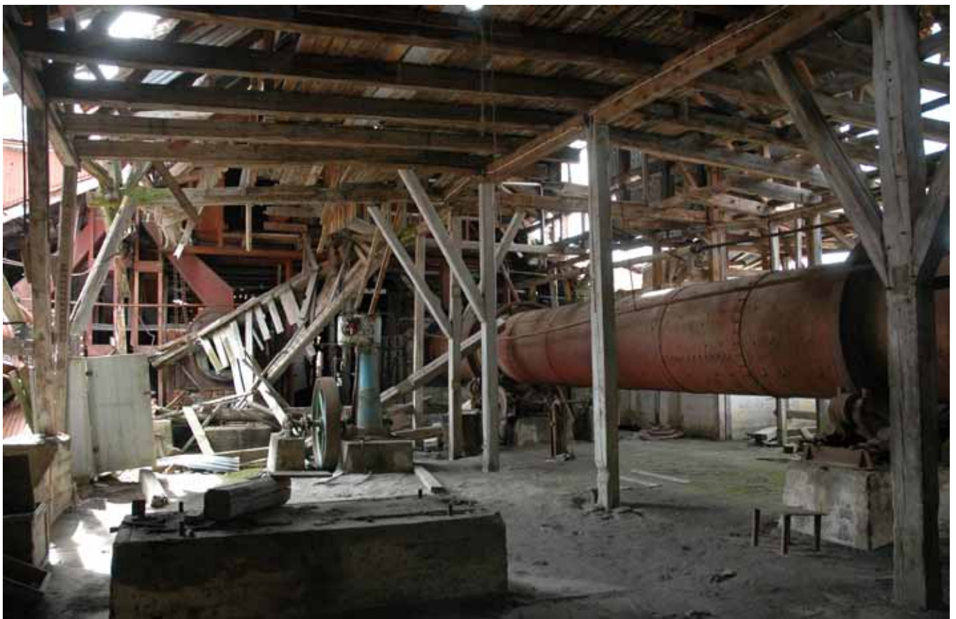
208.1 General view looking northwards of the Guano Factory showing one of the rotary cookers

A section of roof over the central raised floor is missing and the floor timbers and some of the structural timbers below this area are affected with wet rot. A large section of the roof on the west side has collapsed leaving a good deal of the fabric of the building dangling dangerously. There is also an area of collapse where the roof of the store meets the east wing which contained the whale line store. This section of the building still contains two of the rotary cookers and associated bagging equipment and augers and conveyors. A third rotary cooker has been withdrawn and is lying in the guano store shed, though its original location is clearly shown by its concrete base.