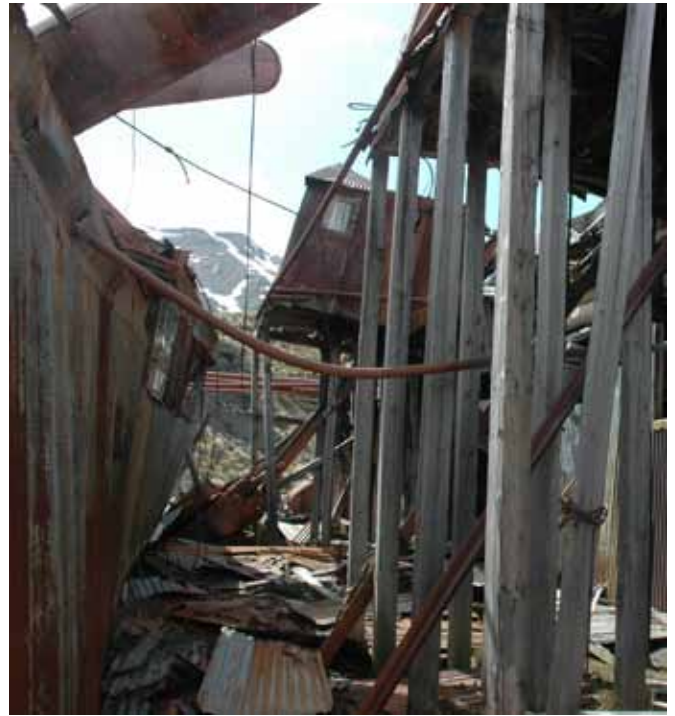
14.2 The east wall of the Boiler House (left of the picture) looking northwards