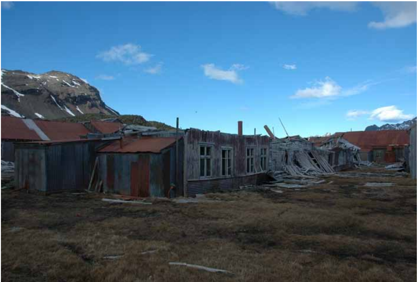
20.2 The south side of the building