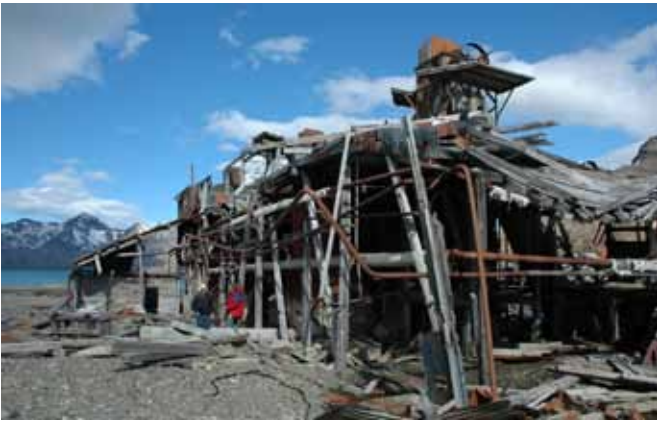
3.3 The north wall of the building