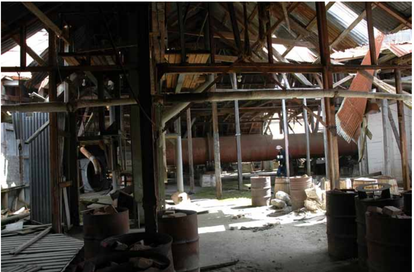
200.2 Whale Line Store looking west towards the Guano Factory