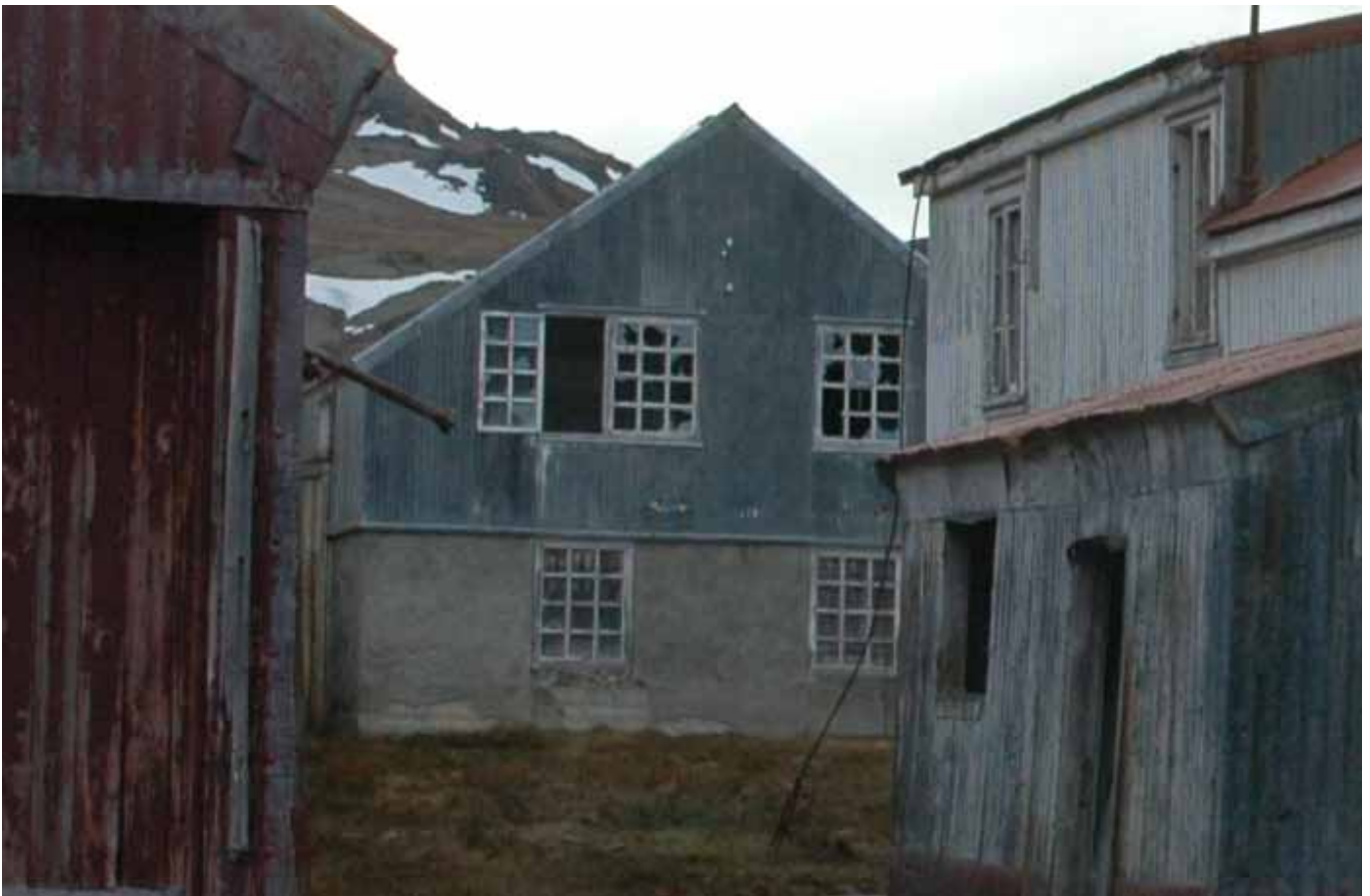
17.1 East elevation

There is a lean-to extension on the south wall with walls and roof clad in asbestos cement sheeting. This is now failing and sections are missing.