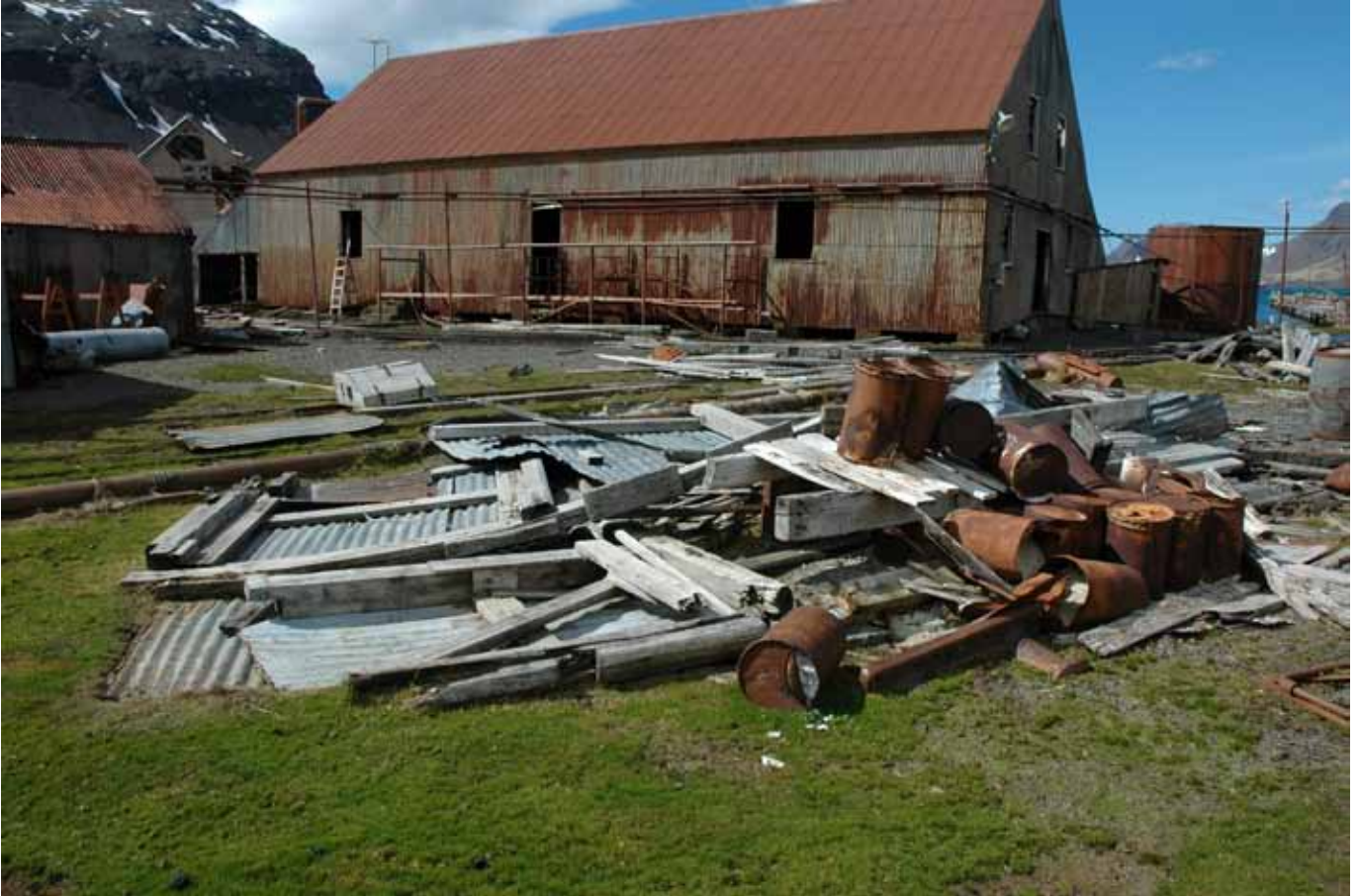
9.1 The remnants of the building with the Catcher Store in the background

The outline of the concrete floor and the base walls still remain but the building itself has entirely collapsed. All that remains is a heap of timber and corrugated iron.