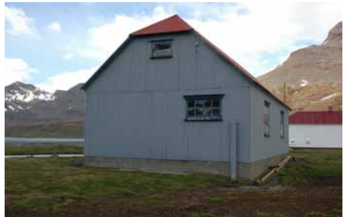
61.2 The north elevation