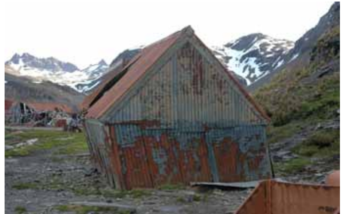
68.1 The northeast face of Store No. 69

The store to the north is in poorer condition. The sheeting on the east side of the pitched roof is damaged and the building is leaning to the northeast. This building looks likely to collapse in the near future.