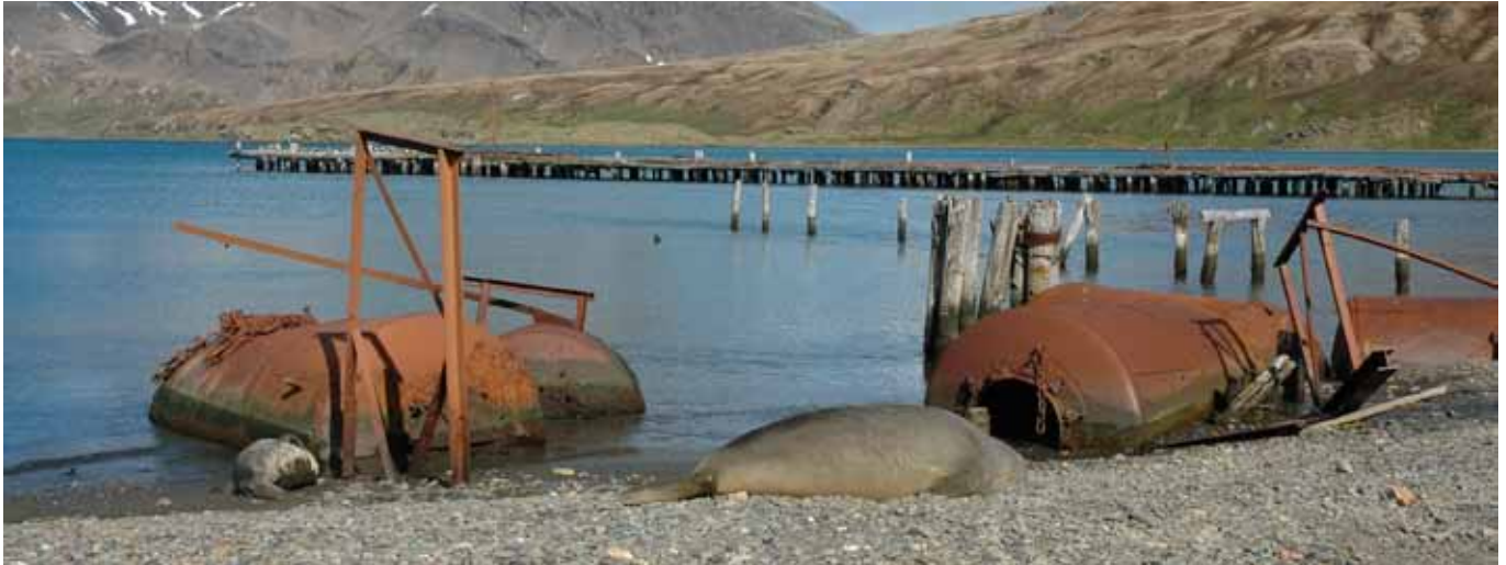
35.1 The remnants of the Jetty are behind the boilers. The long main Jetty can be seen in the background.

This jetty has collapsed with only a few timber posts indicating where it has been.