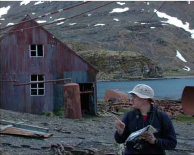
70.1 The Catcher Barracks in the distance with the Mechanical Workshop in the foreground

The Catcher Barracks is a small timber framed two storey building on the scale of a small domestic house. It is built off a plinth of roughly laid rock picked off the adjacent area set in mortar - suggesting that this is one of the earlier buildings on the site. The building is clad in corrugated iron which is in reasonable order. There have been two hold down ties on the building but neither is now functional. Original timber windows and ledged and braced timber doors remain though in poor order. Internally there are series of small rooms with walls and ceilings lined out with tongued and grooved timber boarding. This building is in a condition where it could still be repaired.