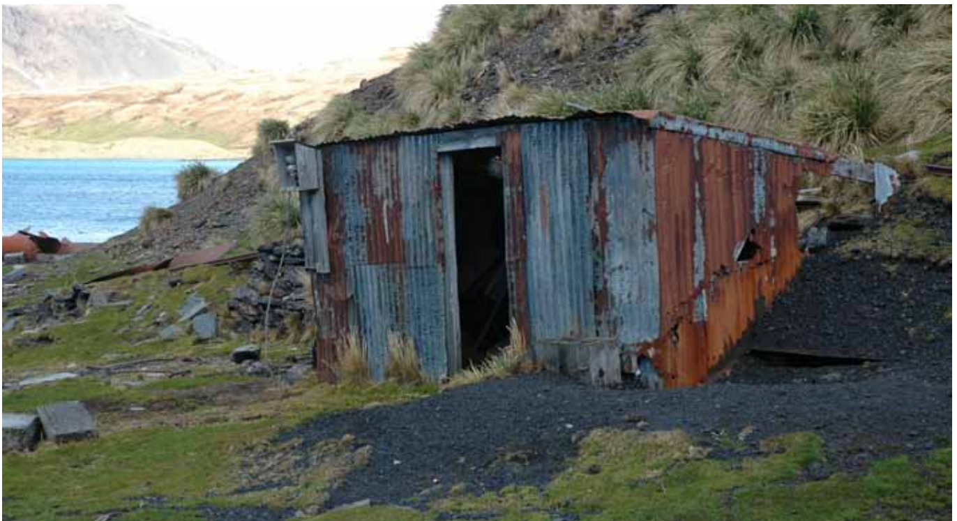
73.1 The north and west faces of the building

A small timber framed building built into the bank behind it. The walls and roof are covered in corrugated iron with holes in the back wall to the bank and in the roof. The door is missing.