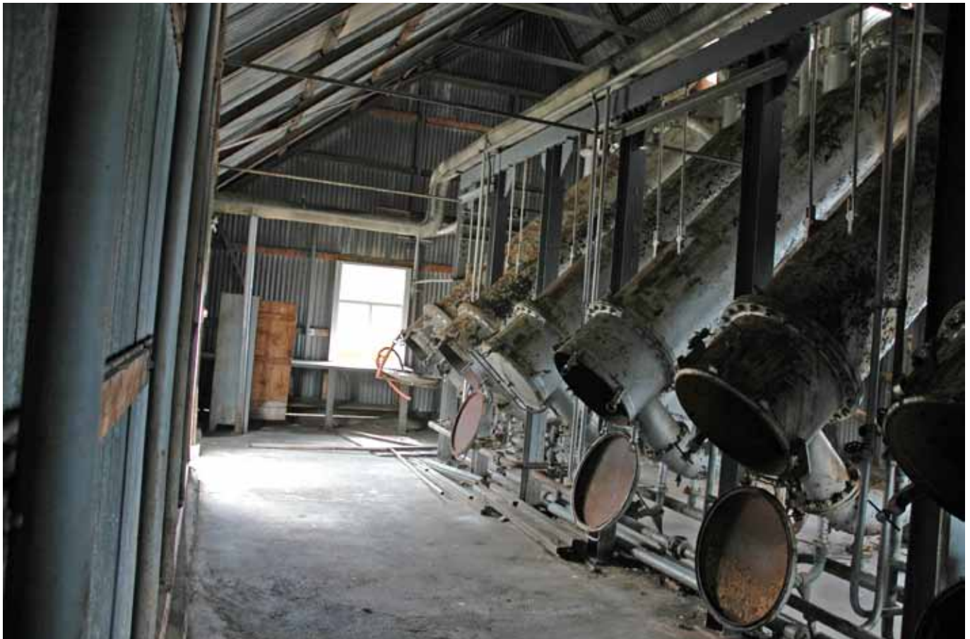
4.2 Interior looking north