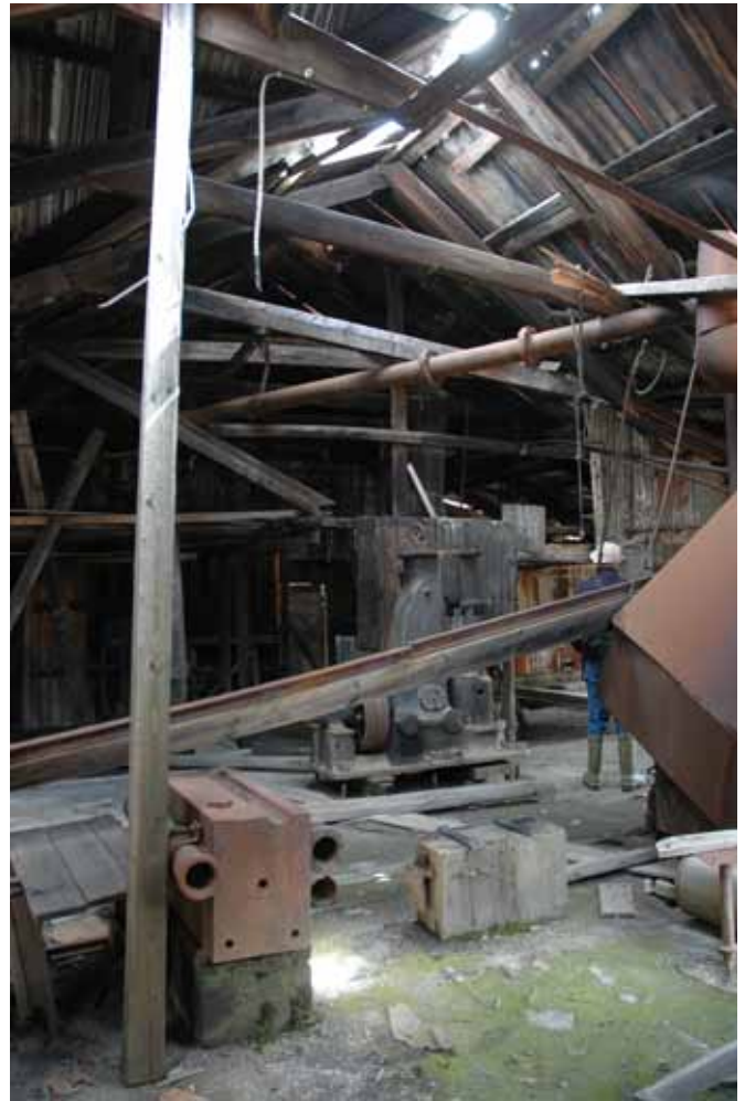
8.4 Interior of the collapsing east wing showing the Blacksmith's Shop

On the east end of the brick store there is a small building with pitched roof with a longer pitch to the south and to the north. This is a supplementary store and appears to be all pipe fittings. It has had a timber floor but this has decayed completely. There is a timber ceiling through here which is sagging ominously. The wall to the east is leaning outwards and the door is off its hinges. This building is an integral part of the adjacent brick store and is likely to collapse when the roof finally falls in with this building.