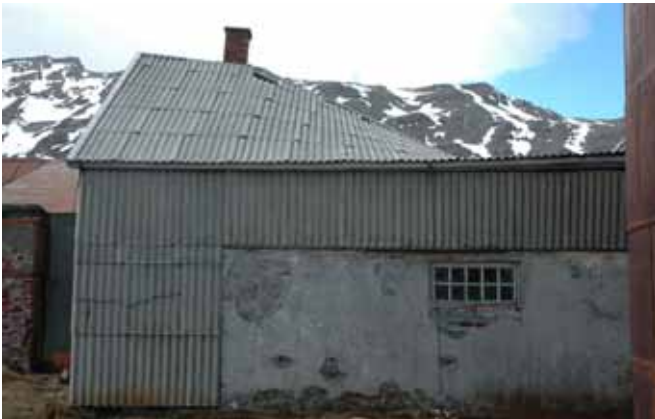
15.2 The north elevation

The walls up to the top of the windows are constructed in brickwork rendered externally; above this the walls are timber framed with a timber roof. The roof and upper sections of the walls are covered in corrugated asbestos cement sheeting. The building appears to have had a first floor in the roof space. The building was not entered as it is now in a state of collapse with the majority of the roof fallen in. A chimney stack remains at the west end but this is likely to be brought down as the roof collapses.