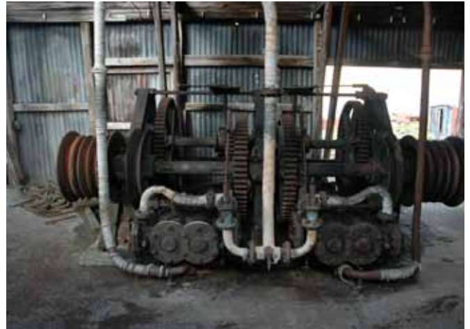
74.1 The winches remain in position

The back wall of the building has been built tight up against the bank behind it. The wall is now in very poor order and part of the west roof has collapsed. The east (front) wall of the building is moving away from the structure and the collapse of this building now looks to be imminent. The building is quite strongly framed which is the reason it has survived so long. There are still two large winches in this building.