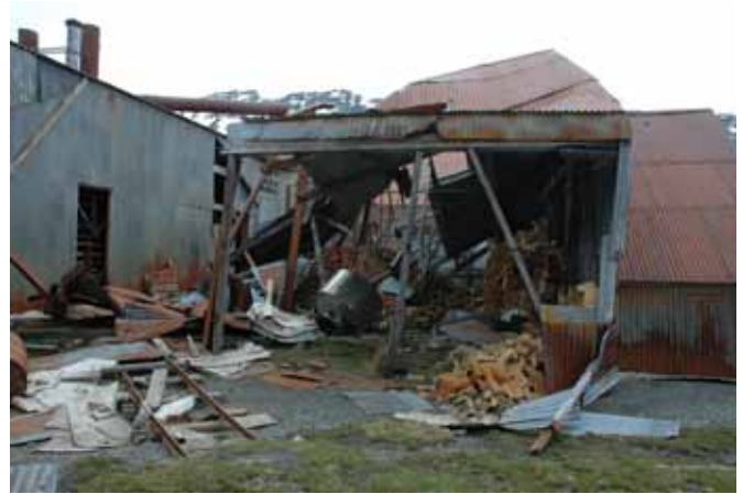
203.1 South side of the Brick Store

Off the east side of the guano store there is a wing that has been used as a brick store. This has now almost entirely collapsed. The only section remaining in position is the east gable, the rest of the building being a tangled heap of timber and corrugated iron. The store still has a substantial number of refractory brick and some commons inside it. On the east side of the brick store is an extension to the building which appears to be a general store. This has a pitched roof and is timber framed and corrugated iron clad with a timber boarded ceiling which is sagging ominously. The building has had a timber floor but only sections of this remain in place. The east wall of the building is leaning outwards. This is really an integral part of the brick store structure and is likely to collapse when the east gable of the brick store finally comes down.