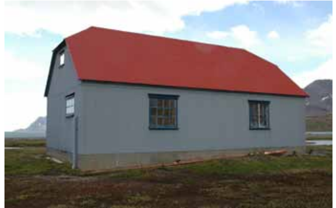
61.1 The west elevation

There has been an internal lining of building paper fixed with timber battens though much of this has fallen away. The loft floor is boarded on floor joists some 175mm deep. This area is being used for storage of quite a large quantity of timber at present. At the south end there is a small boarded room with a window immediately under the gablet. This has been used as a bedroom. The original stair to the loft ran in an east-west direction; this has been replaced with a modern stair running west-east.