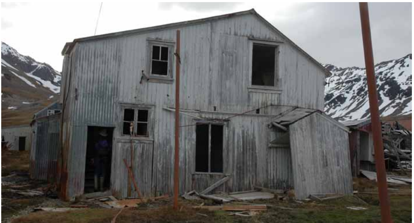
18.2 The east elevation