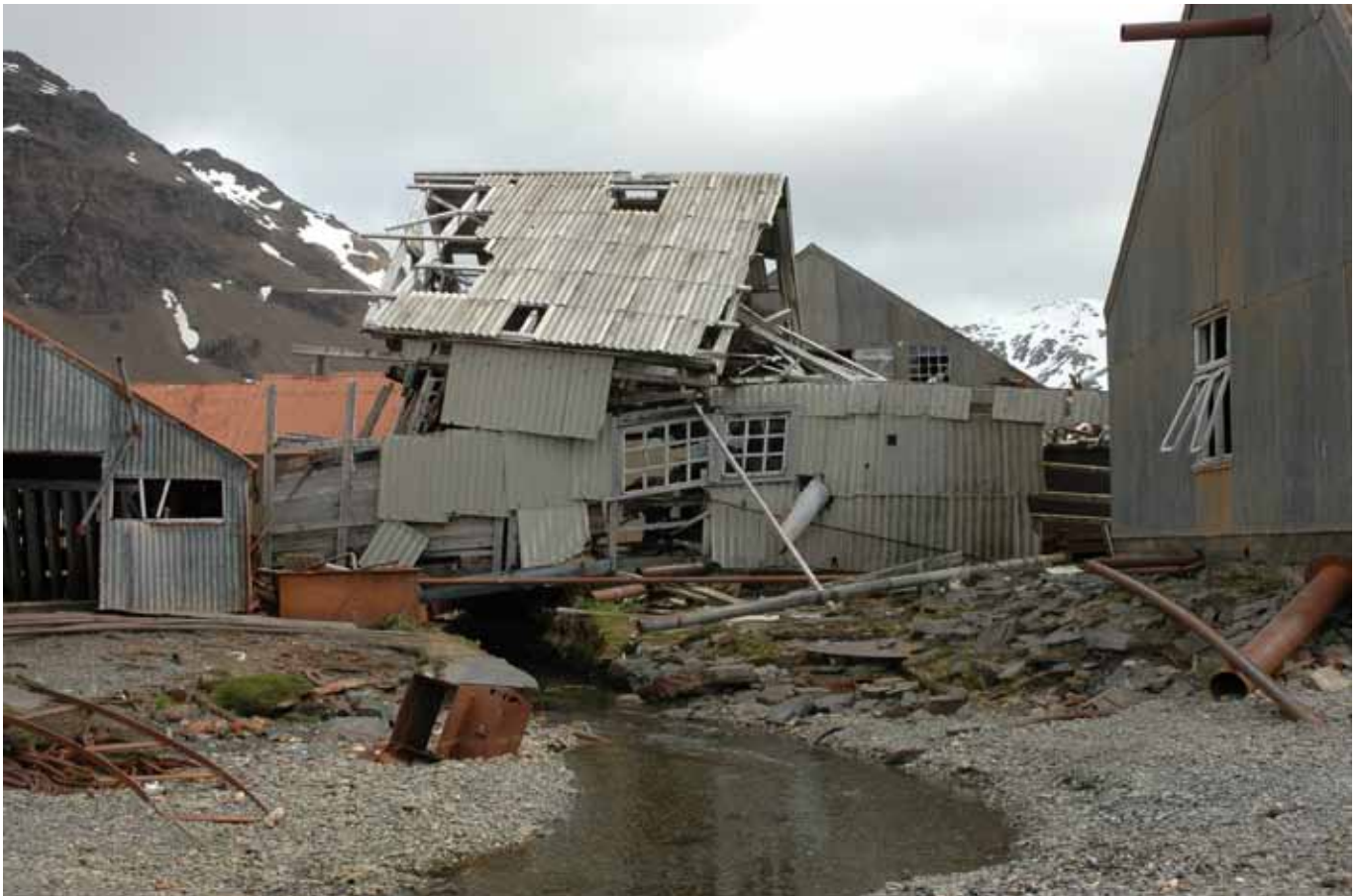
5.2 General view of the building