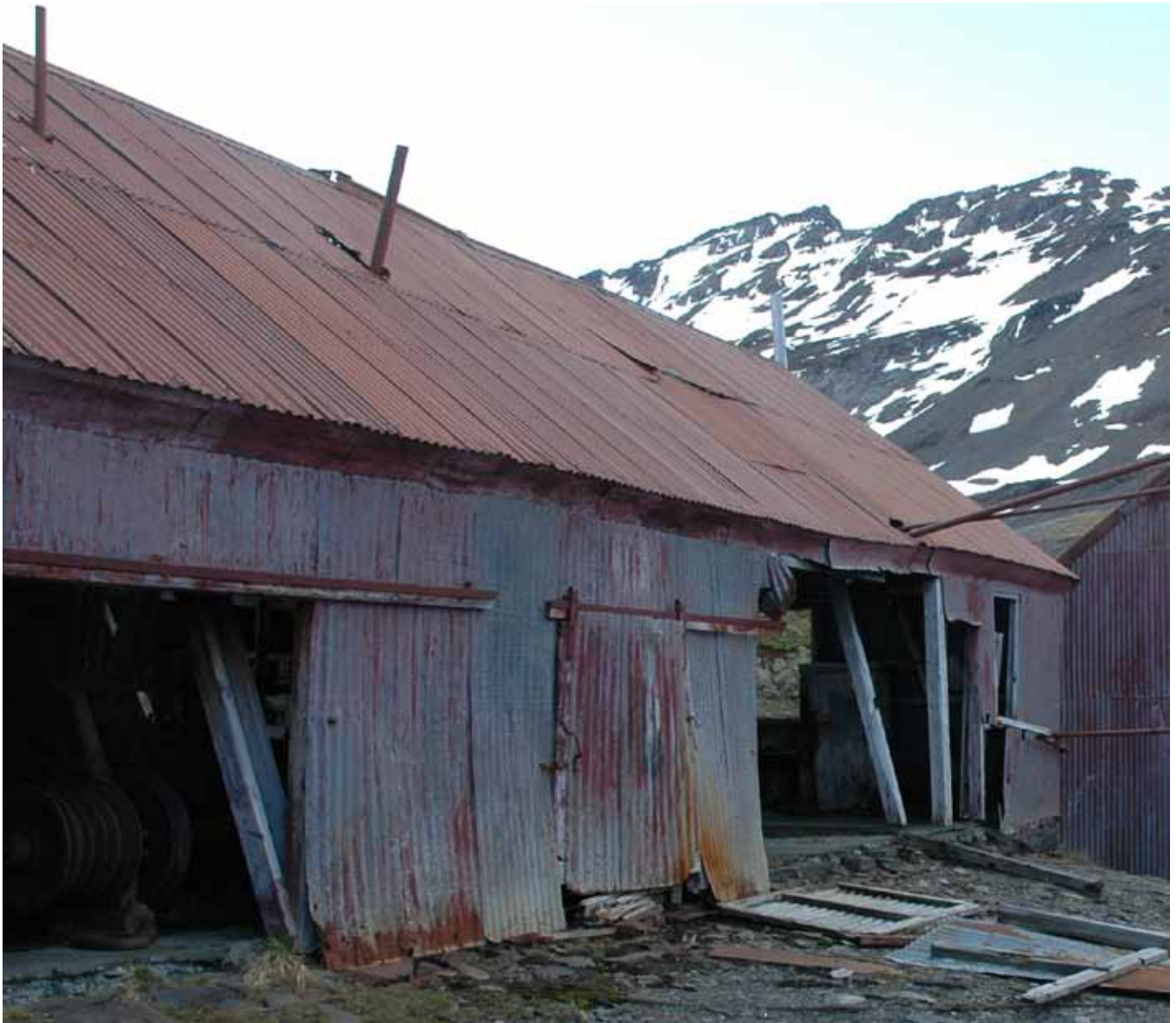
75.2 The east face of the Workshop