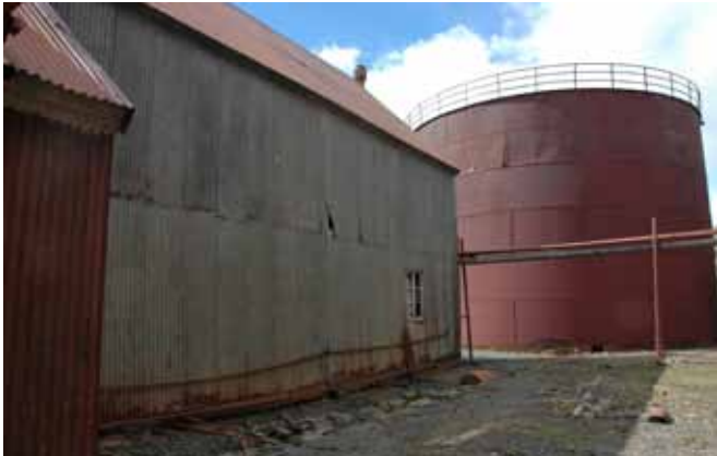
12.1 The west elevation

The entrance door is on the northeast corner with only four small timber windows, two to the east, one to the west and one high in the south gable. There is a small lean-to building on the northwest corner of the main building which is now in a state of collapse. The main building looks solid enough at present - but the fact that sheets are starting to pull away from the walls suggest that deterioration is likely to accelerate.