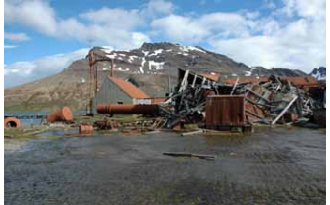
1.2 General views of the Plan looking towards the Meat Cookery