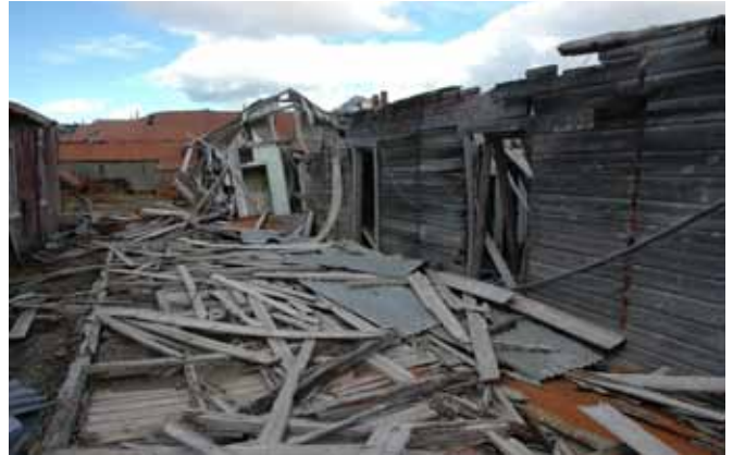
20.1 The east and north elevations

The whole of the roof of this block has collapsed. The building has been built in at least three phases with distinctly different builds and claddings. To the west there is a corrugated clad section. Next to this a section clad in vertical boarding with sprockets showing at the top of the wall and some early top hung casement windows. The east end is of thick horizontal tongued and grooved boards. The building is well beyond the point where it can be saved.