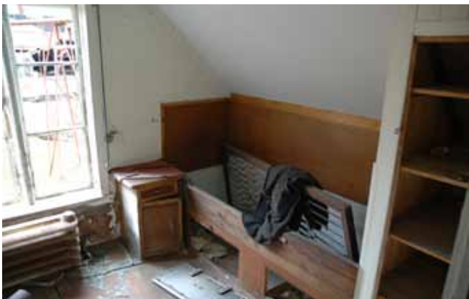
13.4 One of the first floor bedrooms