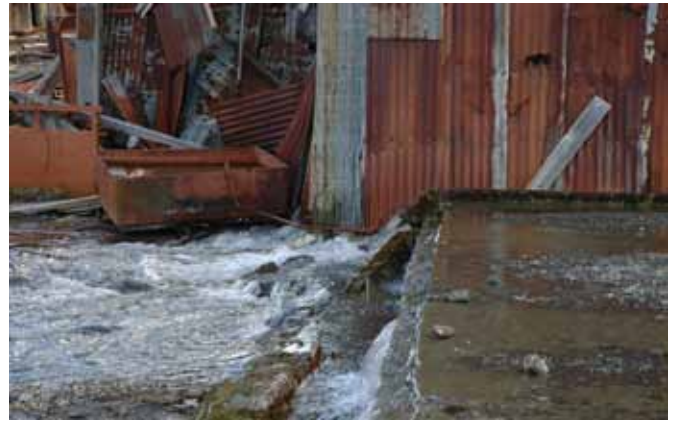
3.4 The stream running across the east end of the building meeting water which has run through the building