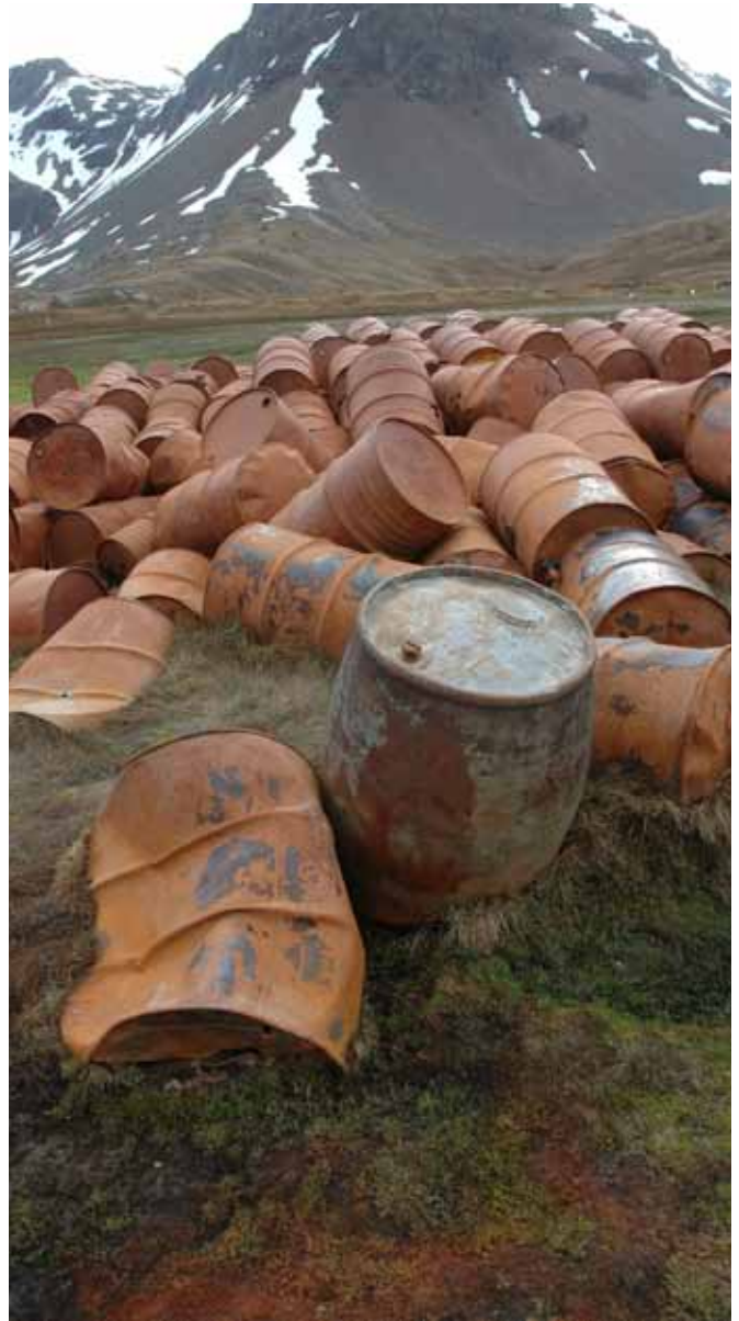
38.4 The heap of 50 gallon drums lying to the east of the Tanks

There is a good deal of standing water around the tanks which is likely to accelerate their corrosion.