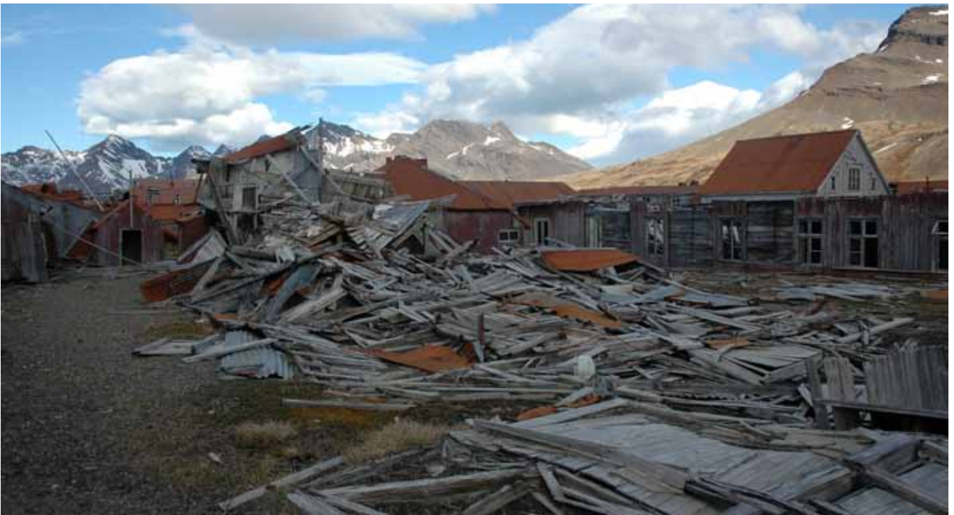
24.3 The remains of the Cinema looking eastwards