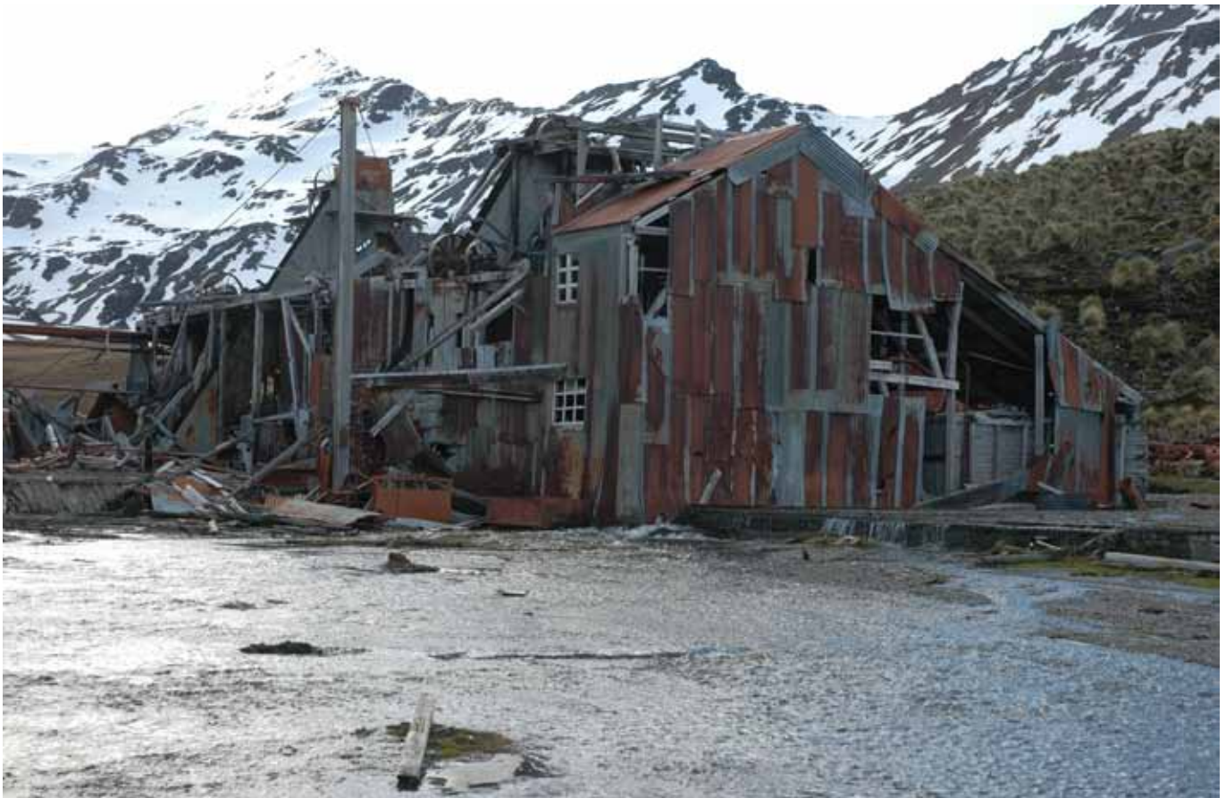
3.2 The south and east sides of the Blubber Cookery