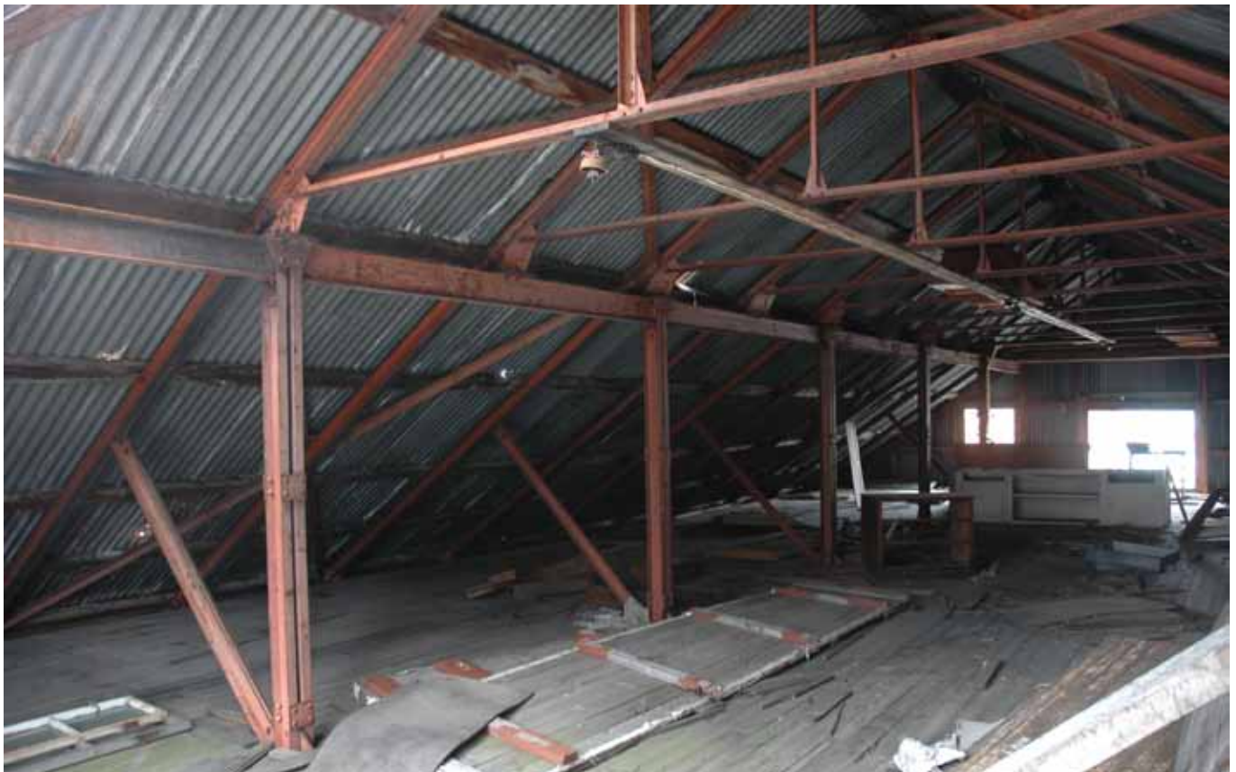
6.1 Roof and storage loft over the main store area

Attached to the southeast corner of the main building is a single storey wing housing the Laboratory. This appears to be timber framed and is clad externally to walls and roof in corrugated iron which remains in good order. The laboratory benches remain in position, drawers and a sink. There is a substantial fume cupboard which still has a flue but the interior generally is in poor condition. Timber floor covered with linoleum.