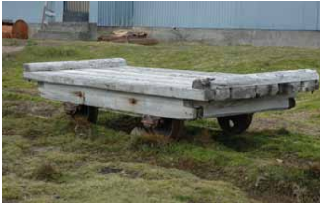
33.1 One of the few remaining railway trucks

The remnants of the railway system were not inspected in any detail. A considerable amount of the track remains in place as well as some of the bridges and old railway cars.