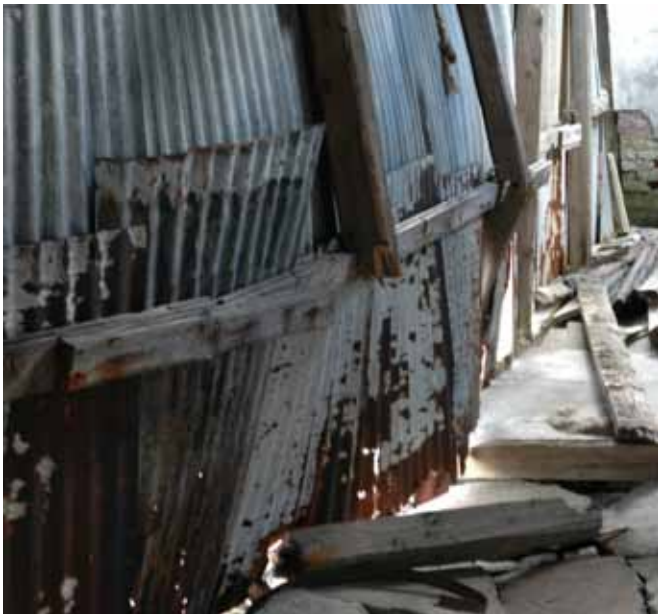
16.2 Detail of the collapsing south wall and the broken concrete floor

A single storey building although there has been some use of the loft space. The provision store at the north end has a floor at wall plate level which is heavily propped with iron posts to the south and timber posts to the north. The upper floor here has been used for storage. The ground floor has been in concrete, but is now completely broken up. This area has probably had water flowing through it at some time. The south wall in corrugated iron is buckled and several of the timbers are cracked. The western section of the provision store has earth banked up around a masonry wall. The floor above this area is of heavy timber construction with cinders between the joists for insulation, the floor being propped with two rows of timber posts. The section of the wall on the north side has fallen in and there is plenty of loose corrugated iron here.