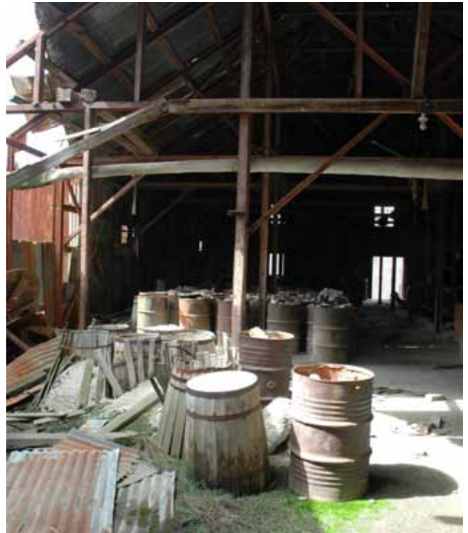
200.1 Whale Line Store looking east

The lean-to on the side of the main building next to and north of the whale line store has collapsed and has taken part of the roof and some of the wall sheeting of the whale line store. There are timber windows on the northeast and south sides though the frames are generally missing. There is a doorway for a pair of doors in the east wall, but the doors are missing. The area is currently being used to store bricks. Apart from the west end this building is solid.