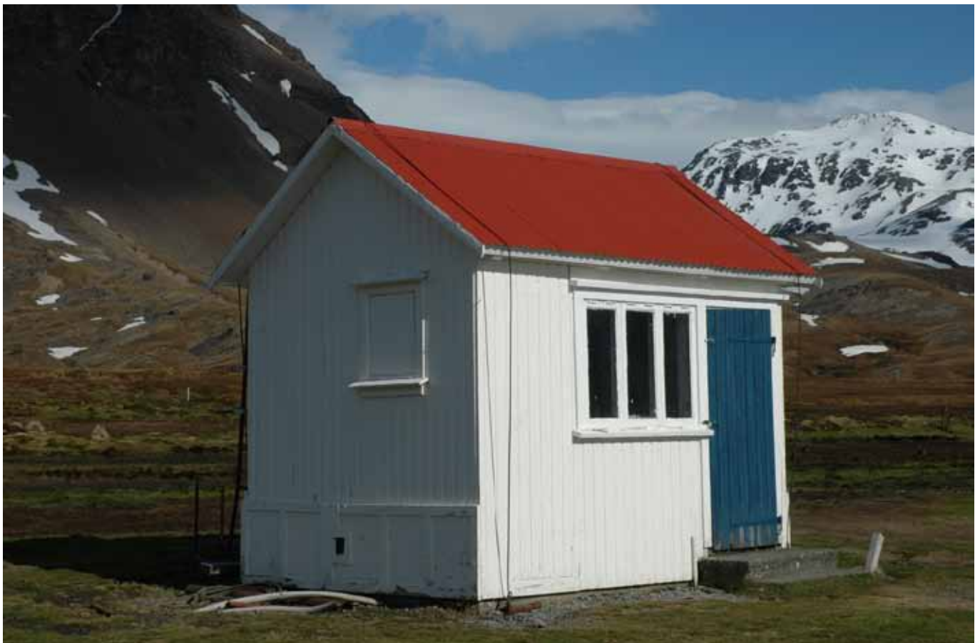
63.1 South and east elevations

Outhouse to the manager's villa. Rectangular building approx 4x2.5m with a pitched roof running north/south. External timber boarding on a timber frame. Ledged and braced door (later replacement) and top hung casement window. Earlier door located in southeast corner and a small window now blocked on south wall. There have been two wire tie-downs over the roof but both are now loose. This building appears to be in reasonable order.