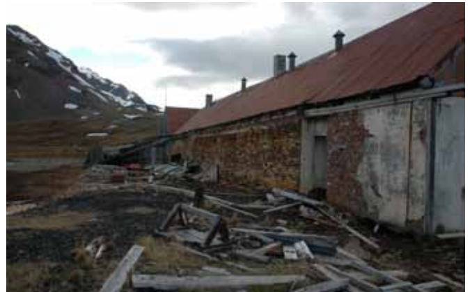
25.2 Collapsed lean-to on south wall

Internally the building is in poorer shape with some subsidence and/or heave disruption and cracking to the floor and pens.