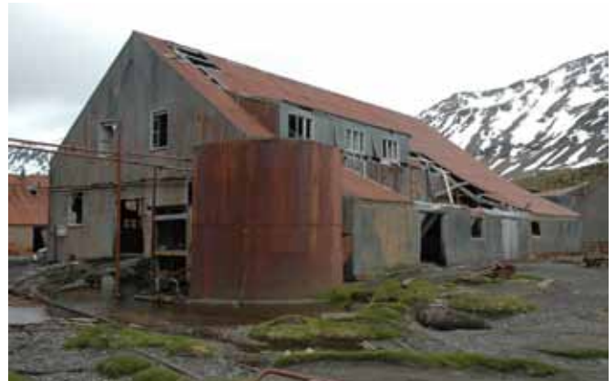
7.2 South and east elevations