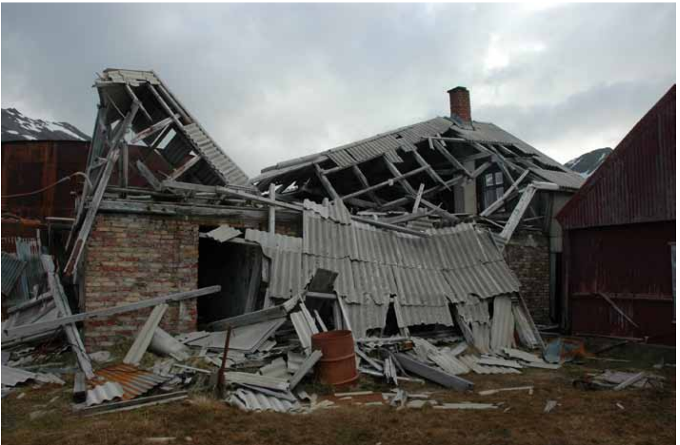
15.1 South elevation - the extension to the west can be clearly seen