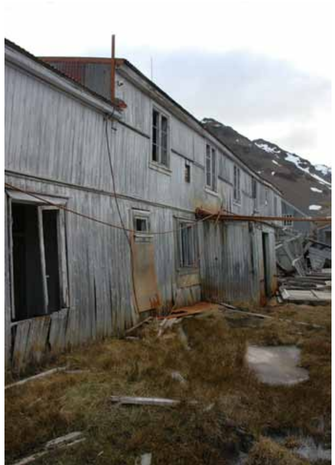
18.1 The north elevation

This building has been altered and extended on more than one occasion. It is a two storey building, timber framed and clad externally in vertical timber boarding with a corrugated iron roof. Windows are timber casements and the building was entered by porches on the north side. The building has been severely affected by water with the concrete ground floor broken up, much of the lower timberwork of the walls rotted away, particularly on the north side. The walls are now bulging and the collapse of this building must now be imminent.