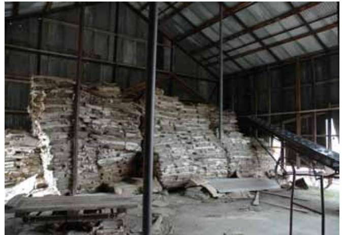
211.2 General view of the interior of the main store looking northwest