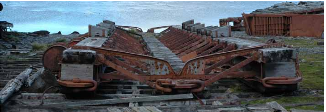
71.1 The slipway adjacent to the Karrakatta

The slipway is still in remarkably sound condition. There are two of them, one of which now has Karrakatta sitting on it.