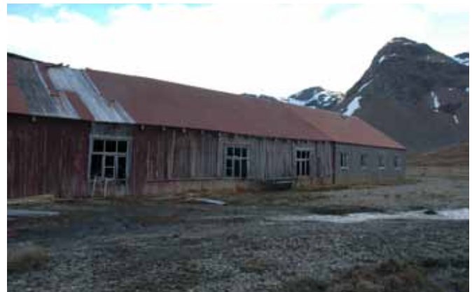
22.2 The north face of the building west end