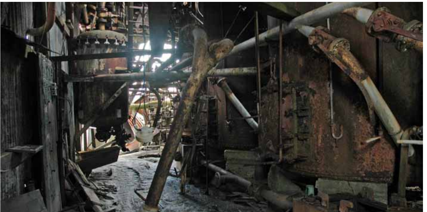
207.3 The northwest corner of the Bone Cookery showing the stream flowing into the area