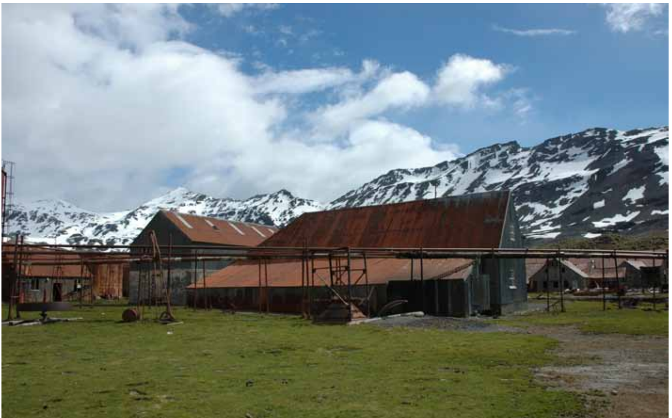
10.2 South elevation