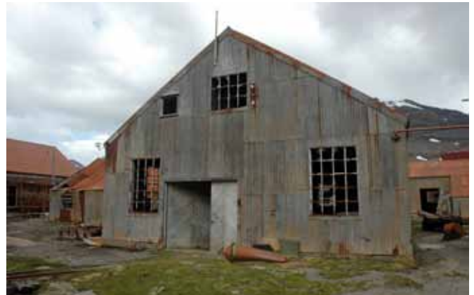
8.1 North elevation of the west wing

To the south of the main part of the building is a high single storey extension housing the welding shop. This is built in brick with a steel framed roof and steel windows in the south gable. The masonry north wall of the welding shop has, as noted above, been displaced by the rotation of the collapsing roof to the north and now has big cracks running through it. The collapse of the adjacent roof is likely to bring down at least part of this wall and it is unlikely that the remainder of the building will survive for long once this happens.