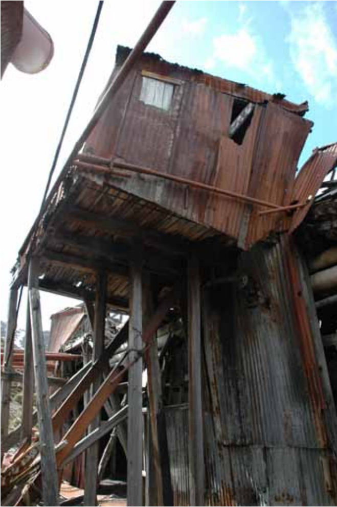
207.2 Collapsing winch house next to the bone loft