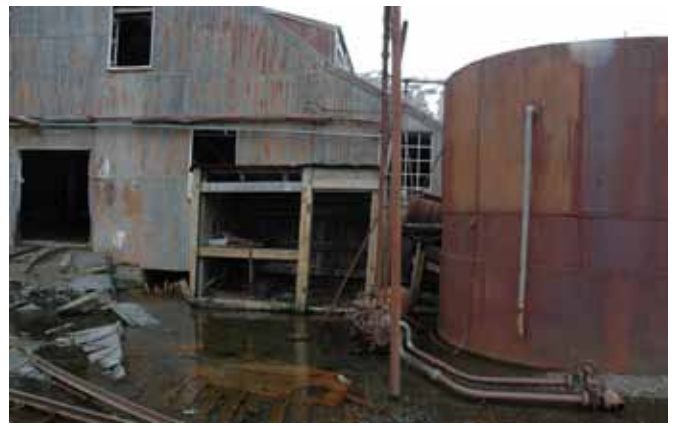
7.1 South and west elevations

The window openings remain but the frames have gone from the gable end windows and the floor is also in poor condition by the north gable end. There are three windows on the west side of the building at ground level, again with no casements remaining. A door and window on the south side both missing. There are three lean-tos against this building: that to the north is still in solid condition but those to the east and south have both partially collapsed.