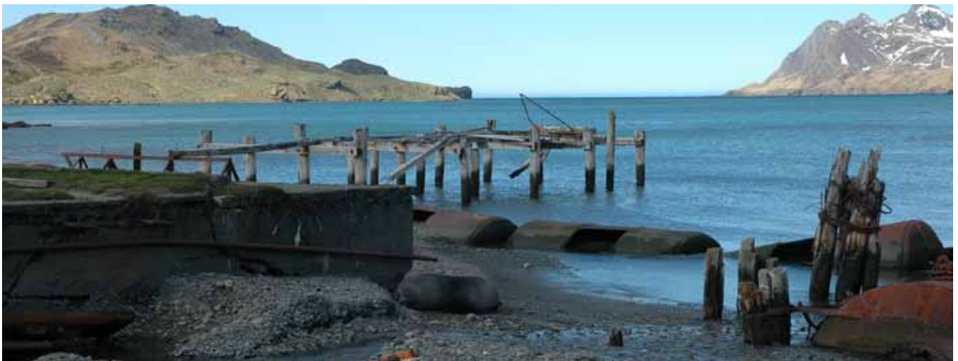
37.1 The Jetty seen from the southwest

This jetty has collapsed with only the timber posts and a few of the main timber cross pieces remaining in position.