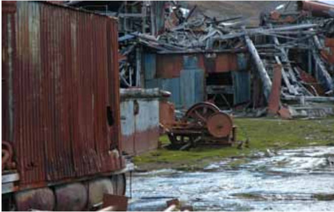
1.1 Detail of the Plan deck showing vegetation growth

The Plan still exists and is defined by the three cookery buildings despite their collapsed state. Some of the timber boarding, possibly a good deal of it, survives but the majority of the area is now under water. The stream which was contained to the north of the blubber cookery has burst its banks and now runs diagonally across the Plan, the majority of the water running through and around the blubber cookery, but with some running through the bone cookery area. The water has deposited a good deal of gravel on the Plan. There is also some vegetation growing between the boards. A number of winches and one small winch shed remain in position.