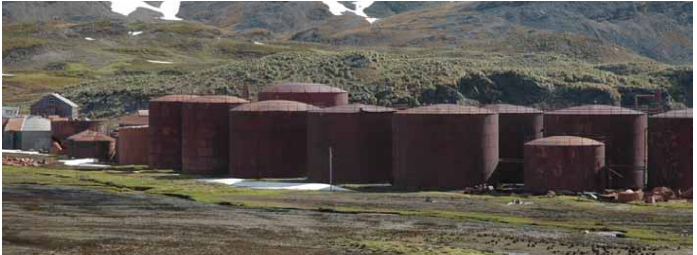
38.1 General view of the Tanks taken from the high ground behind the Manager's Villa

Tank No.42 has one plate which is severely corroded and its neighbour above has corrosion starting. Above this, at the junction between the roof and the side walls, there is a line of corrosion showing as small holes which is introducing a significant weakness into this tank. Plates are also corroded on the south side at the same level. Possibly this was the level the tank was left filled.