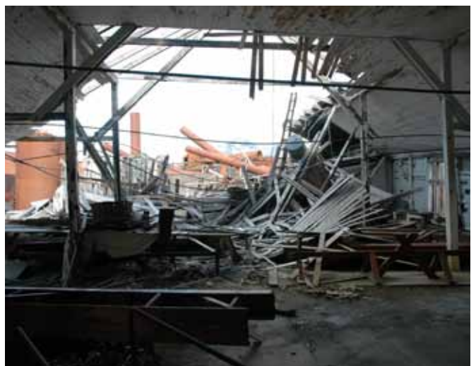
22.4 The collapsed kitchen seen from the remnants of the mess room