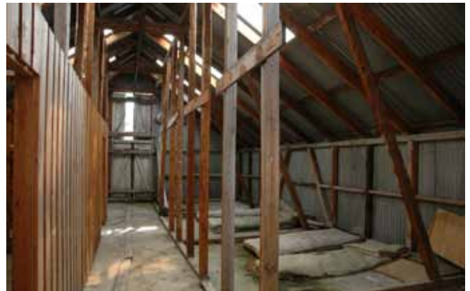
11.2 The Laundry on the ground floor