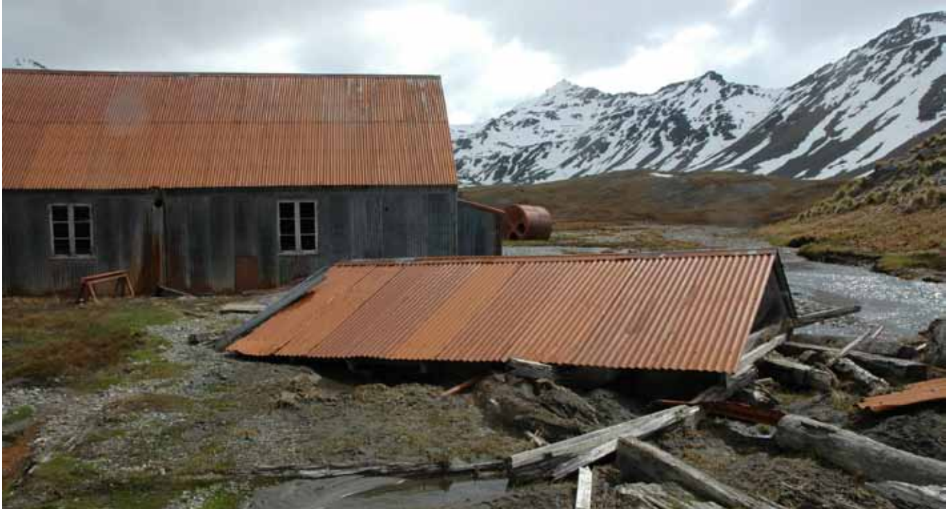
29.1 The surviving roof of the Whale Meat Store

This building was probably always set below ground level for temperature control; however, it has now collapsed and the roof is still framed up and covered in corrugated iron but lying on the ground a little distance from its original location and the remnant of the store is full of water.