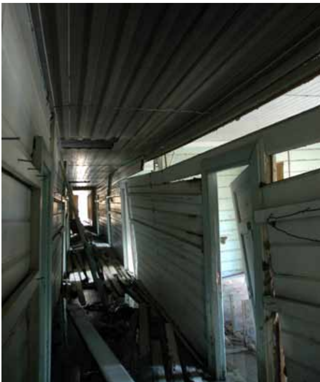
22.3 The passage along to the south side of the building