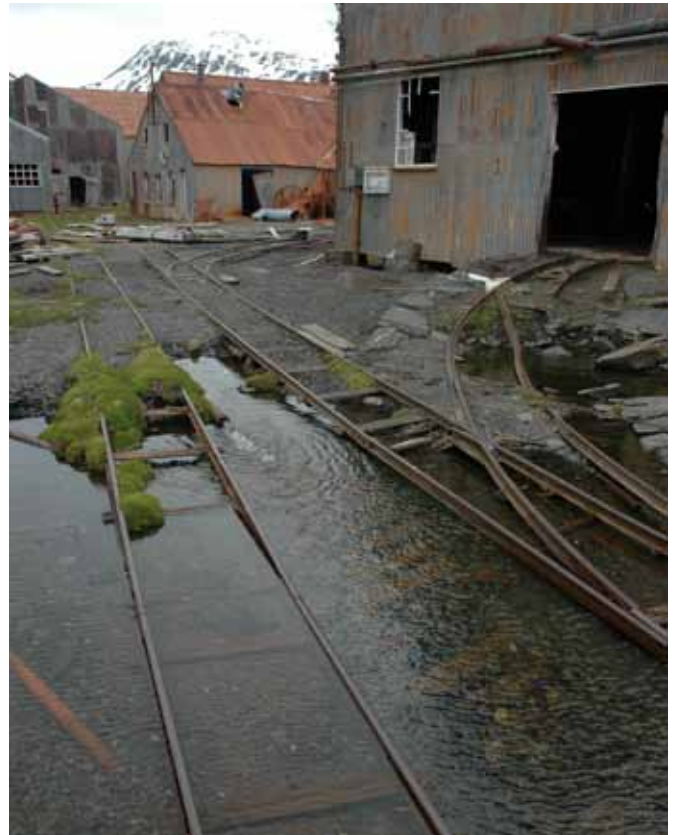
33.2 Railway track from the main jetty part of the south end and into the catcher store (No. 7)