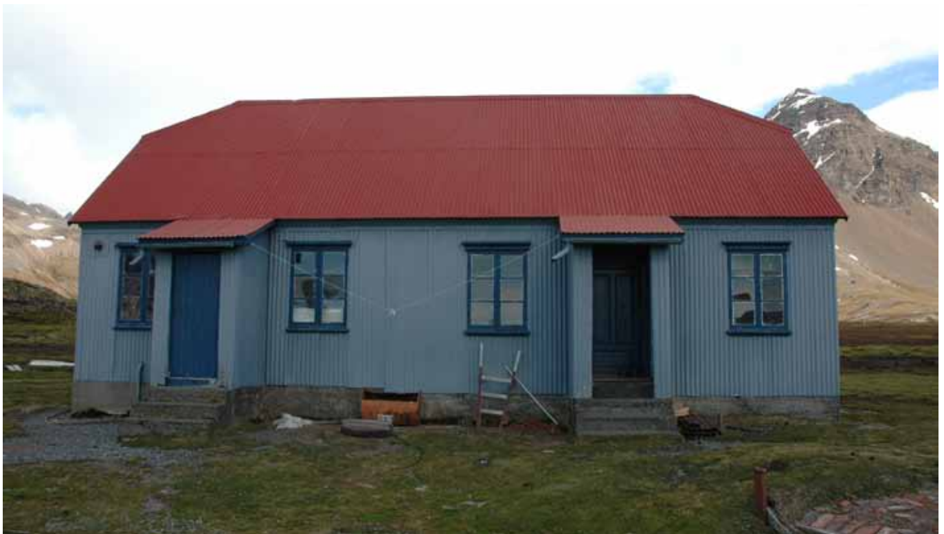
61.3 The east elevation