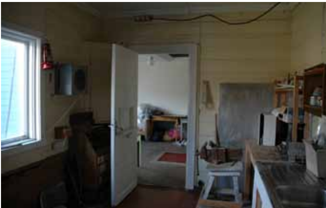
64.1 Workshop on the west side of the building

Built from a 100mm thick timber frame with a pitched roof running north/south with gables and hip at either end. There is a wing at the northwest end of the house which is probably original and then two extensions that are later, one at the south end that carries on the main block of the house though narrower and a lean-to on the west side. The house is raised on a rendered brickwork base with the main entrance on the east side through a small porch, with the floor raised five steps above the ground level. The walls are clad externally with feather edged boarding which is painted white on the seaward side and blue on the west side where it faces inland. Internally the walls are lined with vertical boarding though this is covered with hardboard in several rooms. The house has been extensively refurbished recently with a completely new pressed metal roof. Generally the timber windows remain but two on the east side have been replaced with UPVC. This building is in reasonably good order.