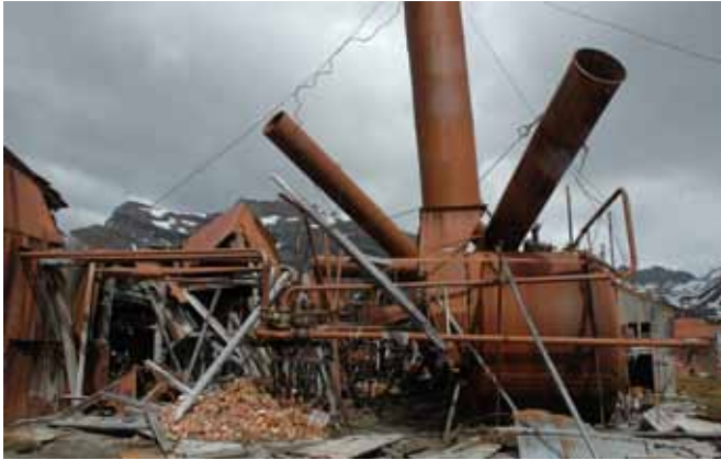
14.1 The north end of the Boiler House

The Boiler House stood immediately to the west of the Bone Cookery. A tall single storey building constructed with a timber frame and timber pitched roof, all clad externally in corrugated iron. This building was not looked at very closely as it is in a state of collapse with its seven tall steel chimneys all having fallen across the roof. Only the south end of the building retains some of its roof though, even here, sheets are missing and the walls are bulging.