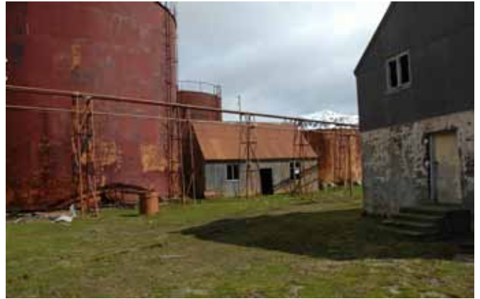
13.1 East elevation

A rectangular timber framed building with a pitched roof running north/south; walls and roof all being covered in corrugated iron. The walls are generally unlined except in the southeast corner where some office space has been created with a suspended timber floor and walls lined out in hardboard. This space is now used as a dump for old radios parts. There is a first floor and an attic space; the first floor being strengthened by a timber beam mid span which is itself propped on a timber post. The upper floor has a bedroom in either end, each with a timber casement window in the gable, the bedrooms being lined out. In the central area there is a urinal fixed to the wall, but no traces of any other bathroom fittings. The first floor is reached by a steep timber companion stairway immediately inside the entrance door in the east wall - the door being missing. There are two timber casement windows to the ground floor, both in the east wall. The corrugated iron is rusty and there are some holes in the sheet to the walls - but other than this the building is still reasonably solid.