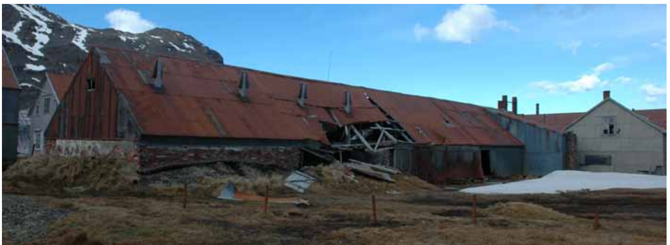
16.3 The south elevation