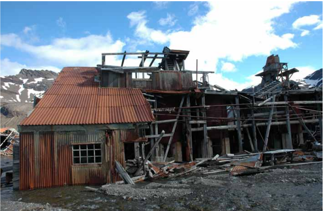
3.5 The northeast corner of the building