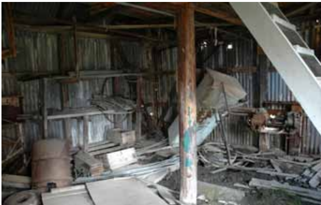
13.3 Interior ground floor main space