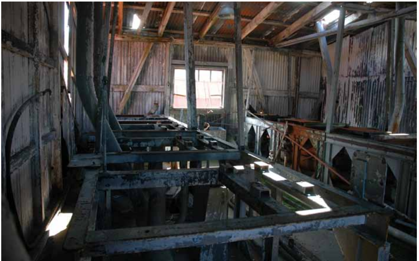
2.2 General view of the high level extractor area looking west