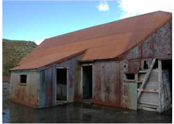
28.1 The west side of the building

This is an 'L' shaped building with the Carpenter's Shop in the east wing. The building has timber framed walls and roof clad in corrugated iron. It has had a timber floor but at present the stream is running through the centre of the building both damaging the timber and undermining the footings. This has caused the south wall to start to fail and lean outwards and the roof slope is now distorted. This building is likely to collapse soon unless the stream course is altered.