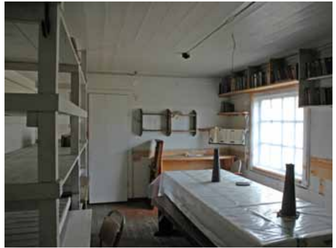
51.5 General view of the interior

The electric cables came in at the northwest of the building. There is the remains of the radio mast lying behind the hut.