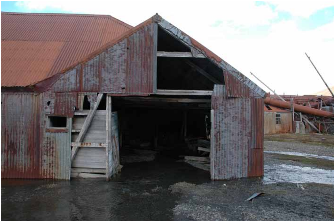
28.2 Shows the stream now running through the building