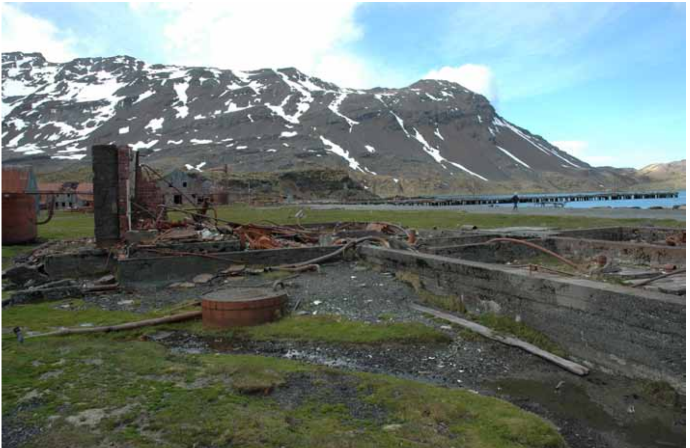
67.1 The site of the building looking north

This building collapsed a long time ago. All that now remains is the concrete walls that would have supported the wall plates and floor. There is a remnant of a brick wall where the chimney stood.