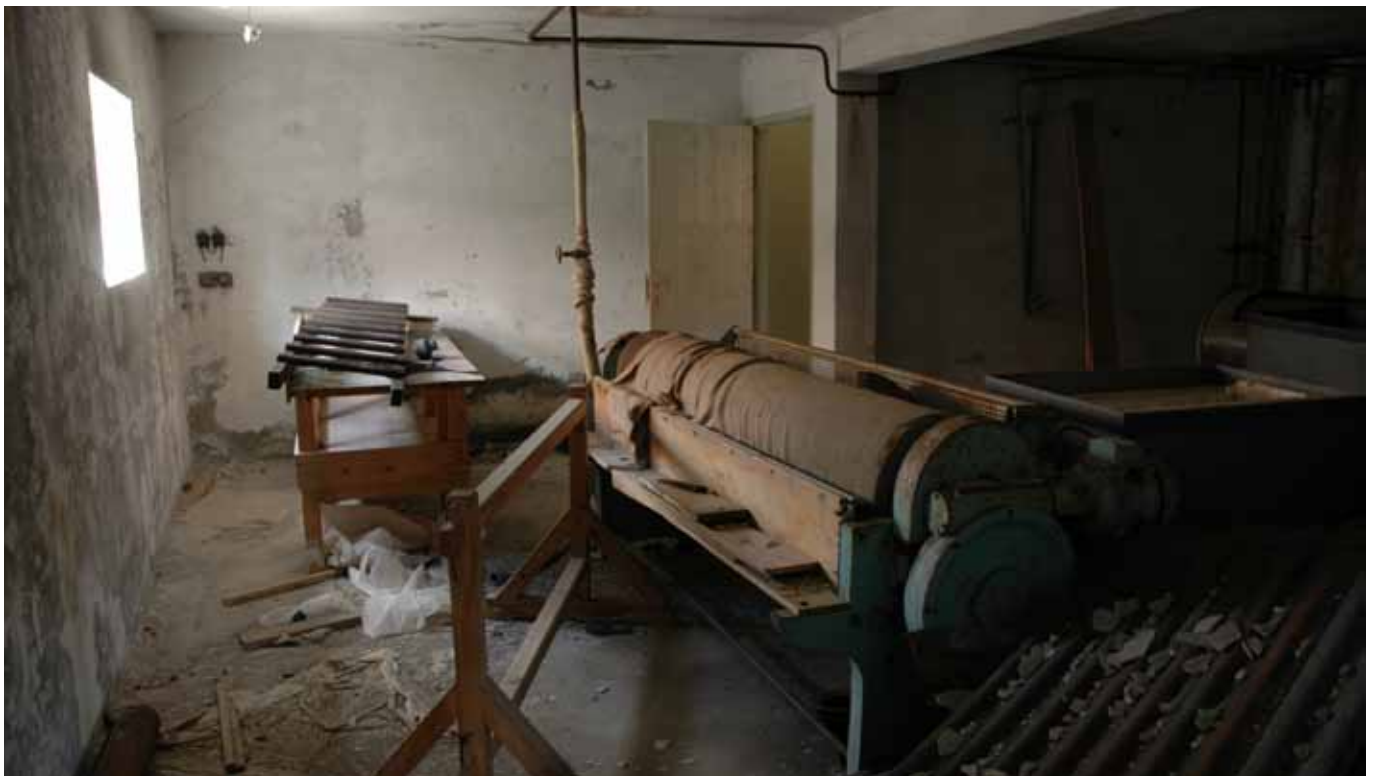
11.3 The storage area over the Slop Chest and Laundry - apparently used by the Army/Navy as a dormitory area