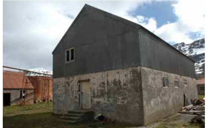
11.1 South and east elevations

This rectangular building contains the Slop Chest on the south end of the ground floor with first floor storage. The centre of the ground floor is the laundry with the north end being a drying room. The construction is of mass concrete walls up to first floor level, with ground and first floors of concrete, the ground floor being raised four steps above the ground level. The concrete upper floor is supported centrally on a concrete beam and columns. The first floor walls and the roof are timber framed with corrugated iron covering with no internal lining. The ground floor has an entrance door on the south end and timber casement windows, though some of these are missing and all are damaged. On the first floor there are only windows in the gable ends, otherwise the space is lit by plastic roof lights. The general condition of the exterior cladding is reasonable at present.