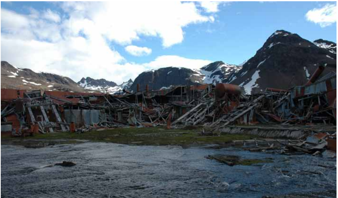
1.3 Looking across the Plan towards the Bone Cookery and showing the stream now running across the area