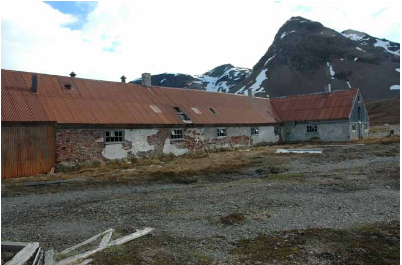
25.1 The north elevation