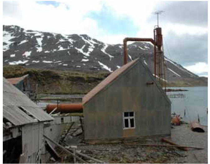
4.1 The south elevation

Outside to the east of the building is a steel mast supporting a flue with what appears to be a condensation chamber at its top.