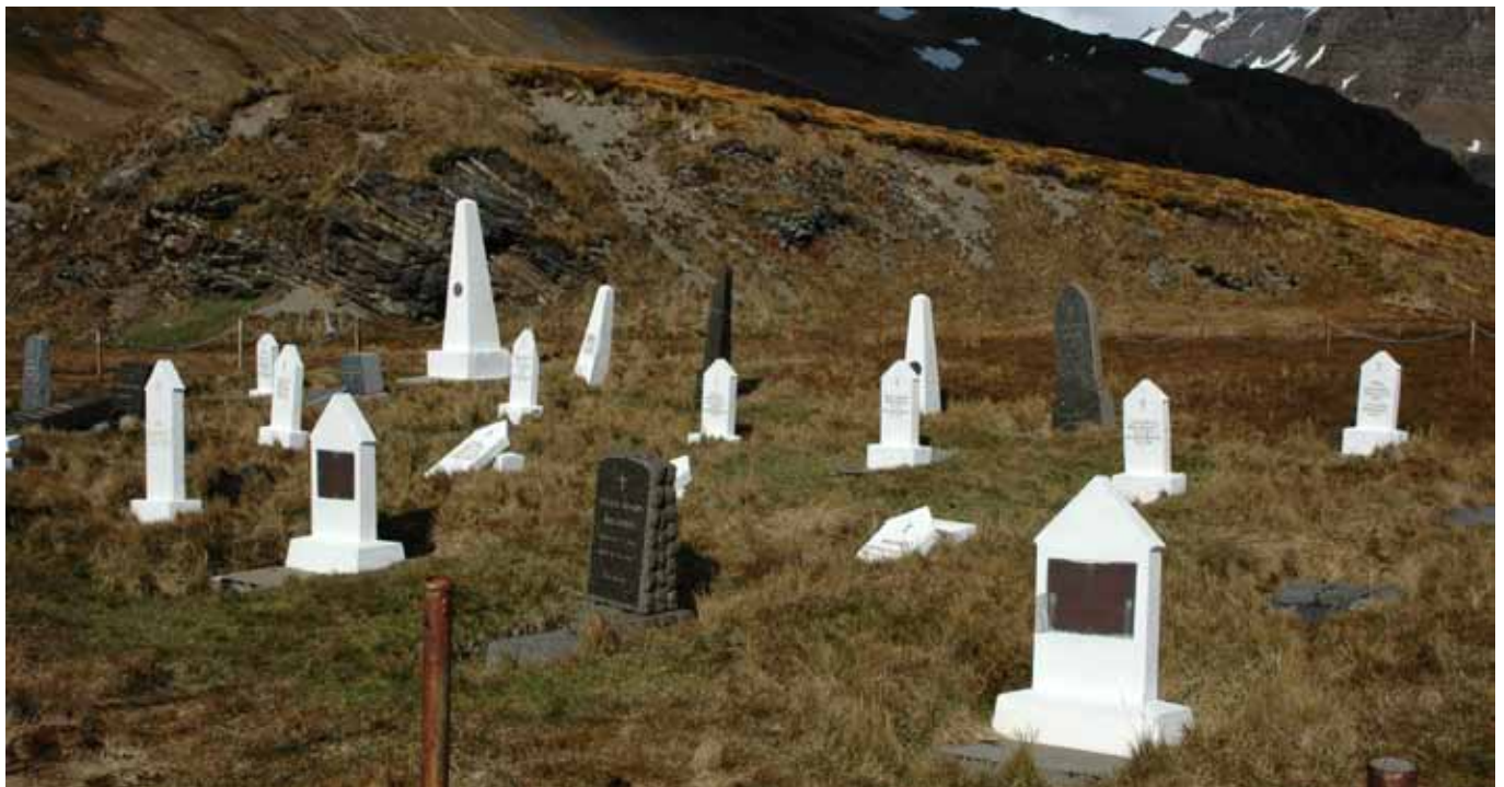
78.2 General view of the Cemetery