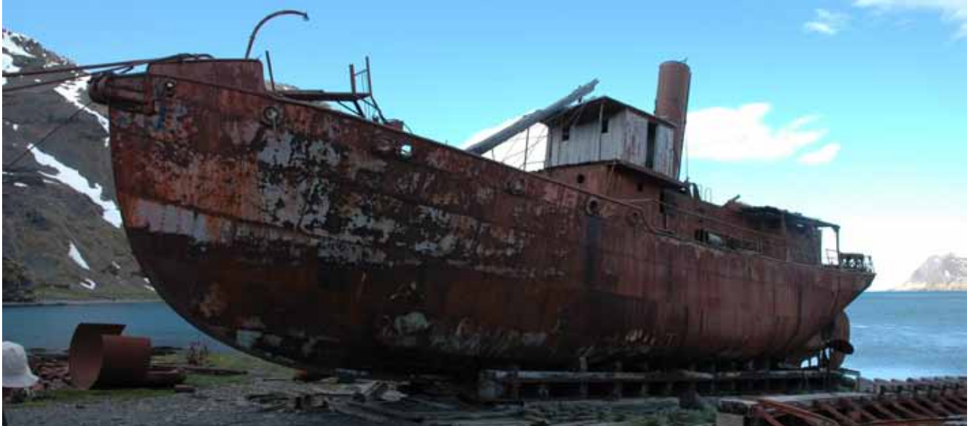
72.1 South side of Karrakatta