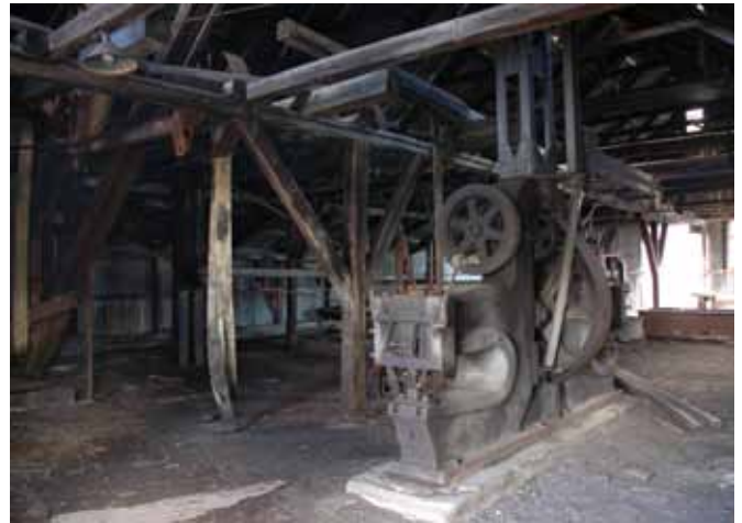
75.1 The interior looking northwards

A simple timber framed workshop with a large opening on the east side facing the sea, at times the whole of the east front appears to have been open but currently over half is blocked. There are two forges in the building, one large and one small, with their flues still in place. Various bits of machinery are still in place, anvil (or perhaps more properly a forging floor - a heavy cast iron raised flat floor with regular holes), bending machine, drill and hole punch. There are the remains of a pulley and axle system in the roof for driving the machinery. The timber framed and corrugated iron clad walls are built off a rough local stone plinth. The building has been widened with a lean-to along the whole line of the west wall. The framing of the building seems to be slender for a building of this size - but it remains serviceable and could be repaired.