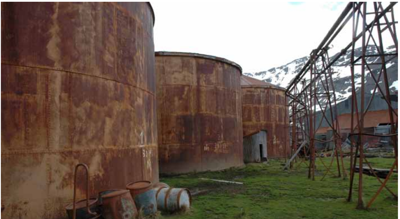
38.2 The east side of the main row of Tanks looking northwards