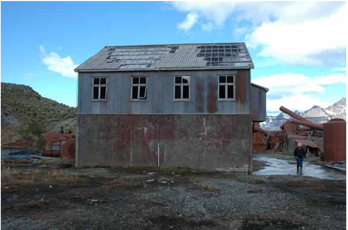
26.1 The west elevation

This building has rendered masonry walls up to the first floor level and then a timber frame clad in corrugated iron above. The timber framed roof is covered in corrugated asbestos which is now badly damaged with perhaps 50% missing. The upper floor is reached by an external stair on the south end of the building and the barrack rooms are lit by casement windows, four to the east and four to the west. The solid ground floor is reached up steps and a door on the east side. The ground floor is full of polystyrene blocks and could not be inspected.