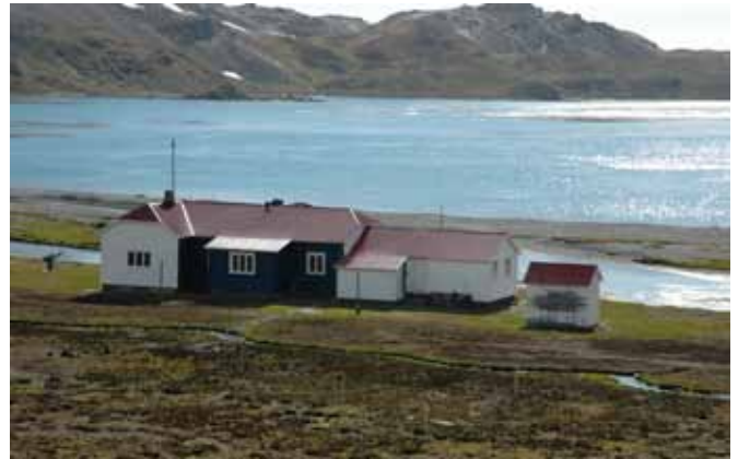
64.3 The west elevation