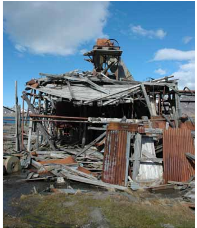
3.1 The west end

The interior of the building was not accessed.