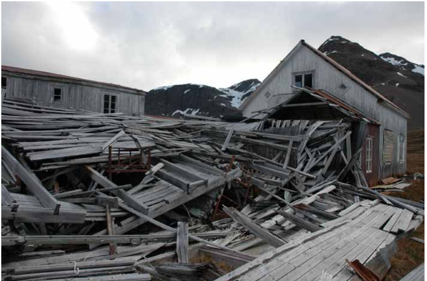
19.2 The north side of the collapsed building looking west