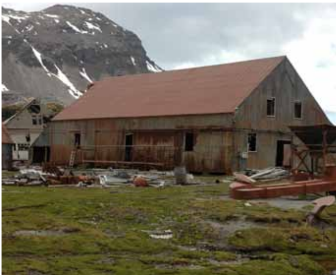
7.4 South and west elevations