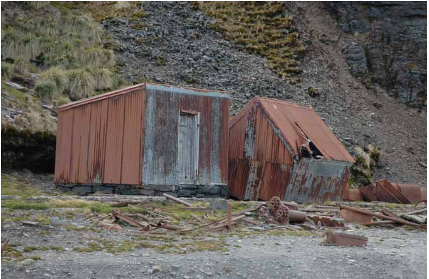
68.2 The southeast side of the buildings, the Gunpowder Store to the left