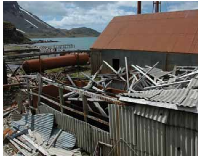
5.1 Collapsed north end

There is a large amount of asbestos cement fragments lying all around the area. There are also a large number of old pipes lying to the north and east of the building many still with asbestos lagging on them. They may have been pulled from the debris of the fallen building.