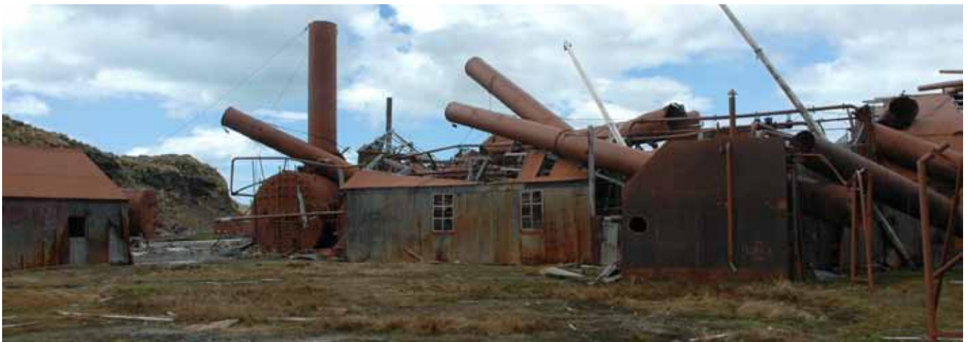
14.3 The north end of the west face