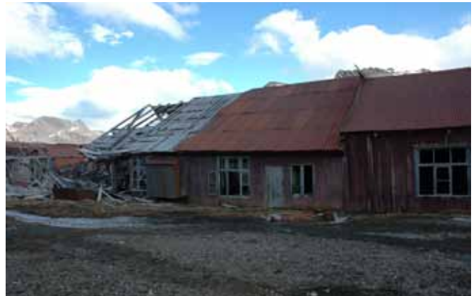
22.1 The north face of the building looking east

The newest section of the building at the west end is in the best condition, this is fully clad in corrugated iron which remains in reasonable order - but this section of the building has also been affected by water running adjacent to the wall. There does not seem to be any realistic prospect of saving this building.