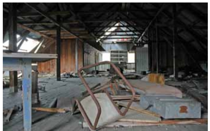
7.3 Interior of the first floor space looking south