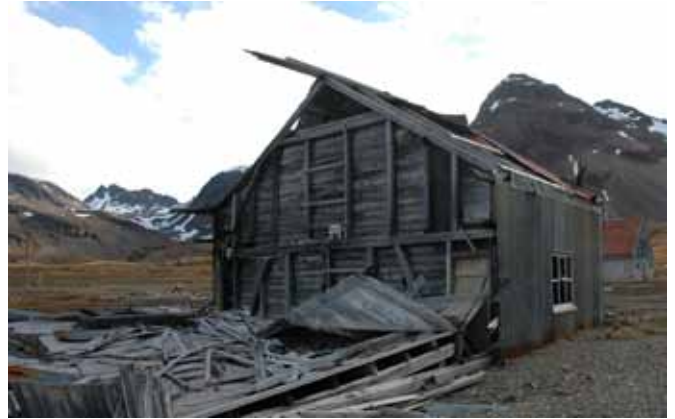
24.2 The north and east faces of the west end