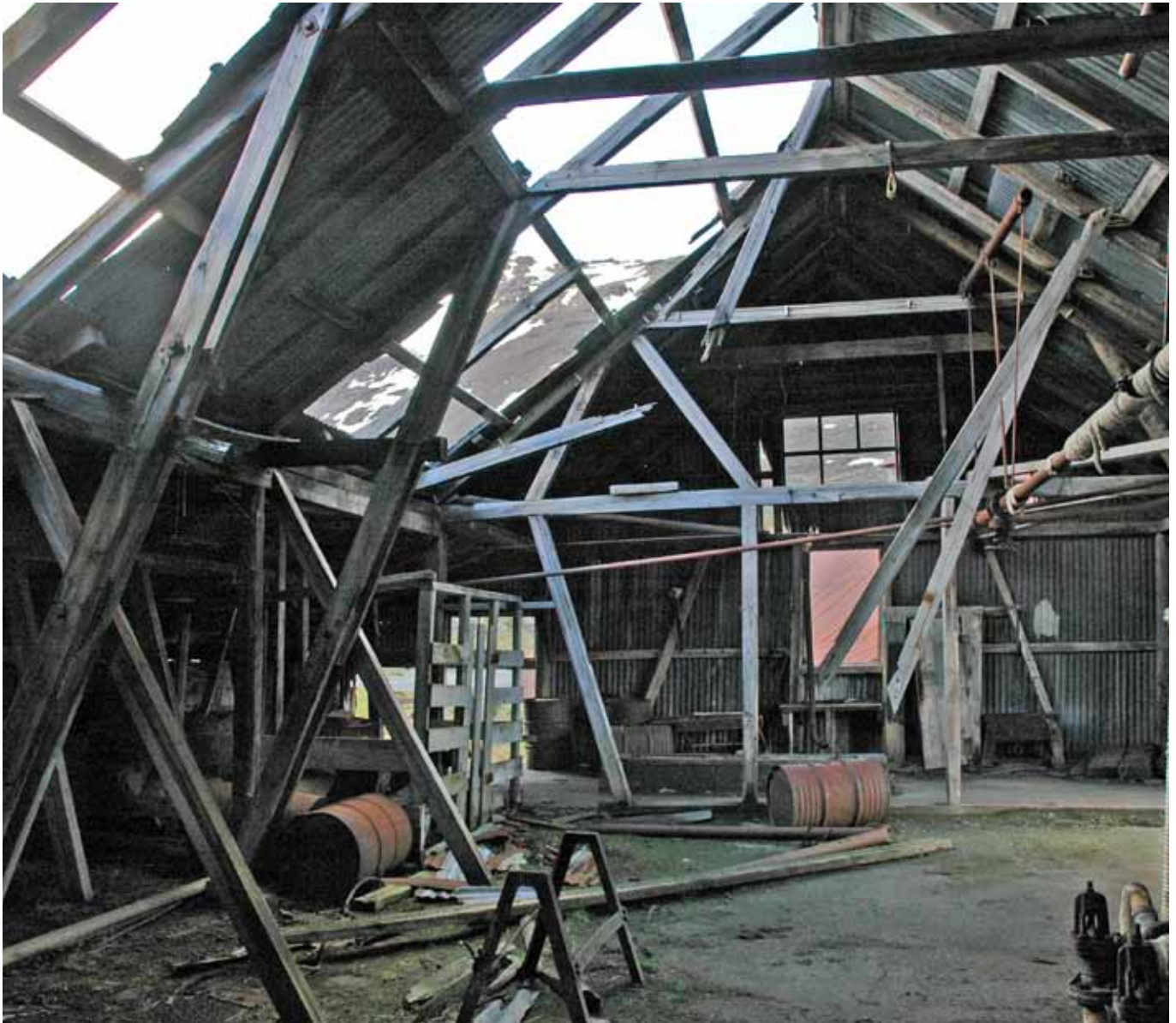
74.2 The Winch House looking southwards