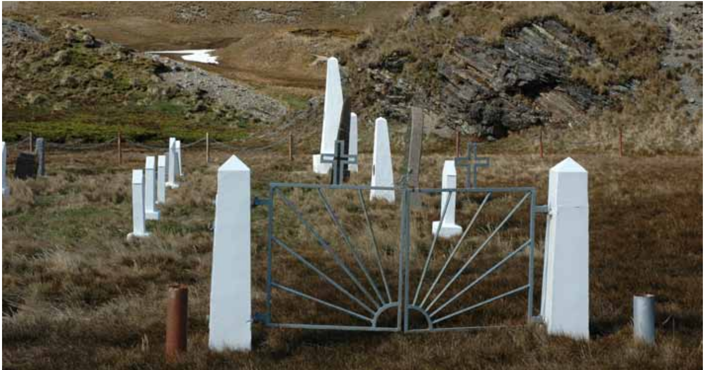
78.1 The Cemetery gates

The cemetery stands to the southwest of the Manager's Villa. There is the remnant of a chain fence slung between steel posts and a pair of steel gates hung on concrete posts. The cemetery was inspected in detail by Pat Lurcock who has maintained it in good order over the last twenty years.