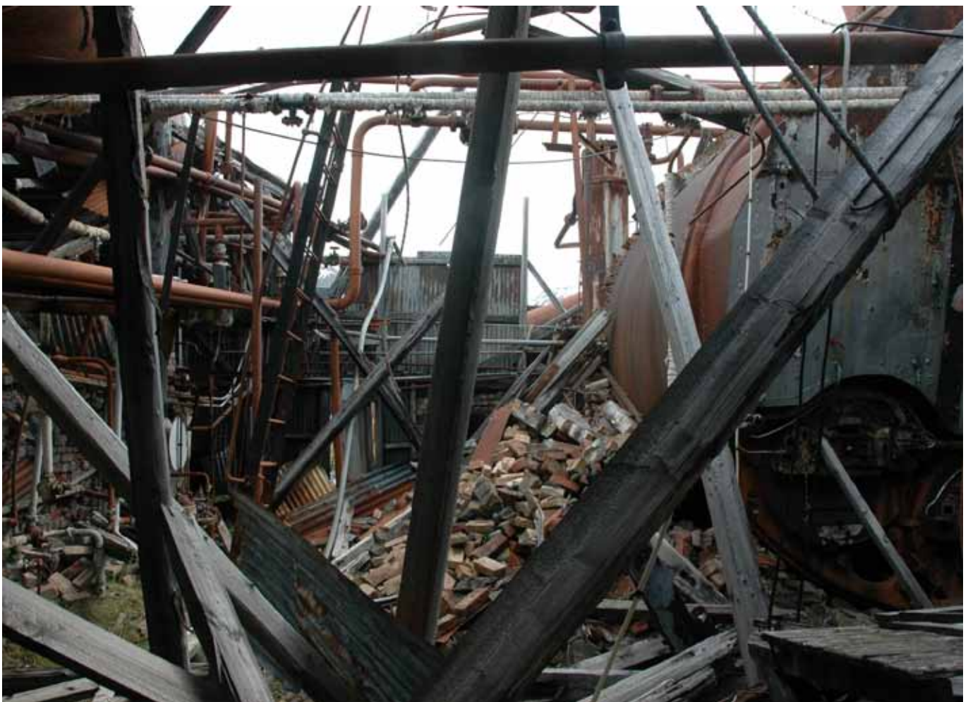
207.1 Looking east into the collapsed Bone Cookery

It seems to be impossible that any of the existing structure can survive this.