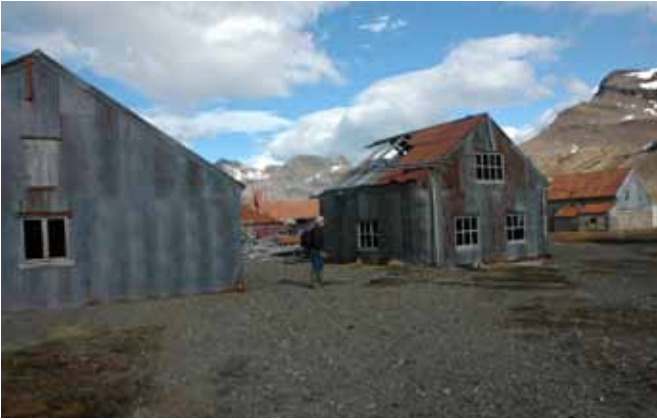
24.1 The standing two storey section at the west end, seen from the northwest

This building has been collapsed for a long time. Only the north end remains standing - the upper floor here may have been the library and reading room. The rest of the building is a heap of timber and corrugated iron.