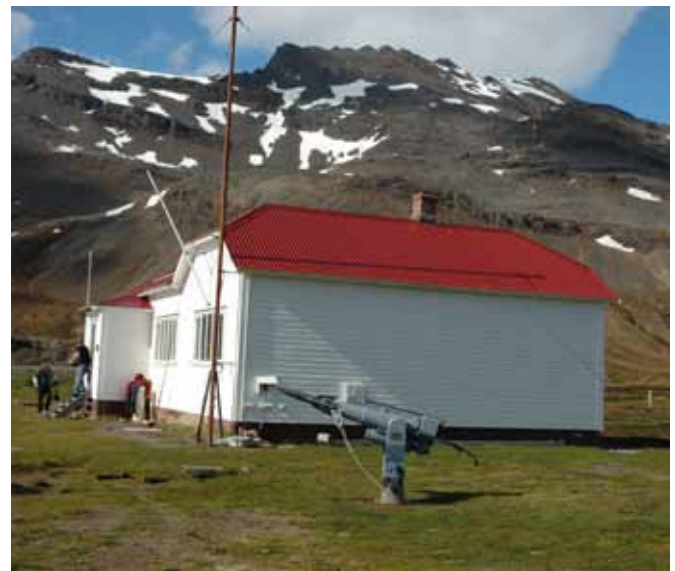
64.4 The north elevation