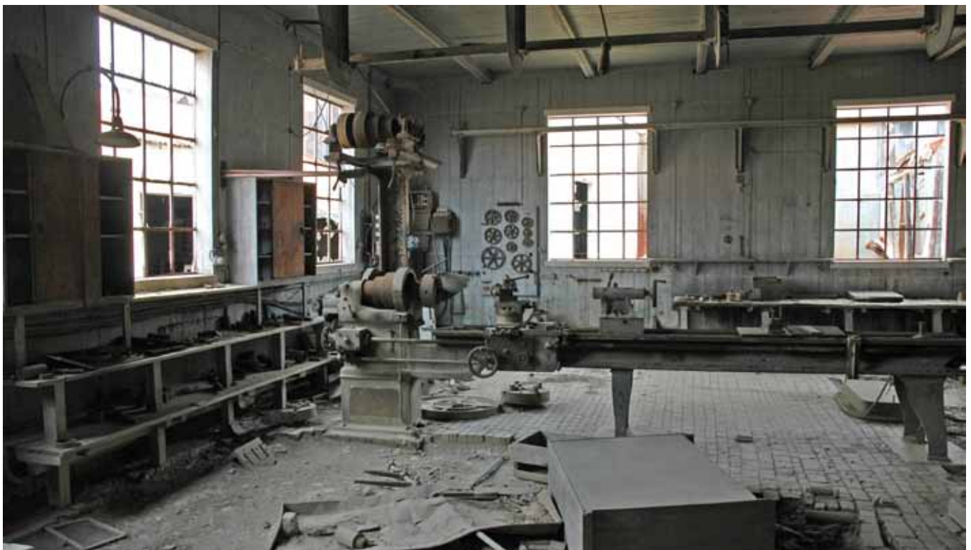
8.3 Southwest corner of the main Workshop