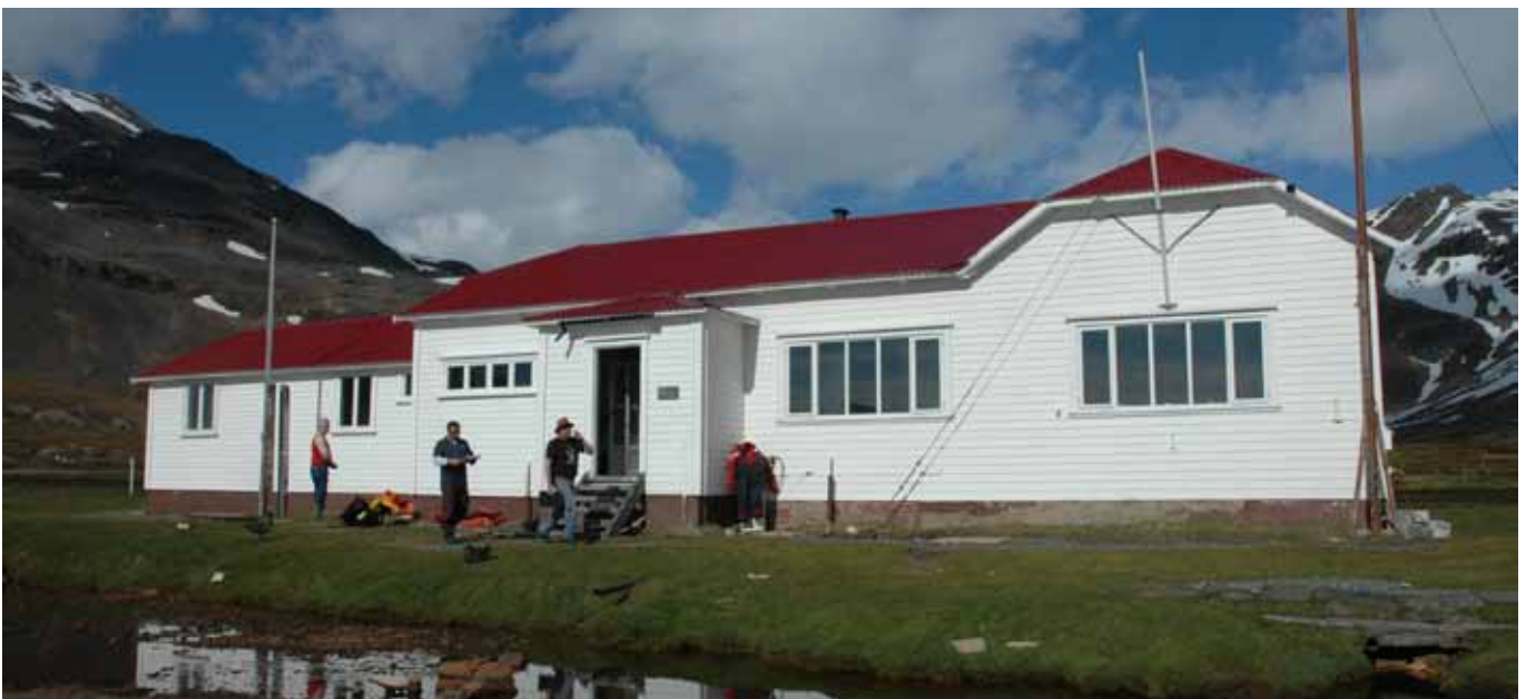
64.2 The main front - east elevation