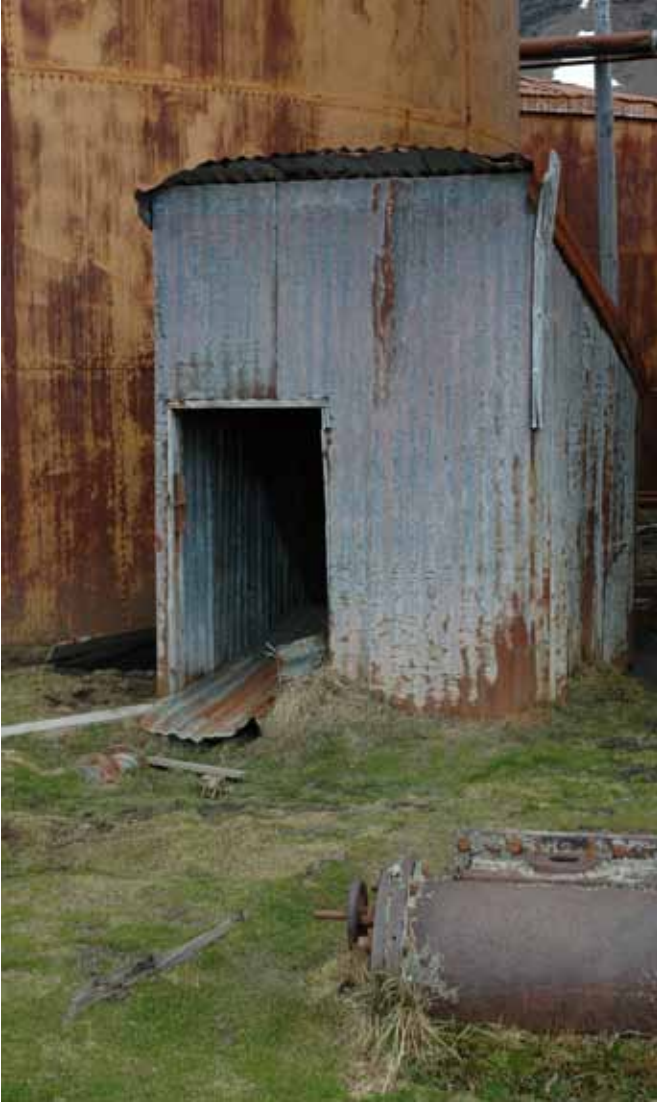
60.1 The east front of the Store

A small corrugated iron lean-to shed clad externally and internally in corrugated iron. The door is missing.