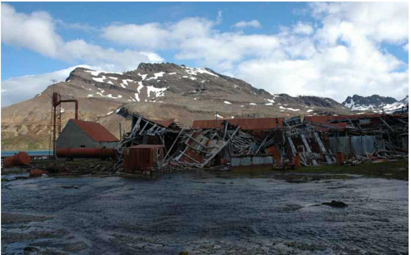
203.1 General view of the Meat Cookery north side

To the south of the main meat cookery area the building has been extended to the south with a lean-to to accommodate a further row of cookers. This lean to has also collapsed.