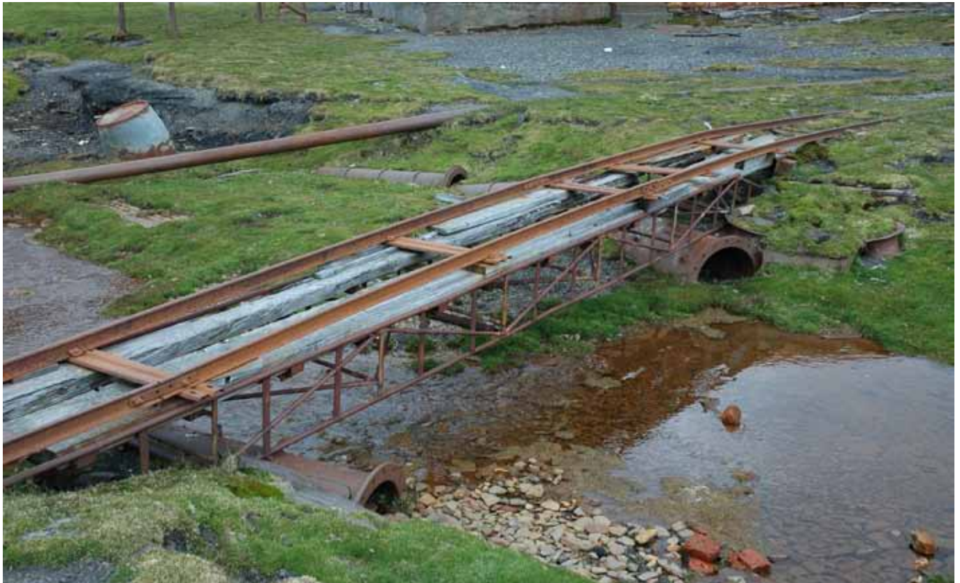
33.3 Bridge over the stream between Buildings No. 10 and 7