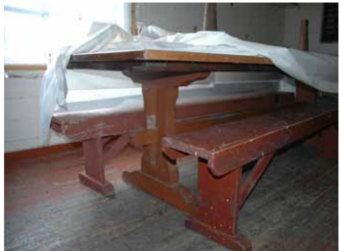
51.4 Surviving furniture