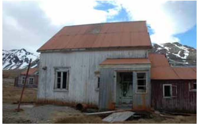
19.1 The south elevation of the west end of the building

The majority of this building has collapsed with only the two storey west end remaining substantially standing. This is built from vertical timber boarding over thick horizontal boarding as the primary structure. There has been a first floor partially in the roof space with windows in the gable ends. The ground floor has windows on the north, west and south sides with timber side hung casement windows, with both internal and external sashes. The entrance door is on the south side through a small porch. There has clearly been a good deal of water running through this building and the whole of the suspended ground floor timbers have rotted away and fallen into the void beneath which now has standing water in it. The corrugated iron roof is in reasonable order but the capping pieces to the bargeboards need attention. Unusually this building has had a gutter fitted though only a small section of this still remains.