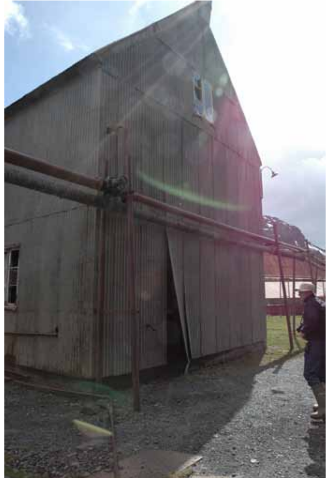
12.2 South elevation