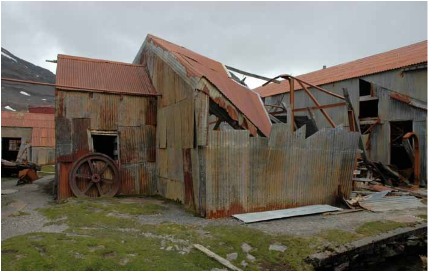
203.2 North and east sides of the Brick Store with the Guano Store in the background to the west