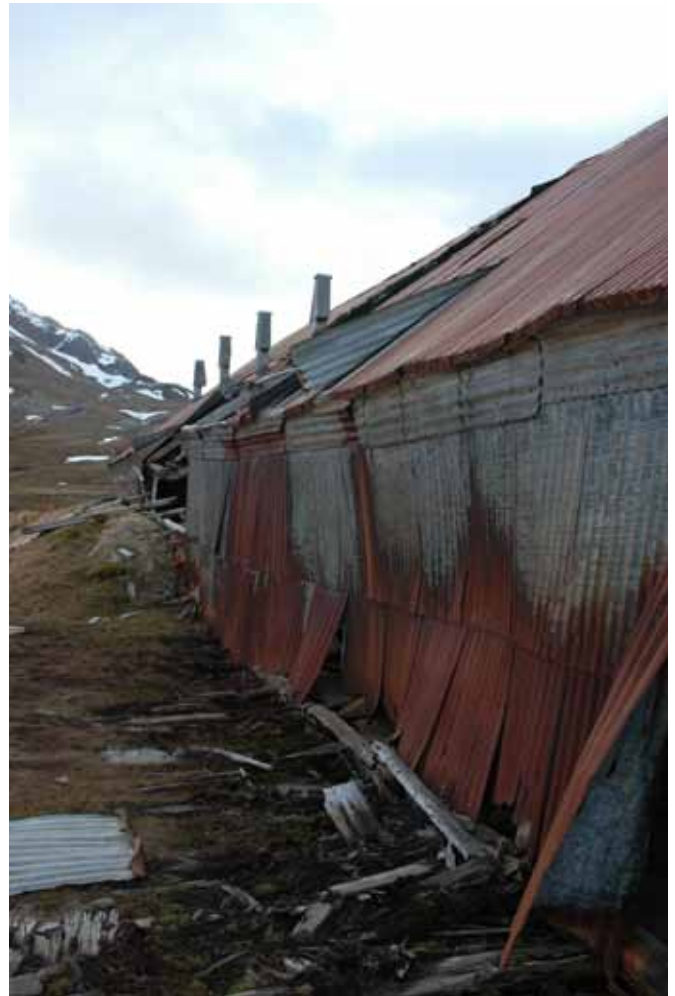
16.1 Exterior of south wall looking west