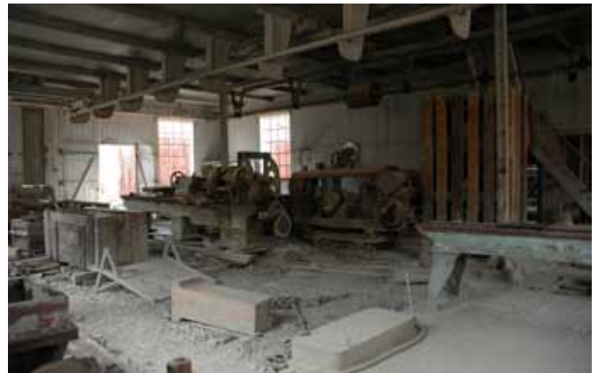
8.2 Interior of main Workshop looking north