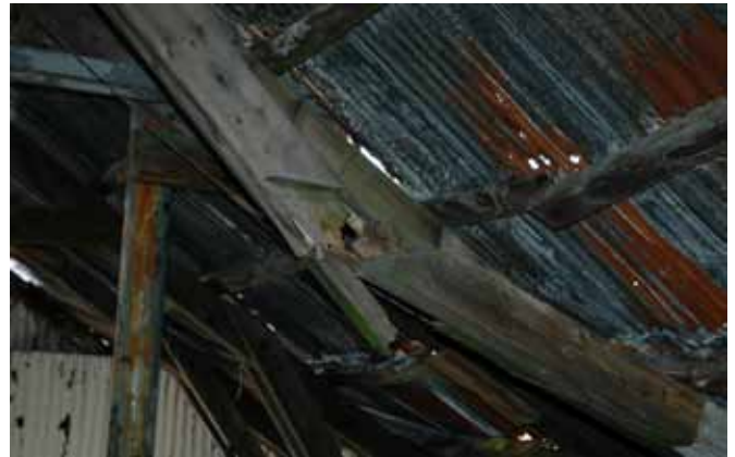
2.1 Fractured roof timber over the area

The area to the east of the main part of the meat cookery has been used as an area for extraction plant. A heavy concrete frame has been inserted into the area to provide a solid concrete deck at high level where the extractors are mounted. This has then been extended with a section of timber flooring supported on timber framing. To accommodate the extractors and to create a working area the roof has been modified with a raised section to the west. The roof generally through this area is very poor and one principal rafter has shattered through and collapsed and its neighbour is also fractured. Water has been pouring through this section of the roof and the timber floor at high level and the supporting timbers are all heavily affected with wet rot. This whole area is now in very poor order.