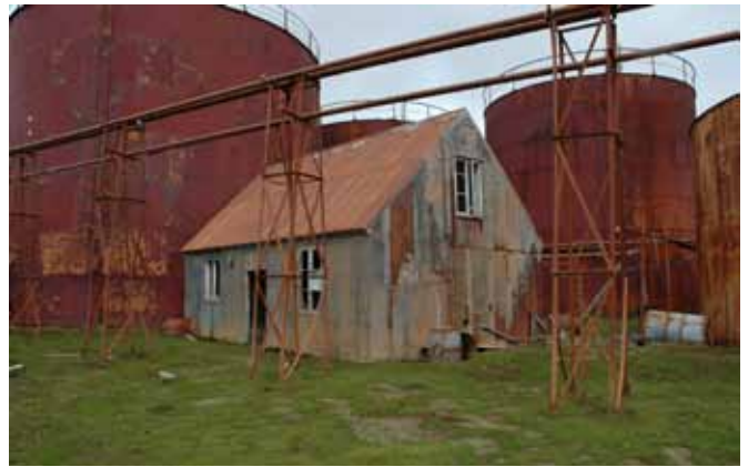
13.2 North and east elevation