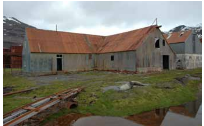
10.2 North and east elevations

There is a timber framed lean-to running the full length of the south side of the building with a low timber framed wall supporting the rafters of a mono-pitch roof with a wall plate roughly at the level of the first floor in the main building. Rafters are propped at mid span by timber posts. The main building has a continuous loft space over both store and workshop, accessed by a stair at the east end of the building; this is also racked out with shelving. Main doors were on the north side of the building but these are now missing. This building remains in reasonable shape.