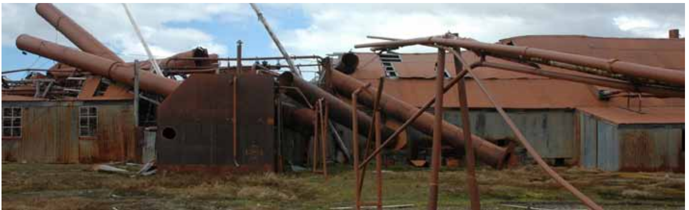
14.4 General view of the south end of the west face of the Boiler House