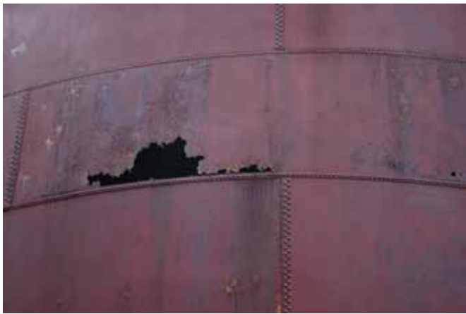
38.3 Detail of Tank 42