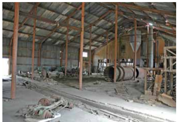
211.3 Boxes for frozen whale meat stored in the southeast wing of the building