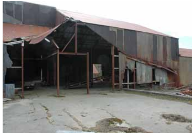
211.1 The scarred south end of the Guano Store where a building has been removed

To the east of the south wing there was a lean-to wire store. This has more or less completely disappeared. All that remains is some rotten timber on the floor and part of the east end wall. The removal or collapse of this building has left an area of damaged sheeting on the main building south wall.