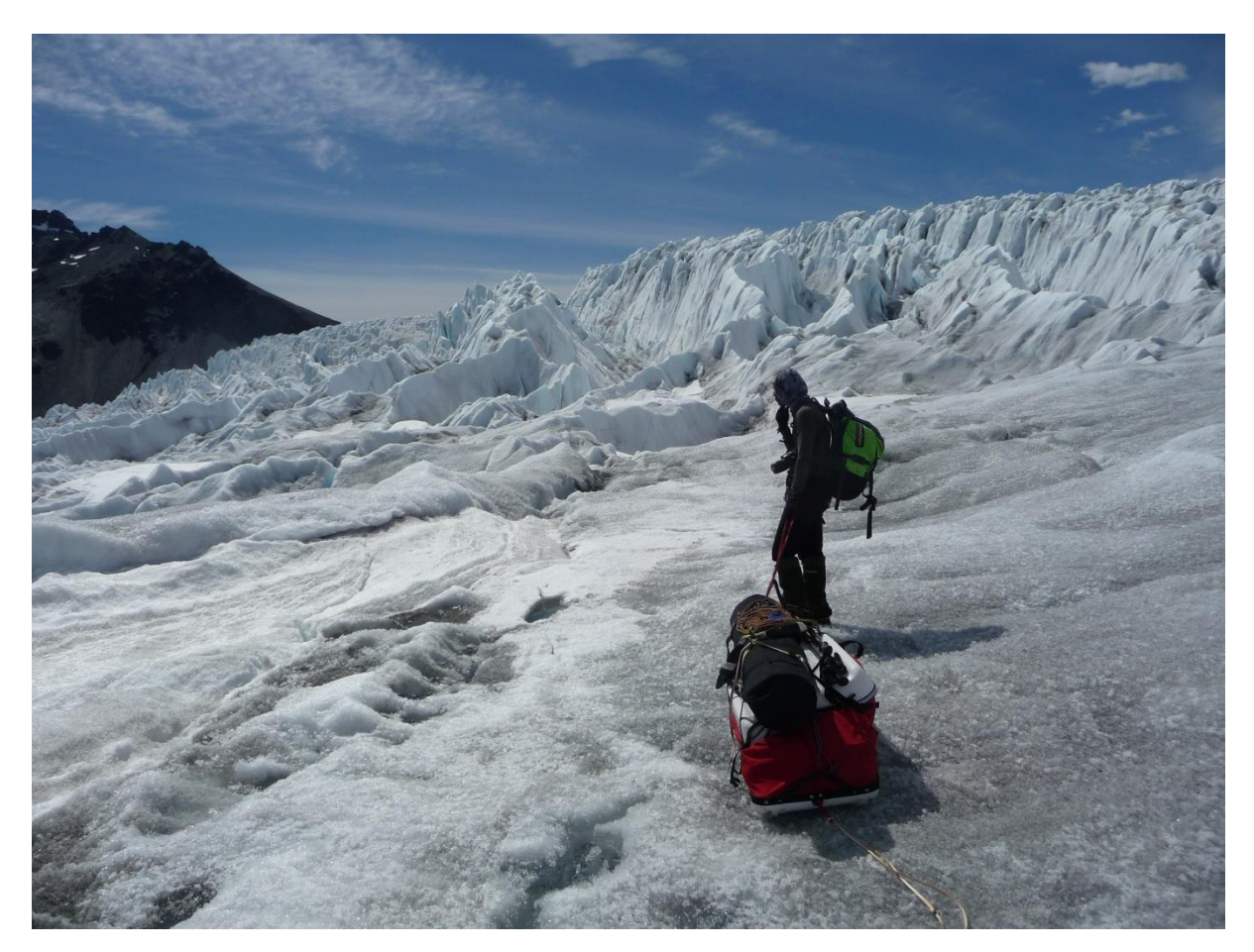
Trying to scout a way through the icefall for the sledges.

Two years ago we had skied from the beach but there was much less snow this year. The first day was spent thinning out our loads to two heavy packs apiece which were carried up to on to the glacier to the point where we could start using the sledges, though not the skis which had to be added to the loads. The next day we commenced our approach proper. The ice fall was nearly completely 'dry' this year. Everything as hard ice with all crevasses visible and open. It became a very torturous and slow process navigating the sledges through the labyrinth.