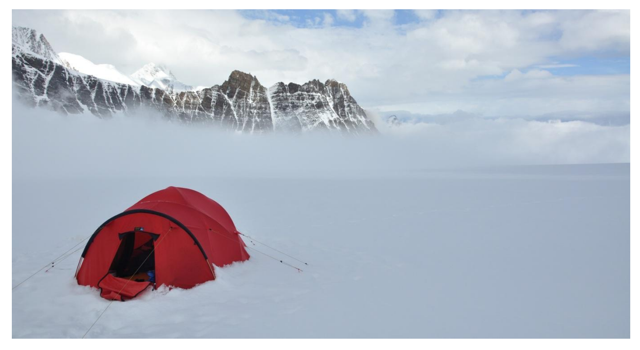
Our top camp, at last.

Next day was my birthday. Laura had packed me a special candle which we ceremoniously placed in a mini Christmas pud. Today was the rest day. We triangulated the various weather forecasts and tomorrow looked to be the day. Timings had worked out well for once.