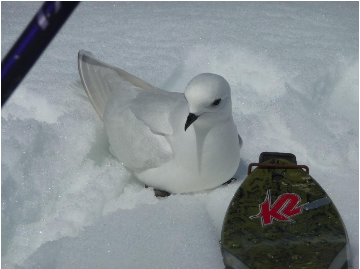
A Snow Petrel comes to nibble at my skis.

a lateral moraine that led to the toe of the ridge extending down northwards from Sheridan Peak. There is then a steep climb, just on the limit of what is possible with skins. This went surprisingly easy compared to last time and we were soon over the lip and on to the third section of the Nordenskjold, a vast broad snow covered valley leading up alongside the western slopes of Sheridan Peak. A truly enormous wind scoop forms a moat adjoining this. It's another sign of the that the ablating glacier is also melting top-down and not just bottom up. We gave the dizzying drop into the wind scoop a very wide birth. Roped up again we marvelled at how skis and sledges crossed crevasse after crevasse without any breaking through, even in hot soft conditions. I knew from previous experience that terrain like this would be murderous if we were only on foot. By early afternoon we were near to our high camp from two years previously. This time we camped out on the glacier flat away from the avalanche danger and snow dumps that had done for us on that occasion.