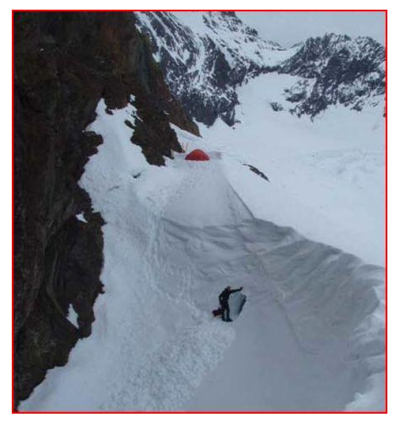
'If you are in a hole, stop digging.' Our Base Camp tent and snow hole during the last attempt.

We joined the Pelagic Australis in Port Stanley in the Falkland Islands for the 800 mile sail east to South Georgia. This would take about four days downwind and a few more on our return. We were aiming to be dropped off at the head of Cumberland Bay east where the Glacier comes into the sea. It should then take us about three days to ski with sledges into the foot of the mountain before we started the technical climbing proper. We aimed to establish our base camp a bit closer to the foot of the mountain than on the previous attempt but away from any avalanche danger which forced a retreat on that occasion when both our tent and snow cave became threatened after heavy snowfall in a prolonged storm (see below).