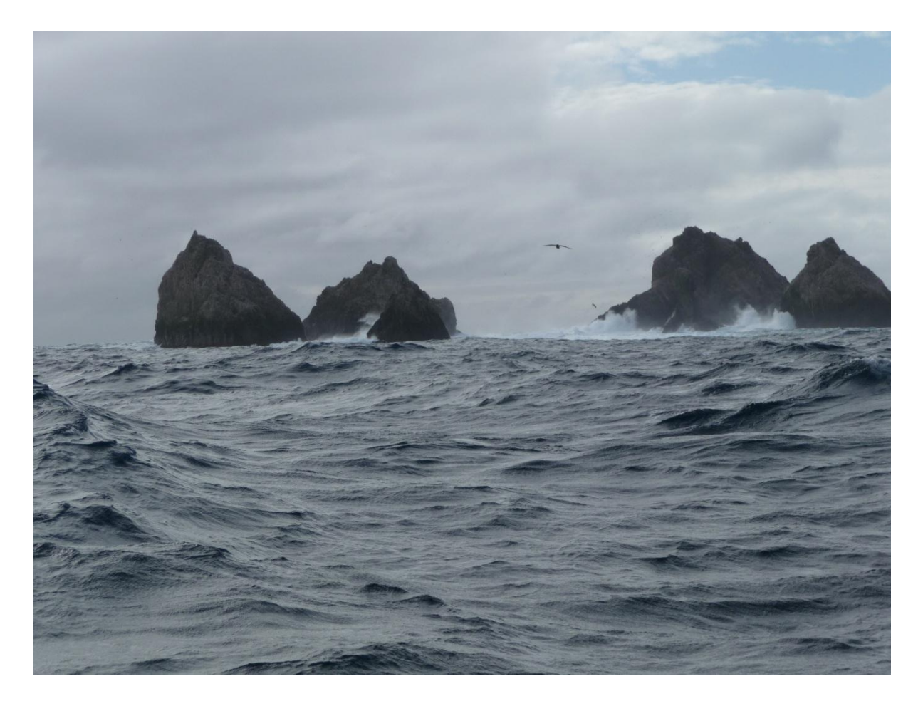
Sailing through the middle of the magnificent Shag Rocks on our previous voyage.