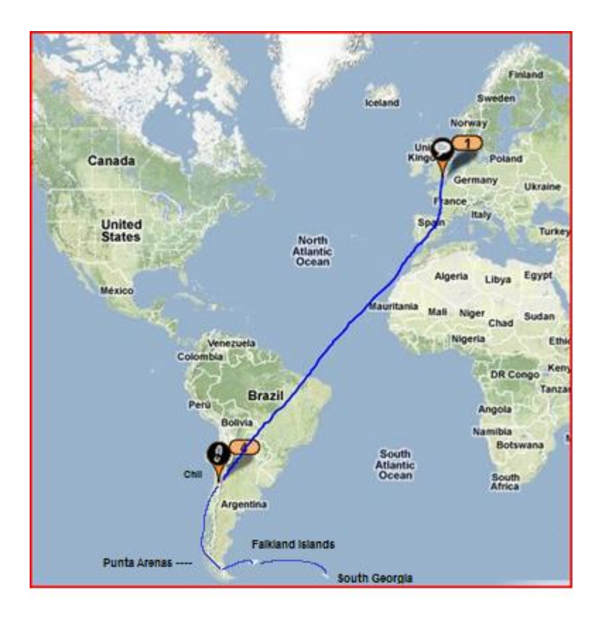
The Journey Out: UK, Madrid, Santiago, Punta Arenas, Port Stanley – Falkland Islands, Nordenskjold Glacier Front - South Georgia.