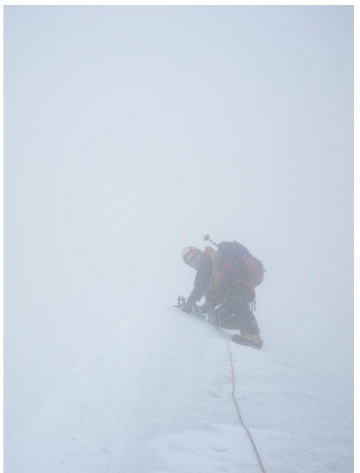
Surreal progress on the very crest except you can't see it.