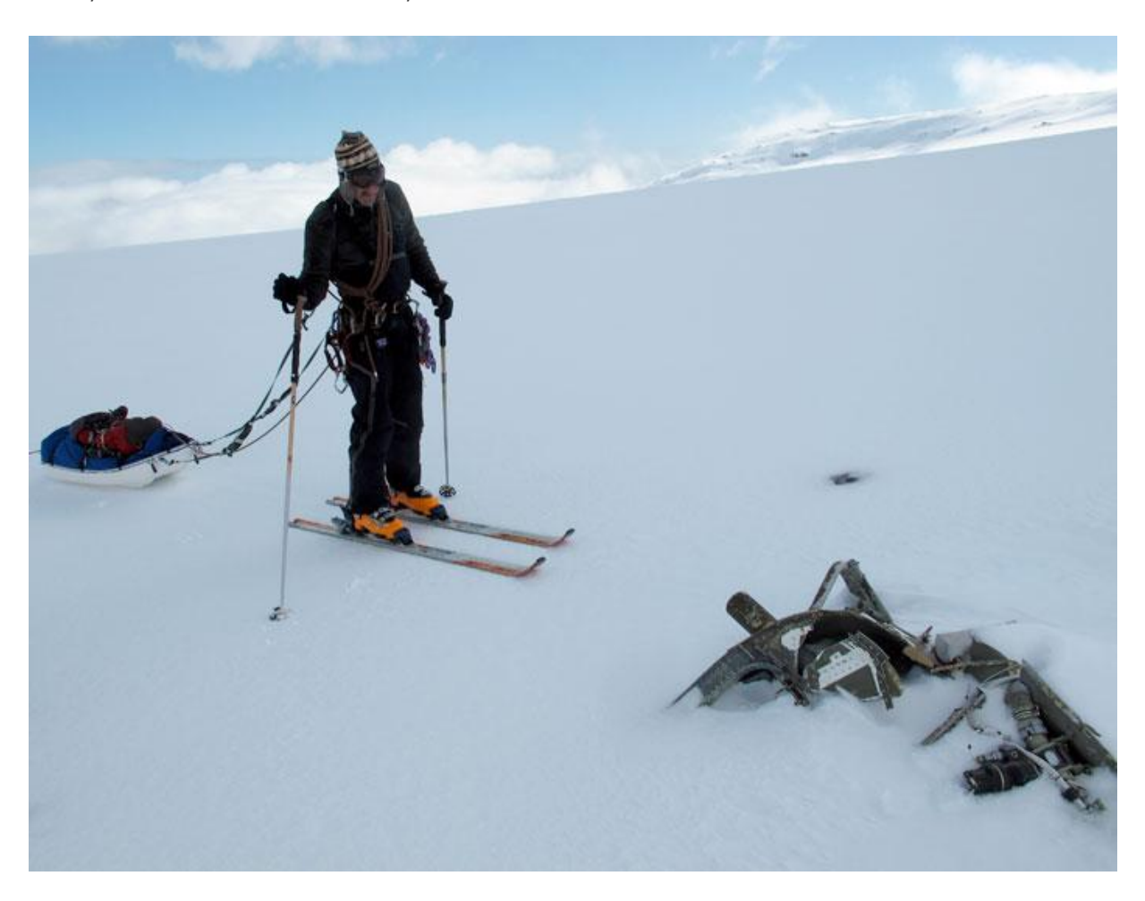
Wessex helicopter wreckage on the Crean Glacier

In good conditions we carried on due east, steering for Shackleton's big nunatak that marks the route, for another three hours, but we had had enough by 1700 and camped in the middle of the Crean in an exposed position. This was about two kilometers short of the crashed helicopter's GPS position (Operation Paraquat, 1982 Falklands War). It was interesting that cracks were beginning to appear in the crevassed section of the Crean above Antarctic Bay, and the fact that the next day we actually found the crash site, with a meter of wreckage above the snow, indicating that not much base had accumulated during the past winter. In four crossings this is the first time I had seen the wreck. In 2006, as late as mid November, it had not been visible.