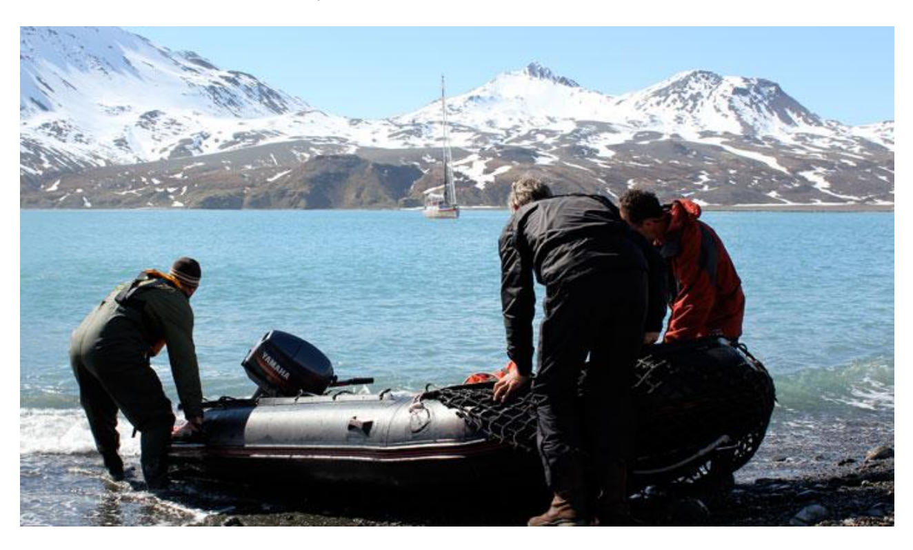
We were picked up by Pelagic Australis at 1400 – it was shower time!!