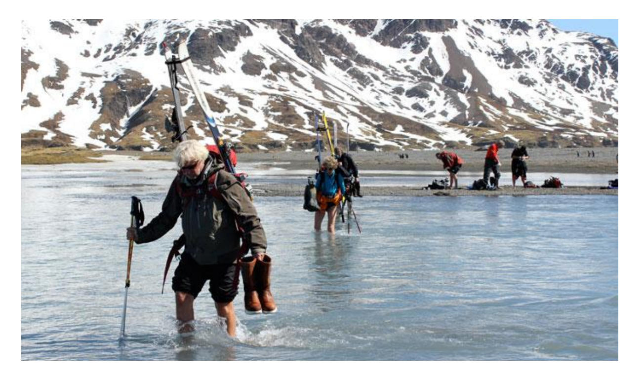
Wading the the stream

Pelagic Australis left Grytviken at first light on the 21st and by 0900 she was jogging off the beach to take the camping gear off us, after an enjoyable morning's drying out session.