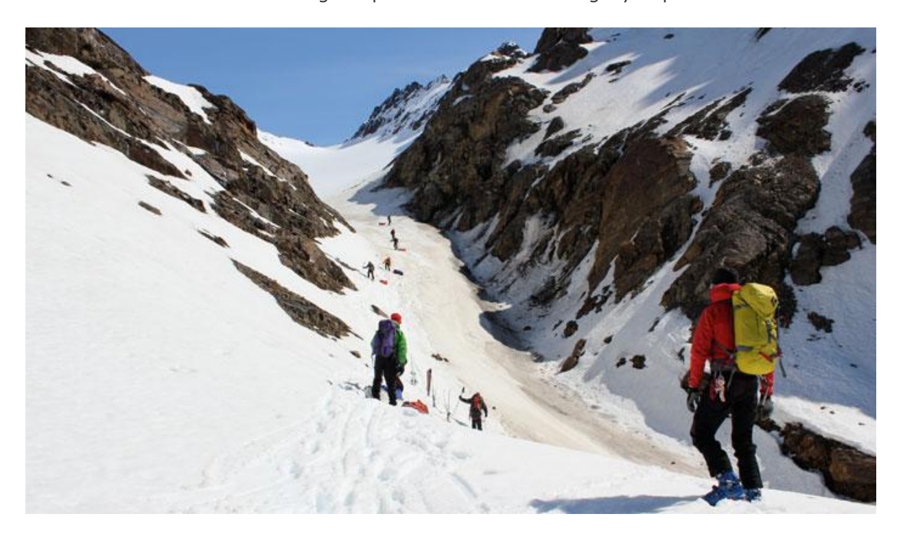
Down the gully

The conditions, although fresh and breezy, were superb with clear views down to Fortuna and across to Stromness, the white snow imprint of the 'Z' on the otherwise bare rock buttress clearly visible on the far side of the bay – another Shackleton landmark. Spring snow on a firm base made skiing the pulks down to the final gully a quick affair.