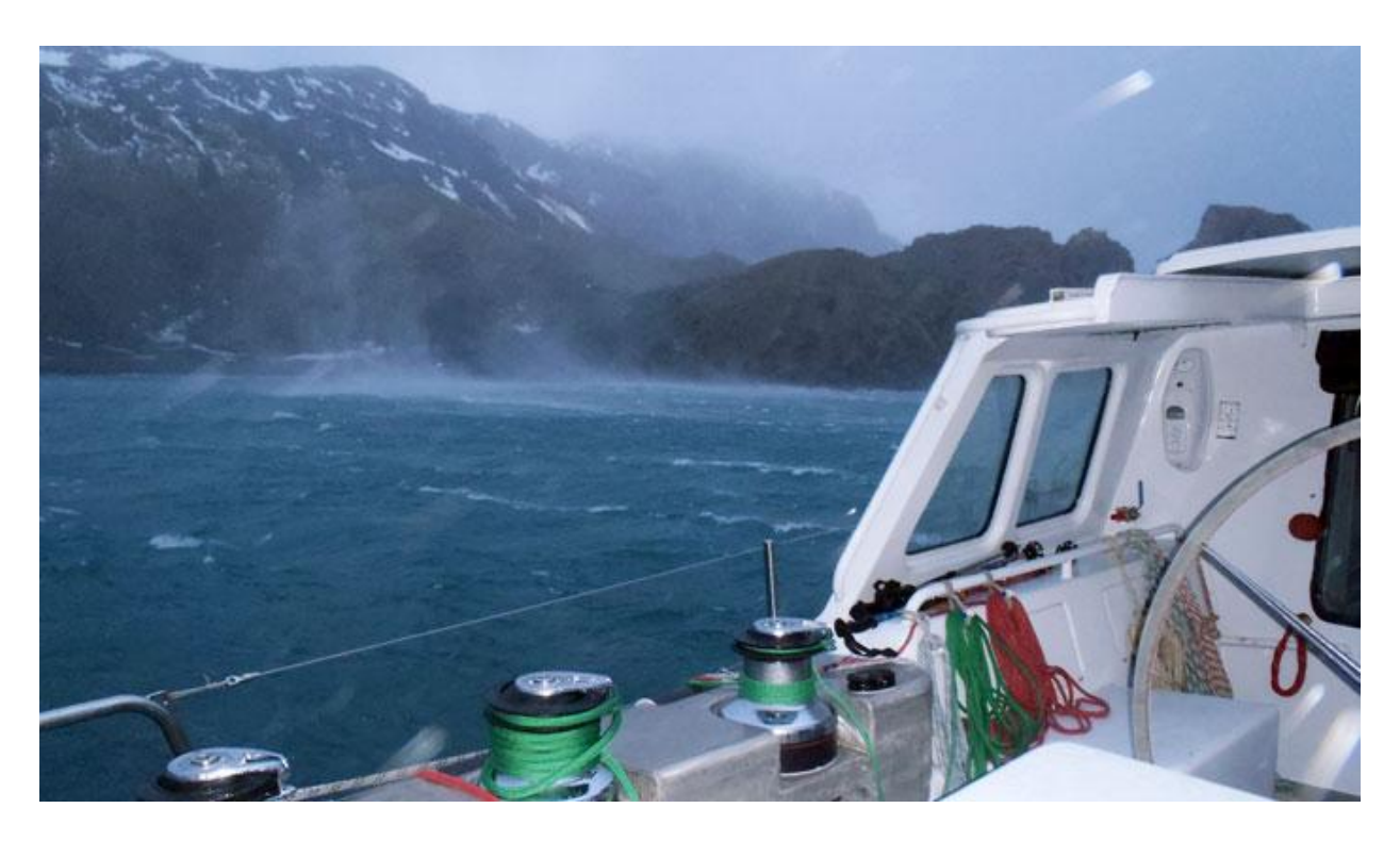
Williwaw blows through Elsehul while we wait for the weather window

Strong williwaws in Elsehul were dramatic and kept everyone's interest and curiosity up in view of the days to come in the mountains. We eventually slid around to King Haakon Bay on the 15th of October in a dying westerly. It was a glorious sail with all the high ground in view, and our enthusiams soared. A heavy swell was still running into the bay – too rough to attempt a landing at Cape Cove safely so we proceeded down the fjord and anchored behind the islets near the head of the bay. That afternoon, after the usual fiddling about with kit, we discharged all our heavy gear on shore at the snow line which was only a five minute walk off the beach. Next morning we got away smartly at 0630, but the benign weather forecast of calm conditions, at the worst variable 5 to 10 knots, became immediately suspect once up on the Murray Glacier as we struggled with strong crosswind knockdown gusts.