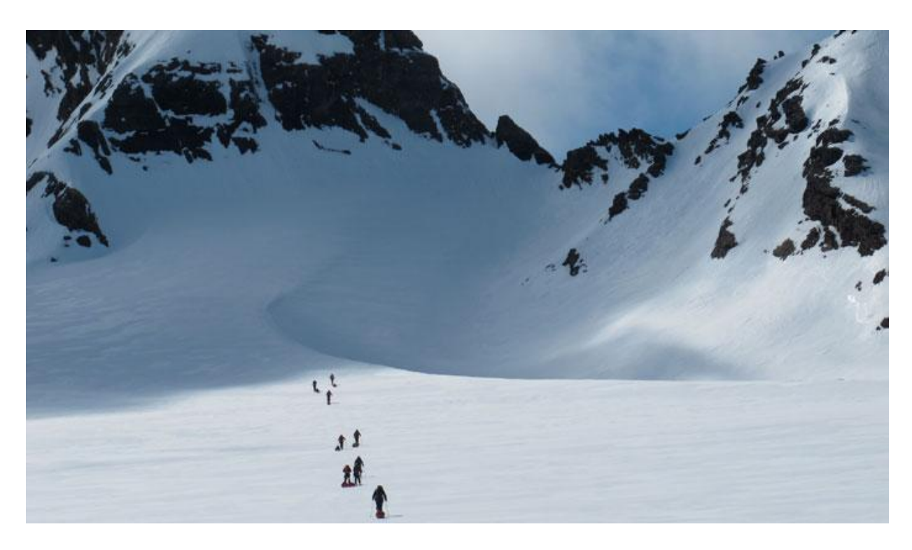
Up to Breakwind Gap

The conditions, although fresh and breezy, were superb with clear views down to Fortuna and across to Stromness, the white snow imprint of the 'Z' on the otherwise bare rock buttress clearly visible on the far side of the bay – another Shackleton landmark. Spring snow on a firm base made skiing the pulks down to the final gully a quick affair.