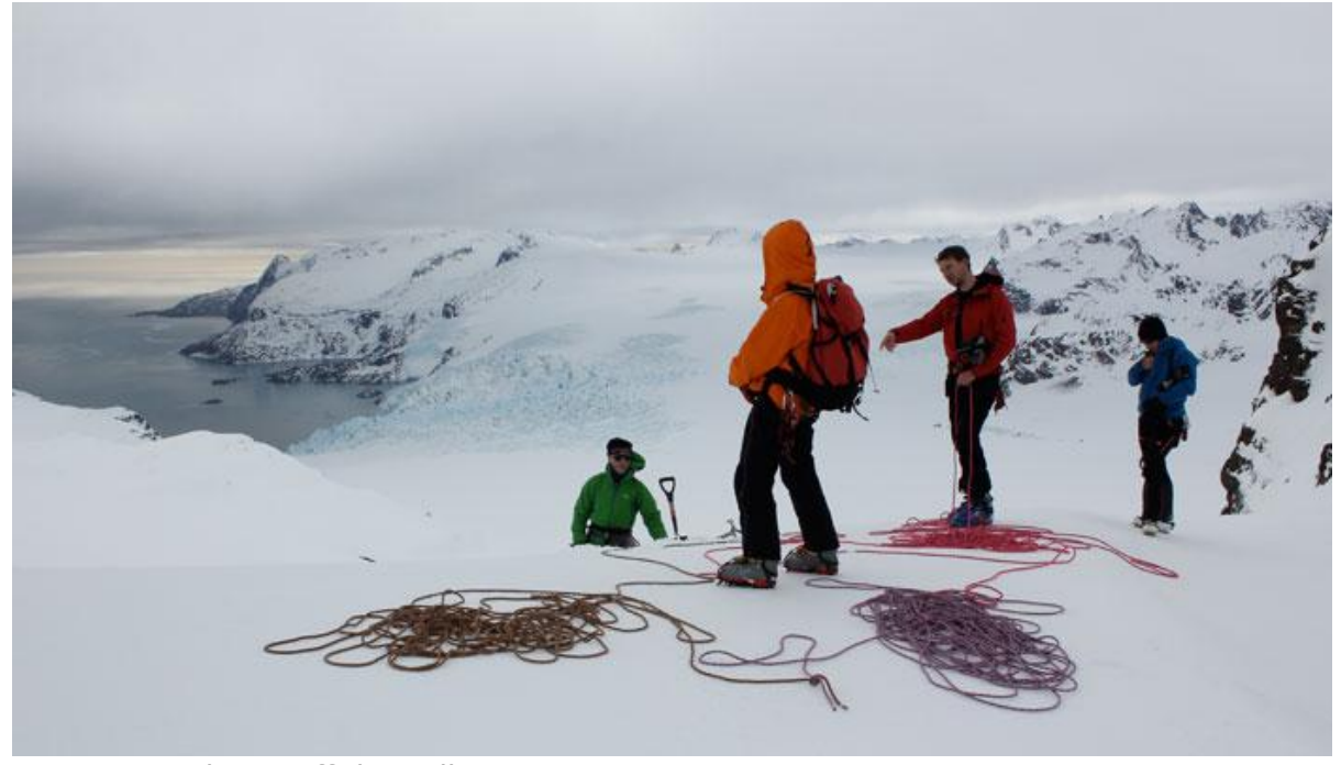
Preparing to lower off the pulks

Luckily, the next day dawned relatively calm for the critical 'lower off' from the Trident. In spite of having no technical hang-ups, it took 7 hours to lower off the ten pulks in three stages of 180 meters and get everyone down on a rope (in 2009 we had a pulk down a crevasse on the first stage) safely to the flat on the Crean Glacier. This was an eye opener as in 2009 when we had only seven people it took five hours. The axiom that speed in mountain travel is safe, certainly makes the case for smaller the party the better.