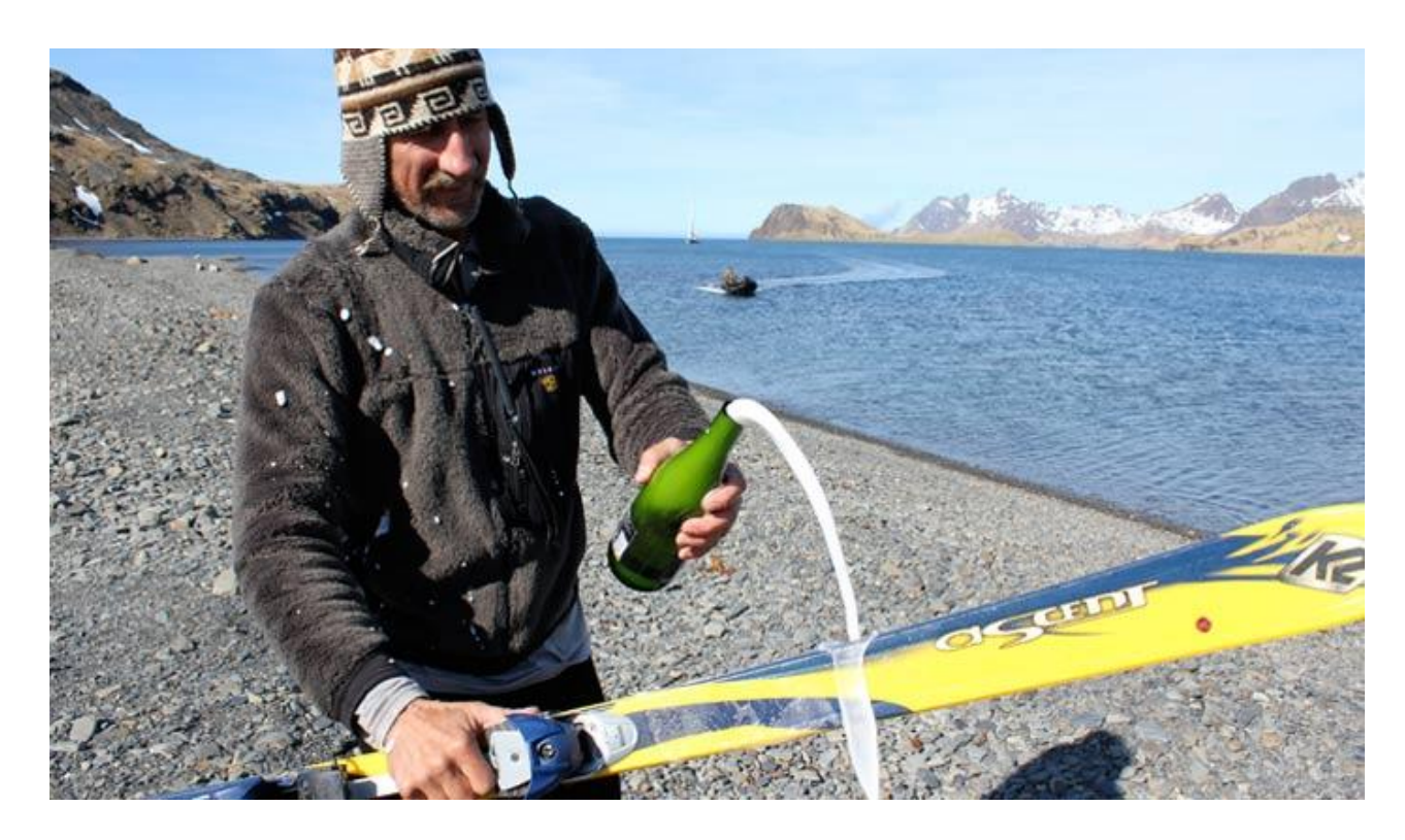
Skip cracks a celebration bottle