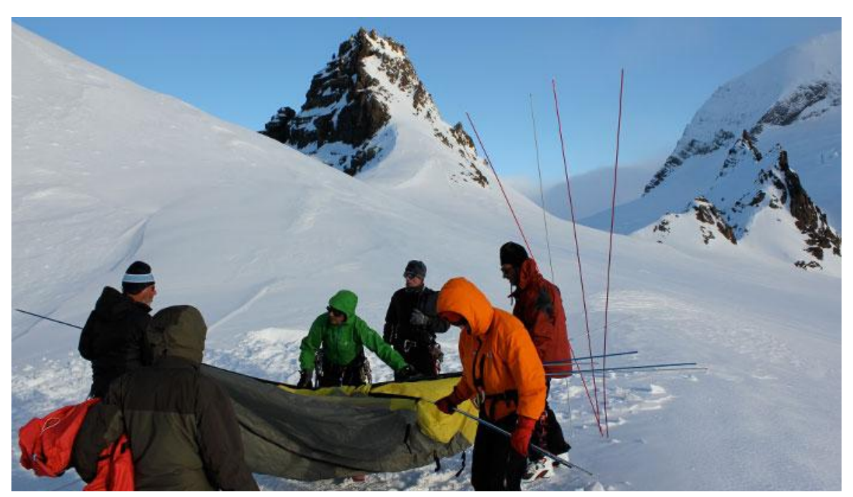
Setting up camp short of the Trident

Visibility at times was nil due to a combination of spindrift and cloud, and even a rest stop was largely an unpleasant experience of a rapid cooling off while fumbling in mittens with thermoses and water bottles. We finally arrived at the Trident Ridge at 1630, a long day out due to the somewhat tough travelling conditions, everyone sufficiently knackered.