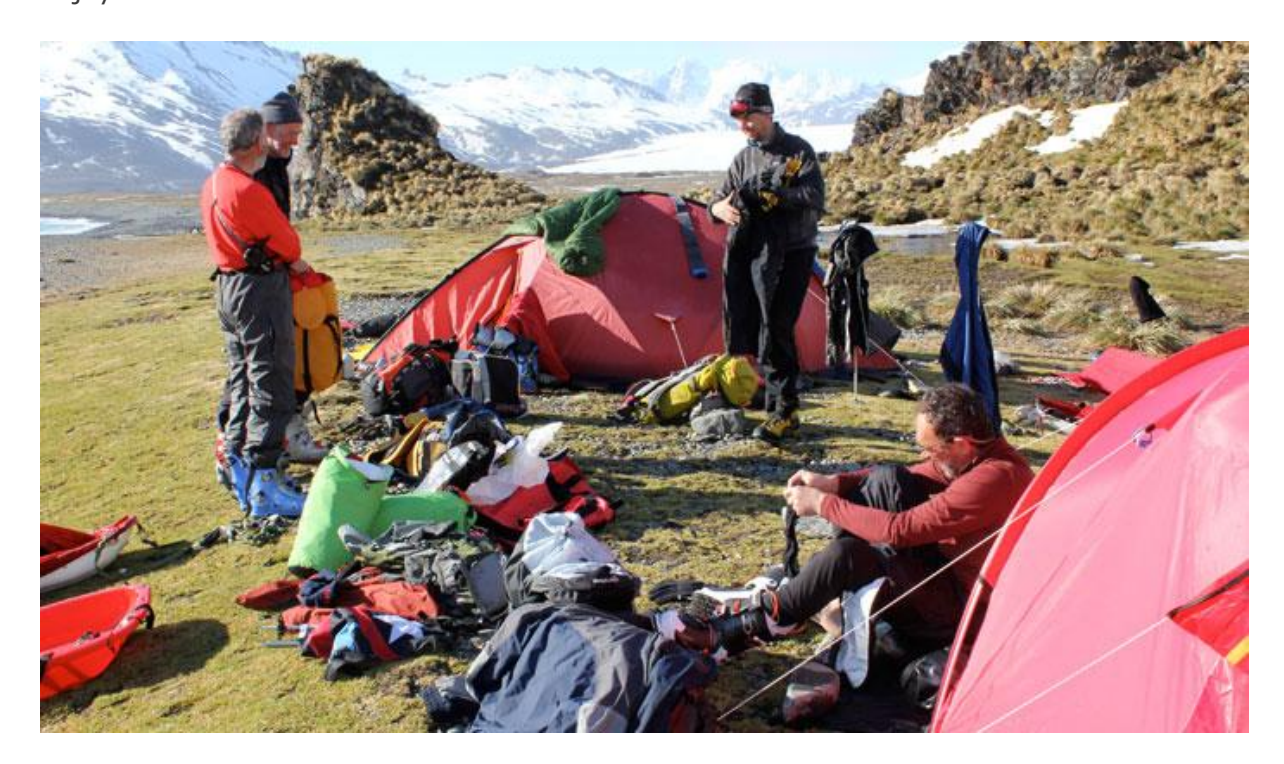
Drying out on the beach

consequently we lay prone in the tents for two nights and a day. Everyone said they enjoyed the rest!