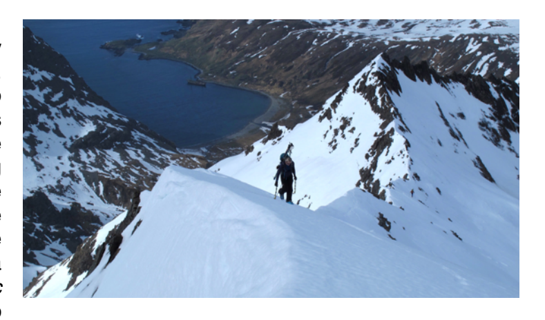
Kirsty Maguire on the ridge of Black Peak, above Ocean Harbour

A beautiful day, but with a big easterly blow forecast to arrive in the evening. While the crew motored back round to Cumberland East Bay, the rest of us made our way across by land to the Sörling Valley hut, some of us climbing various summits of Black Peak on the way. The ice glaze was so hard that we had to swap skins for crampons on the ascent, and the ski descent required a steady nerve. In the evening Pelagic Australis tied up at King Edward Point to avoid the being pinched at Grytviken.