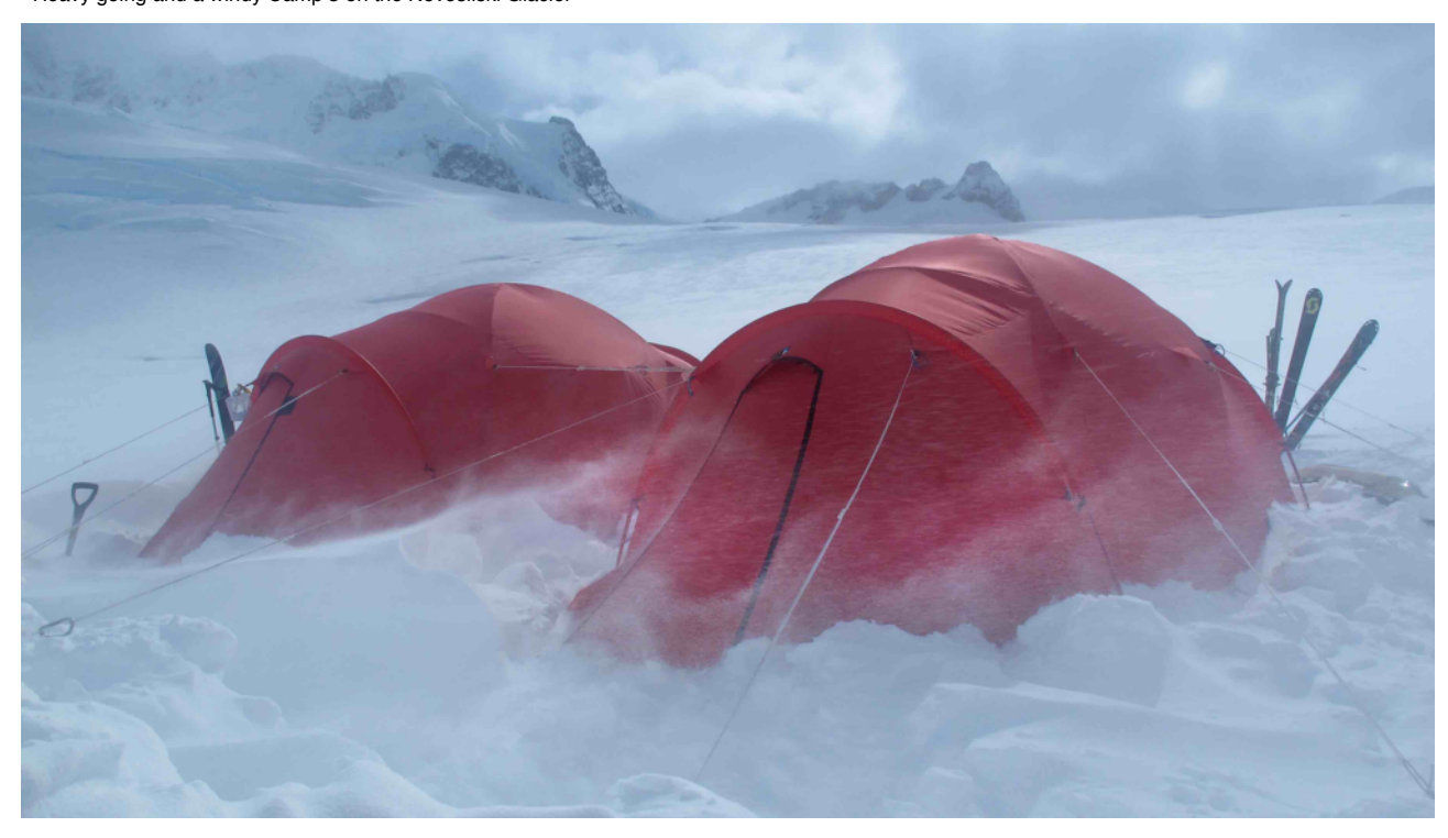
Heavy going and a windy Camp 3 on the Novosilski Glacier

A moderately fine day, but with the snow still unconsolidated it took us all morning just to travel 4 kilometres, at which rate we were unlikely cross the Spencely Col before nightfall. By way of a compromise, Charles and Stephen R climbed 200 metres towards the col to cache some of the gear and supplies, while the other three of us made Camp 3.