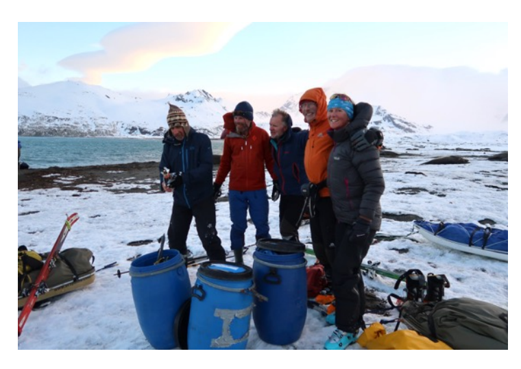
Champagne reception and immaculate sunrise at St Andrew's Bay

the lure of a possible roast beef dinner aboard Pelagic Australis was a strong incentive to get