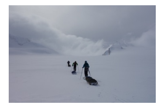
The Ross Pass

The race was now on to get down to St Andrew's Bay and set sail for Stanley with enough time to catch flights home. The wind on the Ross Pass was mercifully light, but thick cloud persisted on the far side, making the Ross Glacier descent very irksome. Travelling on compass bearings, it took until late afternoon to reach somewhere in the vicinity of the Ross-Webb junction, where we stopped to make Camp 6.