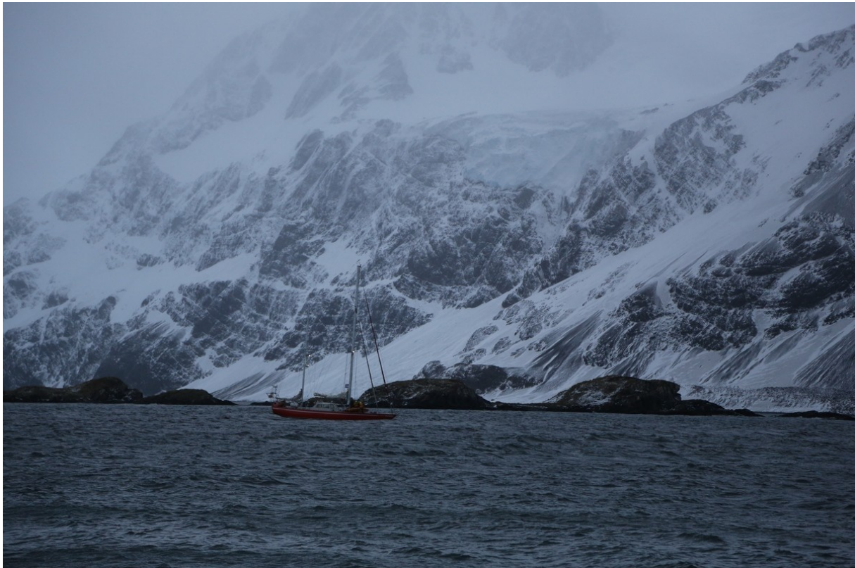
S/Y Selma Expeditions left Ushuaia on 9 October, and reached South Georgia on 17 October. Due to severe weather conditions in the King Haakon Bay area, we had to wait in the Elshul Bay for the