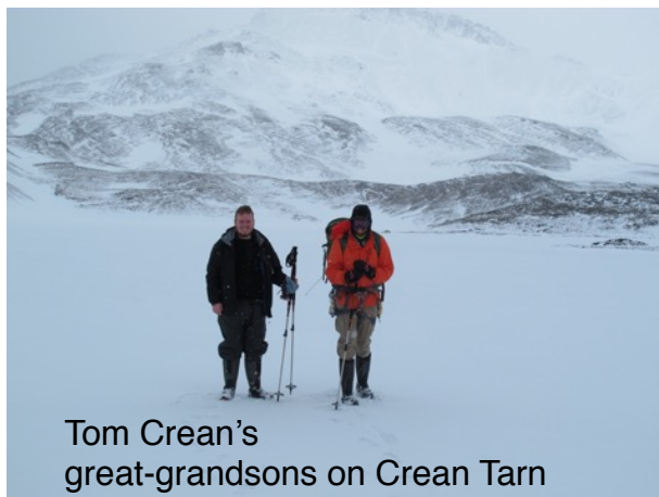
Tom Crean's great-grandsons on Crean Tarn

It was good to be on the move again, walking round the bay to the König river crossing and then up past Crean Tarn to the