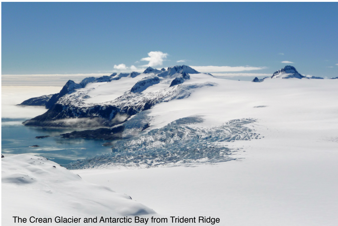
The Crean Glacier and Antarctic Bay from Trident Ridge

Alec Hazell (UK) - Skipper Giselle Hazell (South Africa)