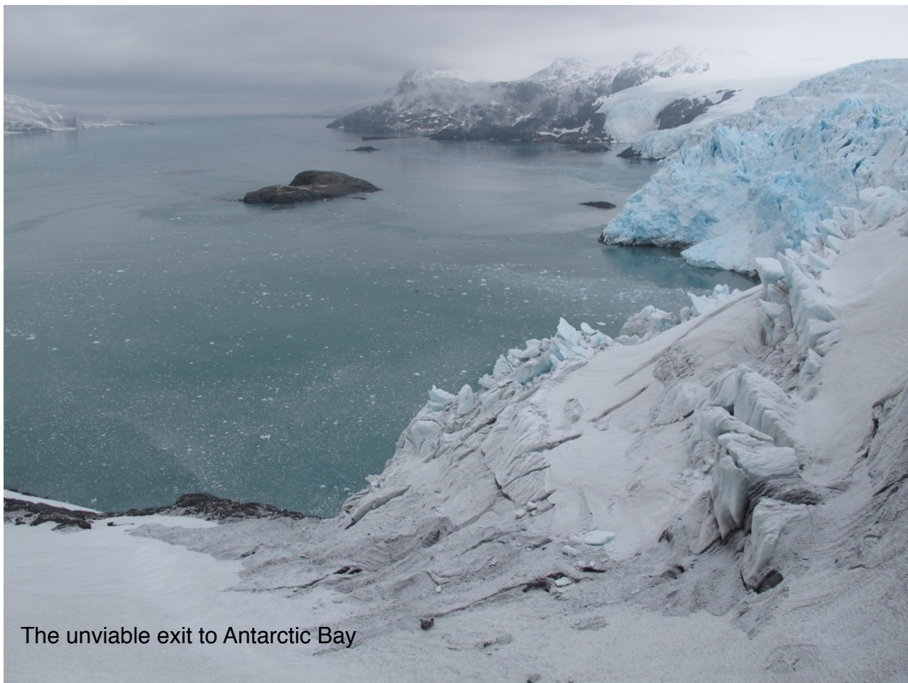
The unviable exit to Antarctic Bay

Hoping that it might be possible to evacuate Aileen from Antarctic Bay, Crag and Stephen were up at 04.30 and away by 05.00, skiing the 2 kilometres down to a point where they could look into the southwest corner of the bay. Although a French team had managed to use this access point in 2011, it was immediately obvious now that the long, steep ice and rock slopes dropping straight into the sea were totally unsuitable for a team of mainly novice mountaineers lowering a casualty. So Crag and Stephen returned to camp to awake the others for breakfast and prepare them for along day's haul towards the only viable exit at Fortuna Bay.