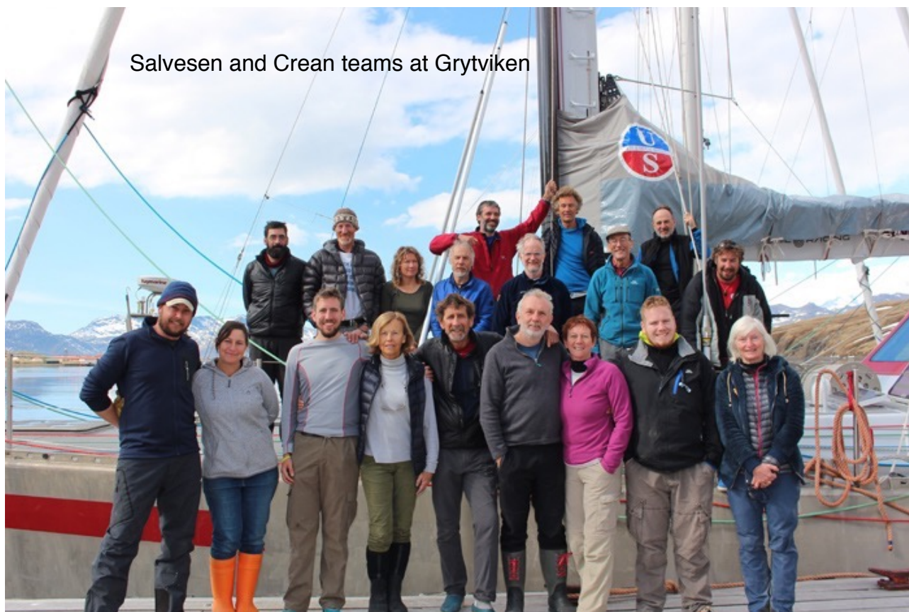
Salvesen and Crean teams at Grytviken