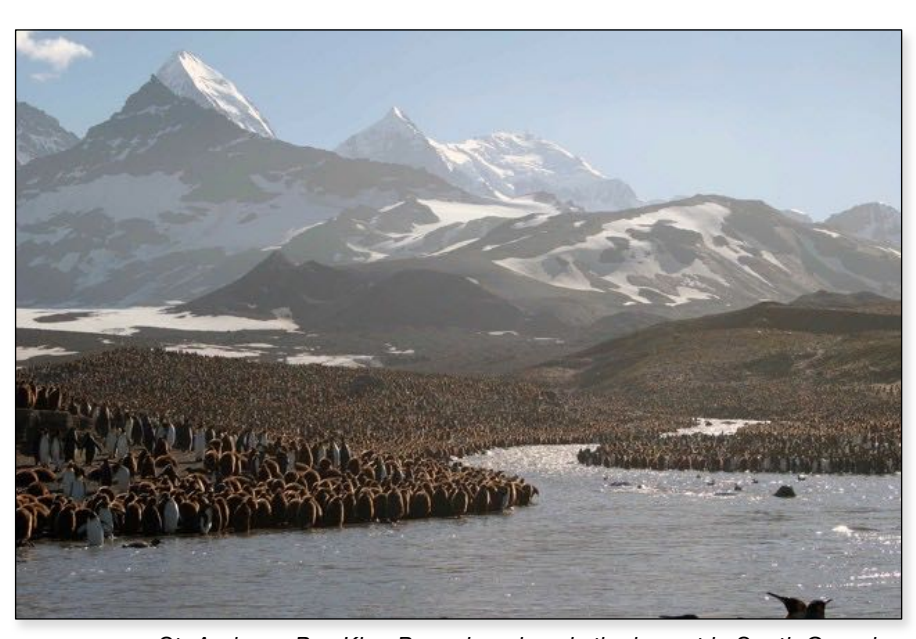
St. Andrews Bay King Penguin colony is the largest in South Georgia