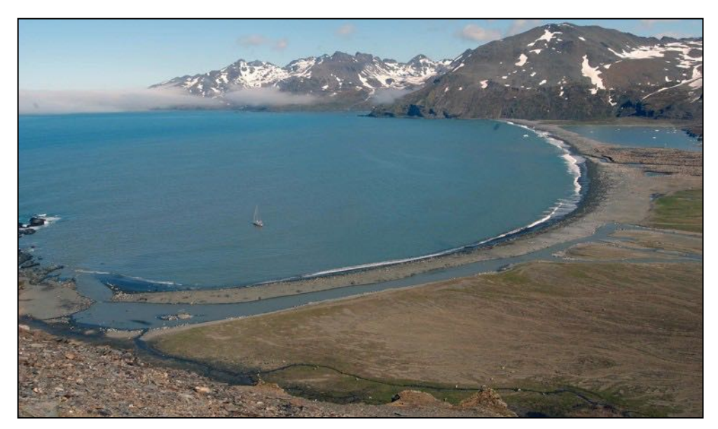
St Andrews Bay