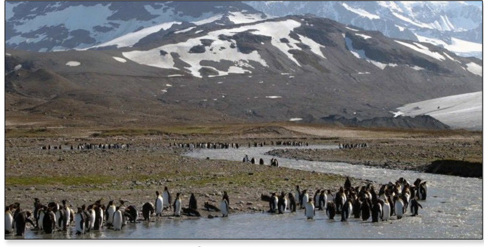
Glacial meltwater streams can be deep and fast flowing