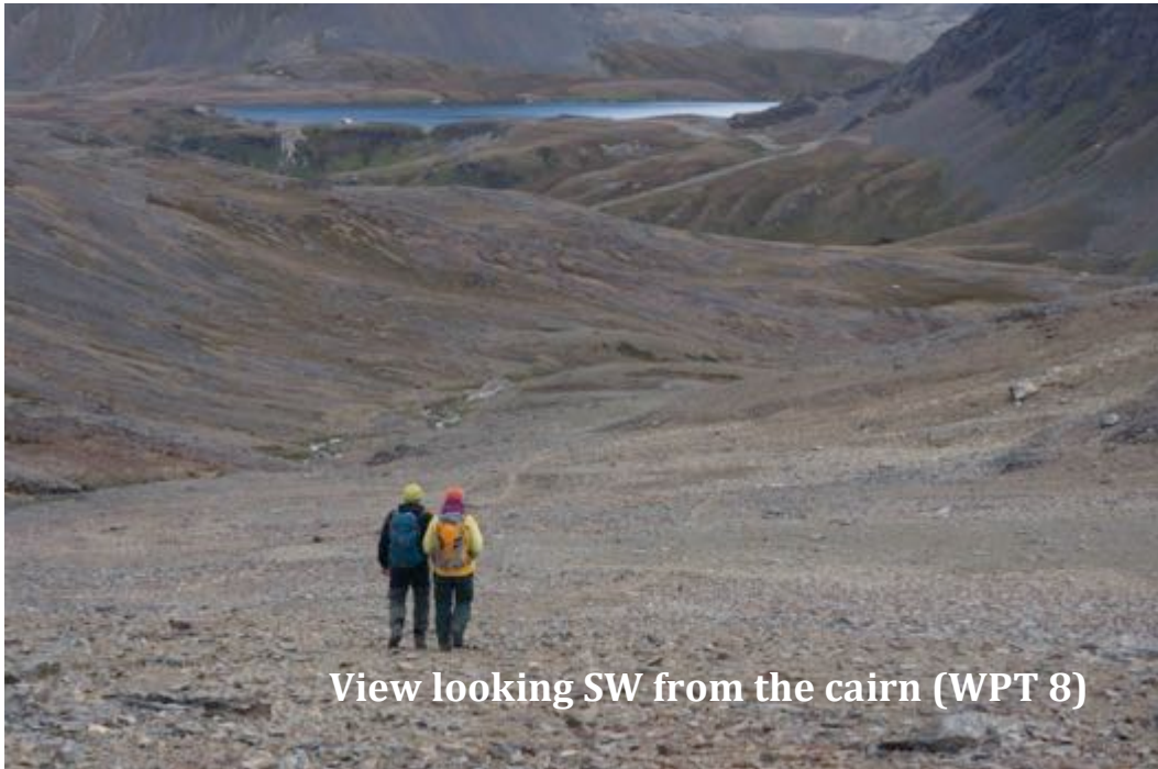
View looking SW from the cairn (WPT 8)

From the cairn, in good visibility the waters of Gull Lake can be seen to the south. Gull Lake lies above Grytviken. The path is not immediately obvious. Follow the valley leading SW, keeping to the west side of the stream.