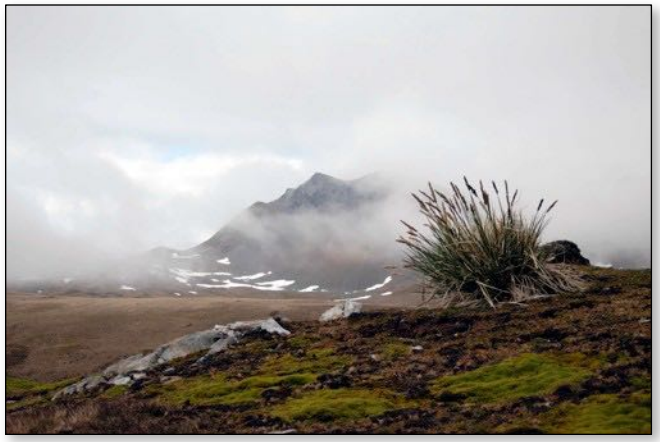
Mixed vegetation on the slopes above the landing beach

All landings must comply with GSGSSI biosecurity measures and rigorous self-audit checks must be carried out prior to landing.