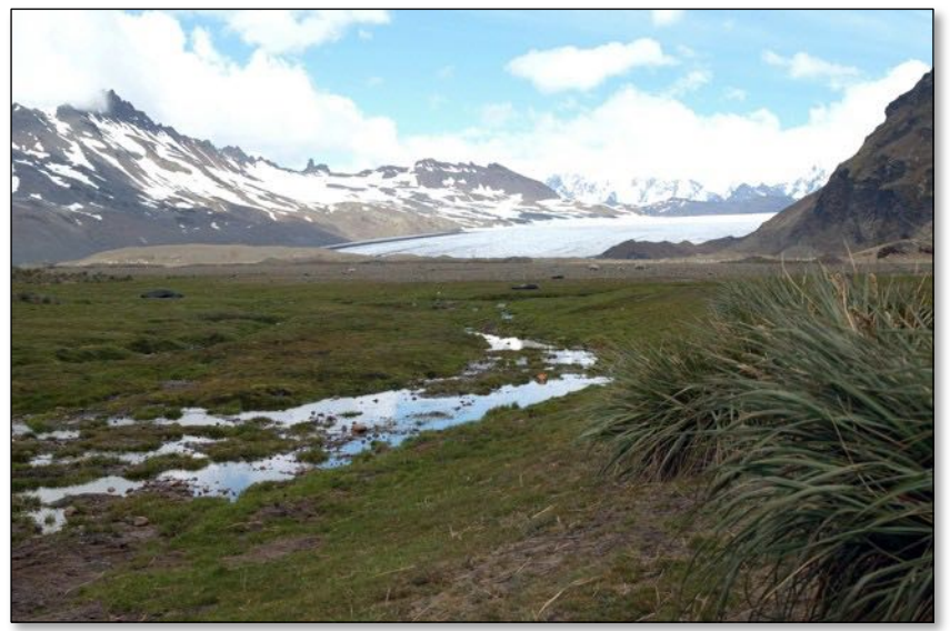
View towards king penguin colony and König Glacier