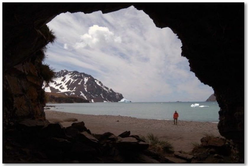
View from sealers cave. Be careful not to disturb the rockwall.

Beach area between Whistle Cove and the large river outlet midway along the head of the bay.