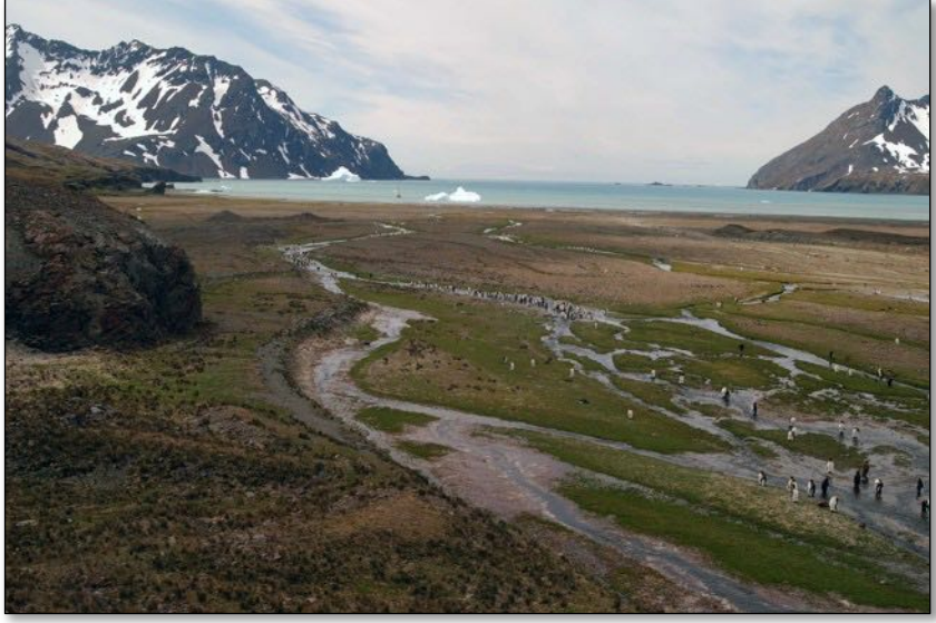
View towards Fortuna Bay showing braided river