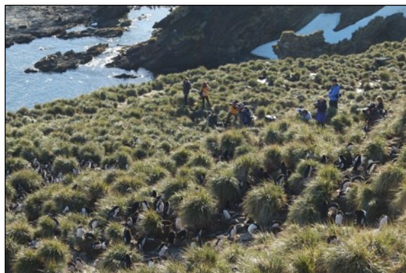
Visitors in viewing area

Note that it may not be possible to land at certain times due to heavy concentrations of fur seals.